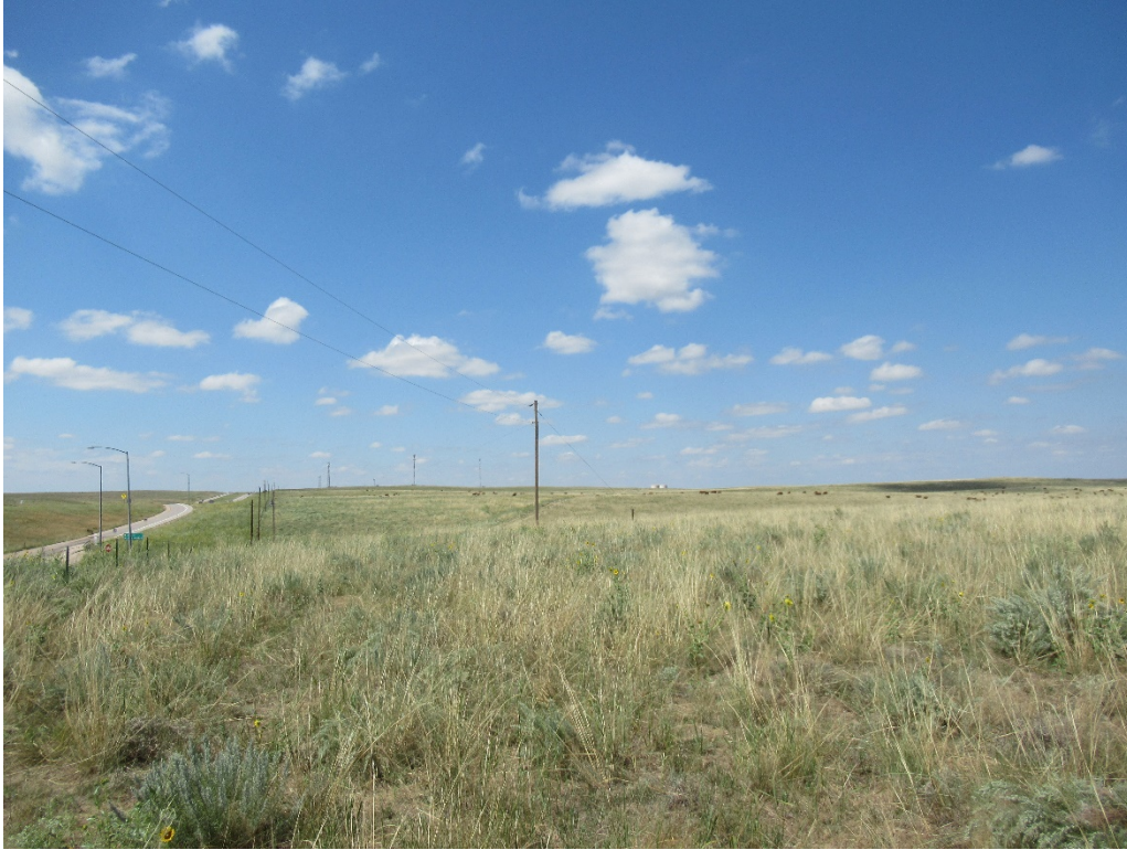
View of site from the SE corner of Section 11 looking west