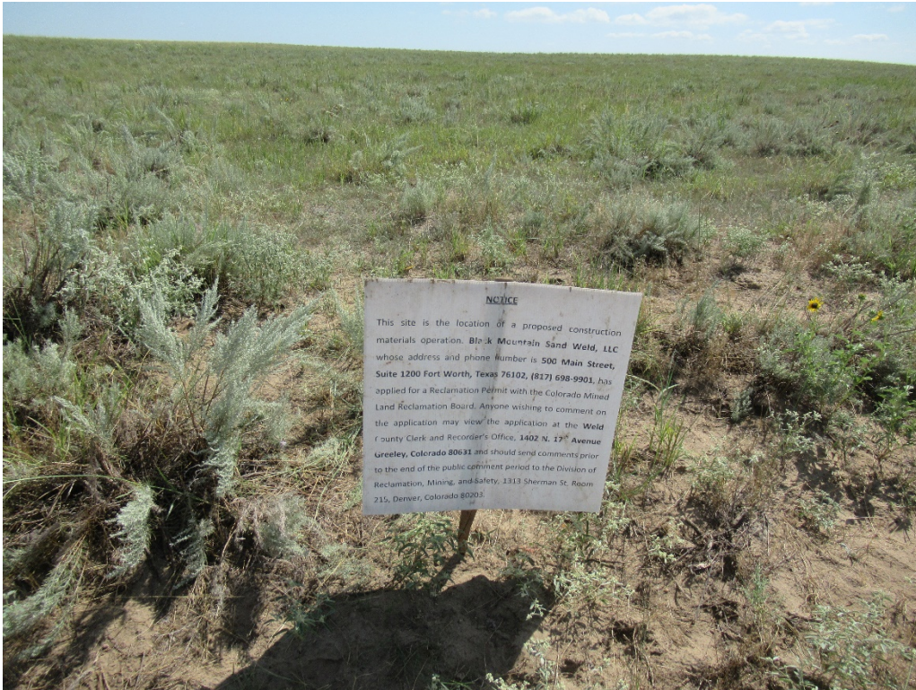
Typical notice sign along County Road 61