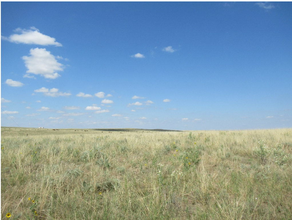
View of site from the SE corner of Section 11 looking northwest