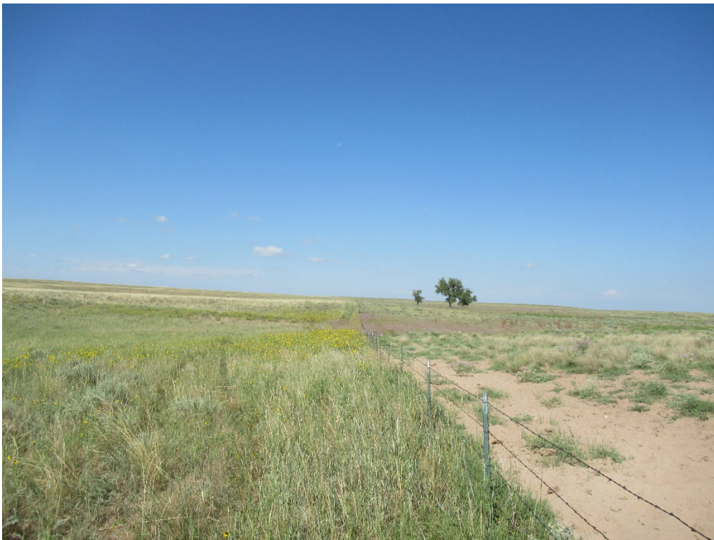
View of site from the NE corner of the NE quarter section of Section 3 looking west