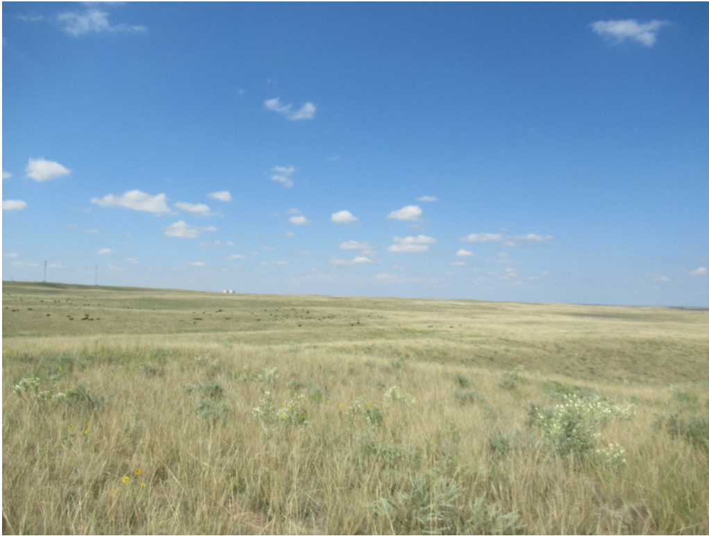
View of site from the NE corner of the SE quarter section of Section 11 looking southwest