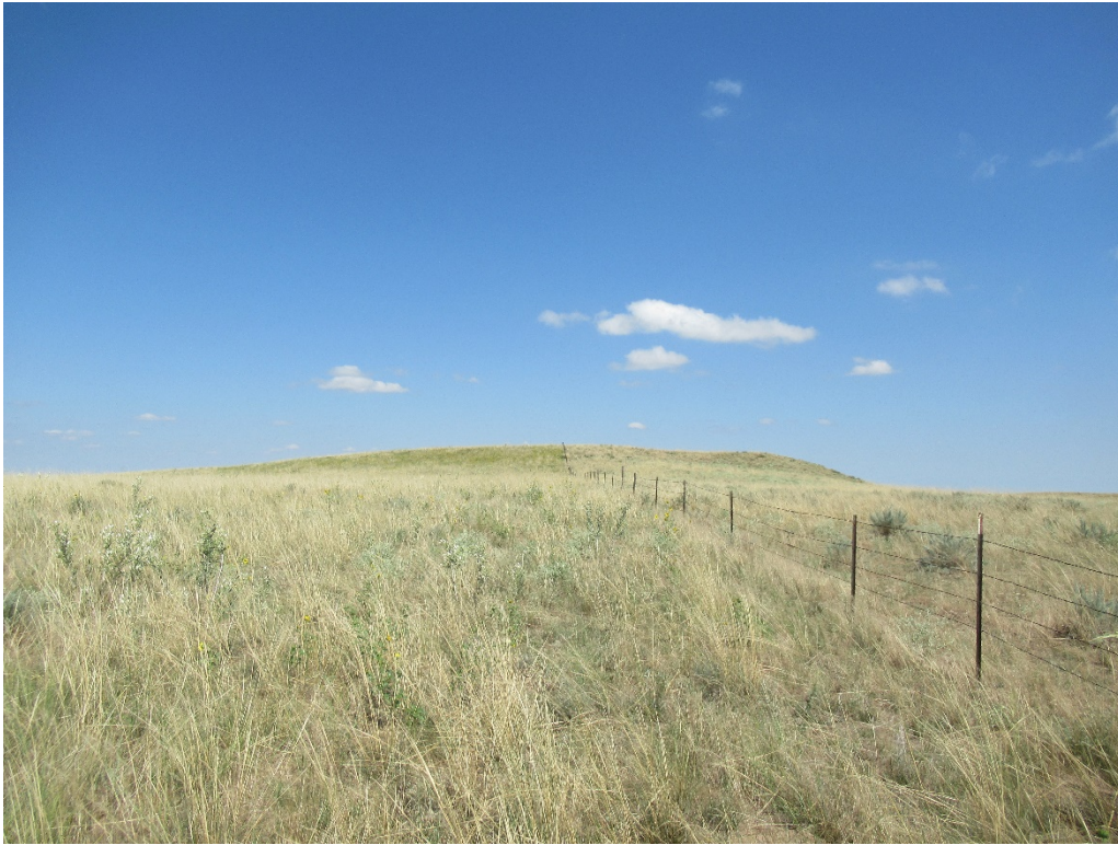
View of site from the SE corner of Section 11 looking north