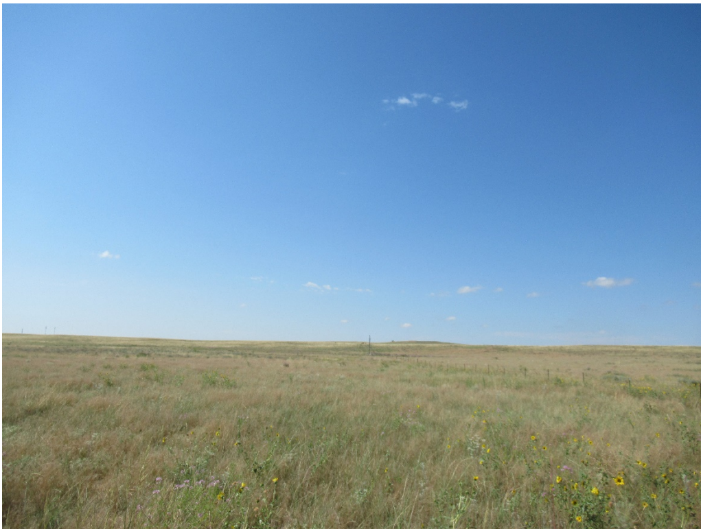
View of site from the NW corner of the NE quarter section of Section 3 looking south