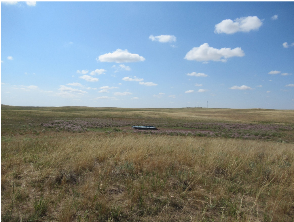
View of typical stock pond on the site