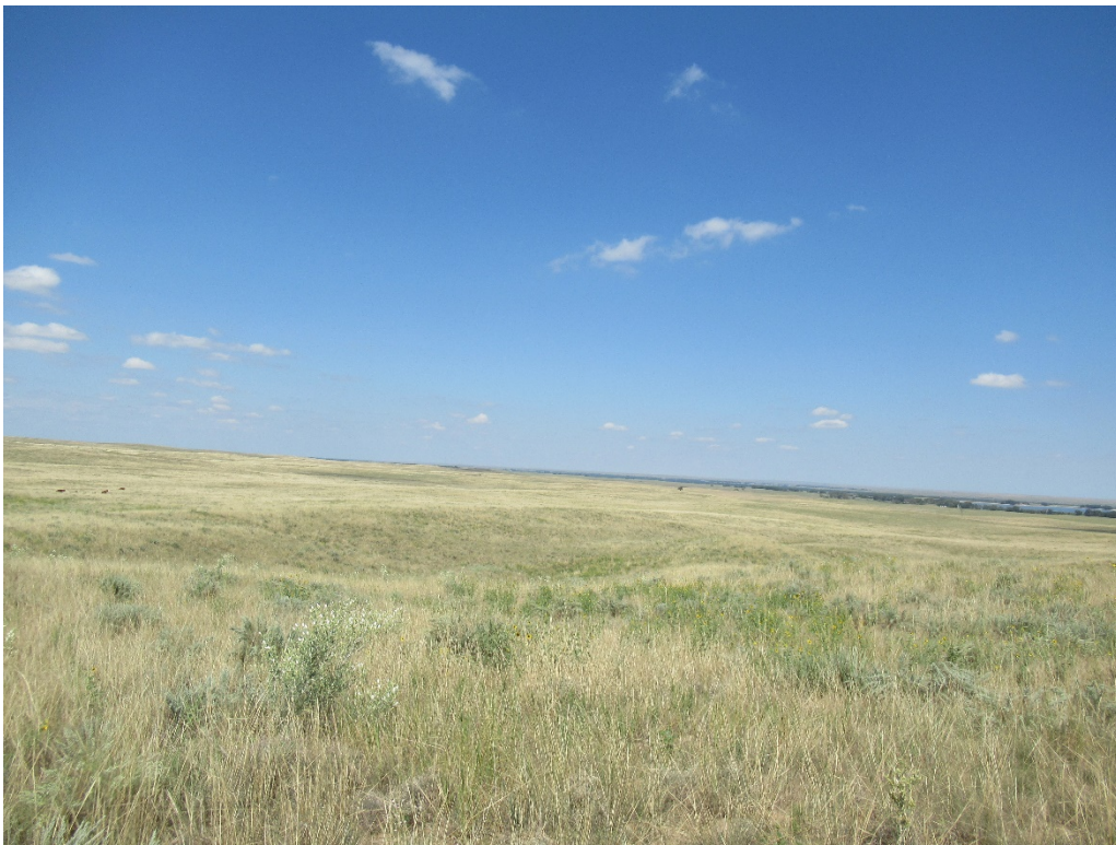
View of site from the NE corner of the SE quarter section of Section 11 looking northwest