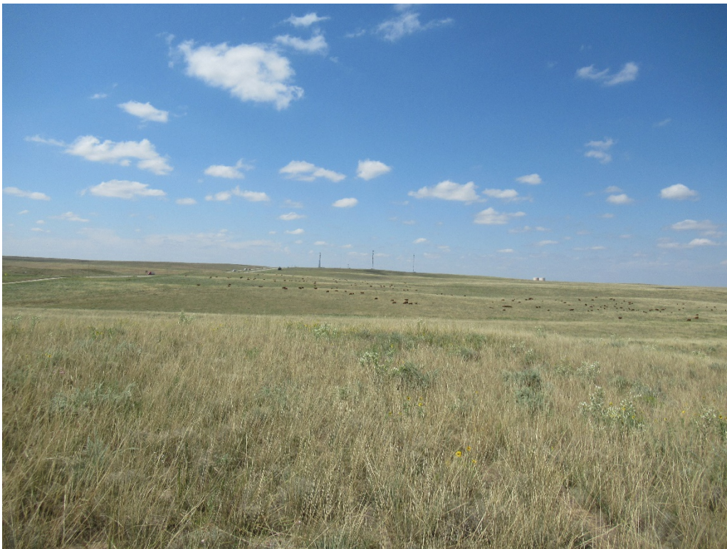
View of site from the NE corner of the SE quarter section of Section 11 looking south