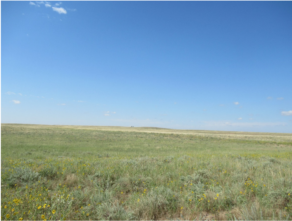
View of site from the NE corner of the NE quarter section of Section 3 looking southwest