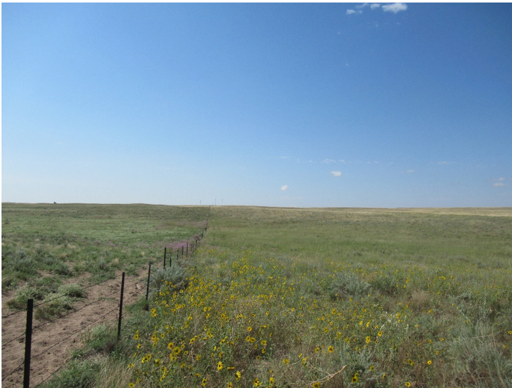
View of site from the NE corner of the NE quarter section of Section 3 looking south