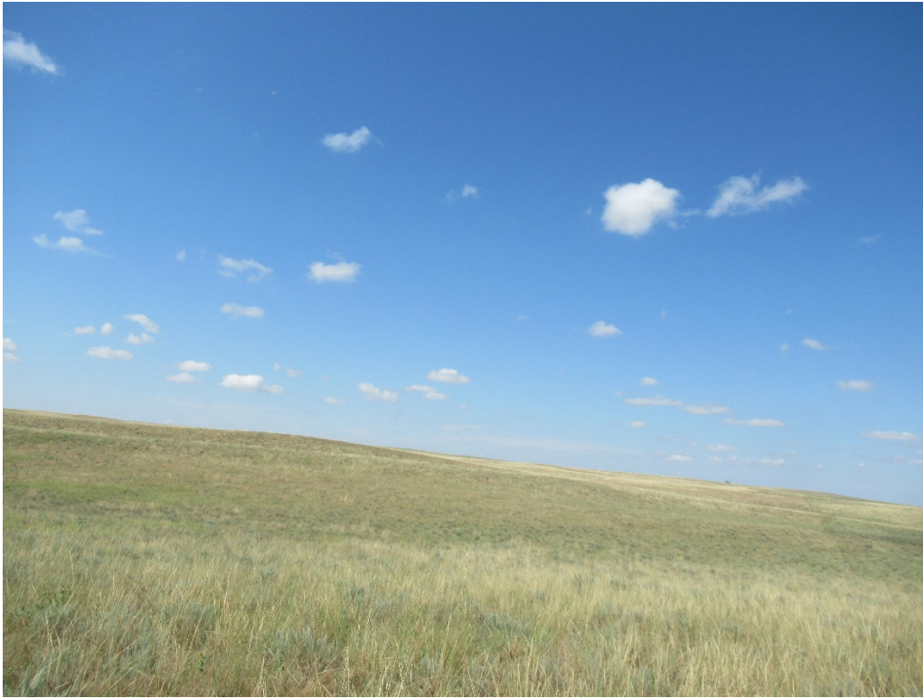
View of site from the NE corner of the SE quarter section of Section 3 looking southwest