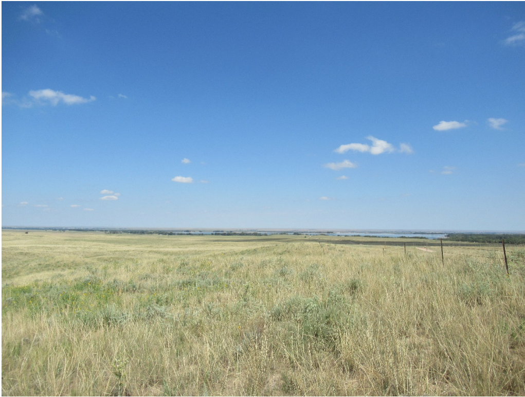
View of site from the NE corner of the SE quarter section of Section 11 looking north

Brittany Schamaun Black Mountain Sand Weld LLC 500 Main St, Suite 1200 Fort Worth, TX 76102