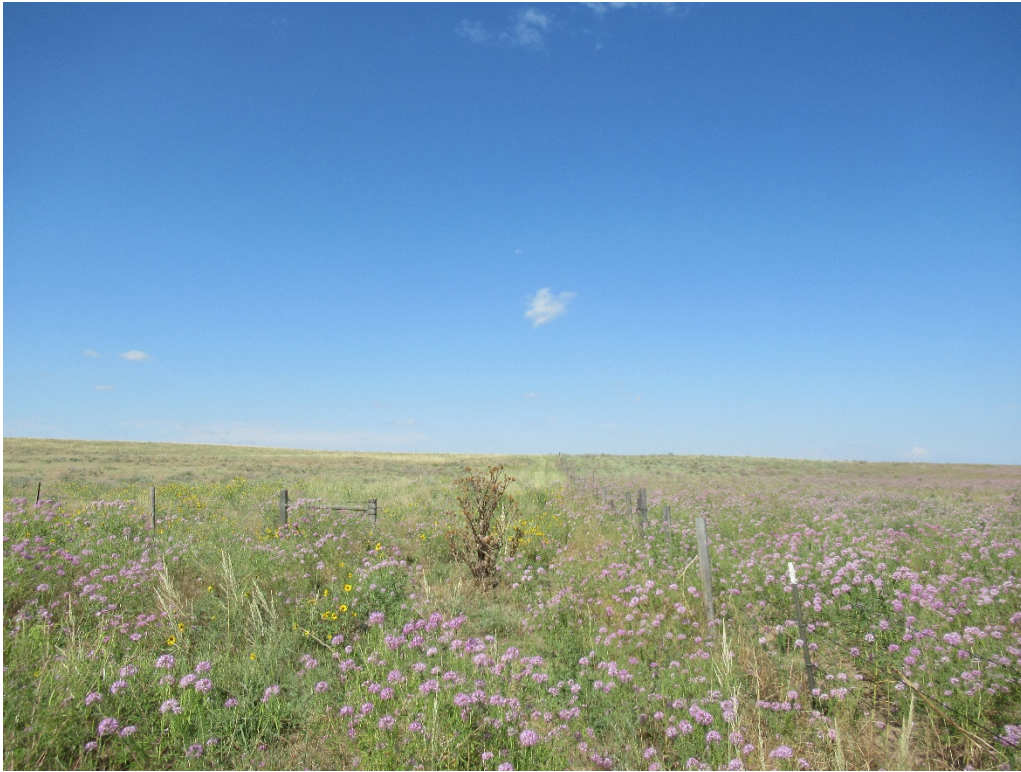
View of site from the NW corner of the NE quarter section of Section 3 looking west