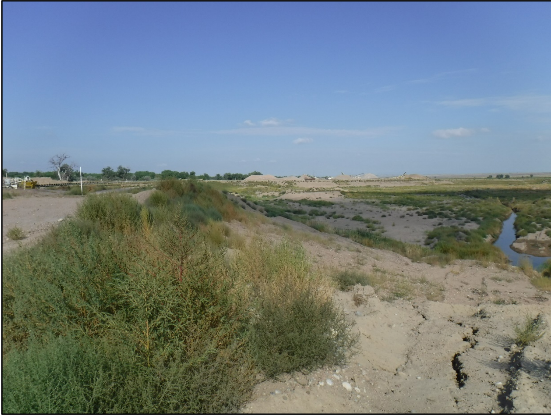
Photo 9: Area near where the spillway is to be constructed, looking west