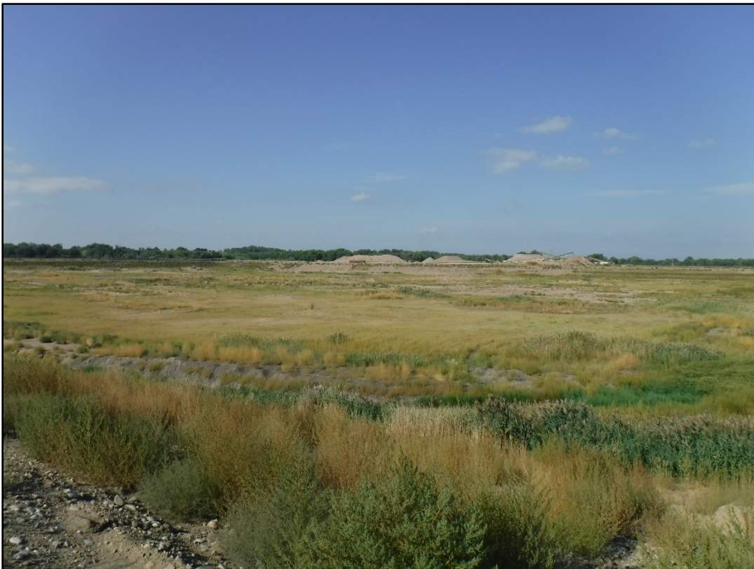
Photo 6: Looking southwest towards the southwestern corner of pond