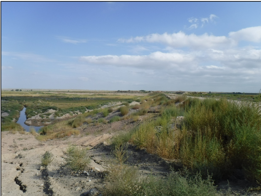
Photo 8: Area of where the spillway is to be constructed, looking north