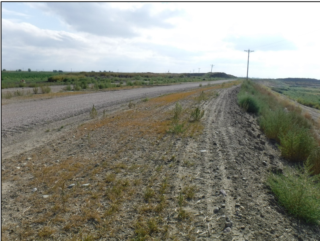
Photo 4: Looking east along the northern boundary of pond, note revegetation planted earlier this year