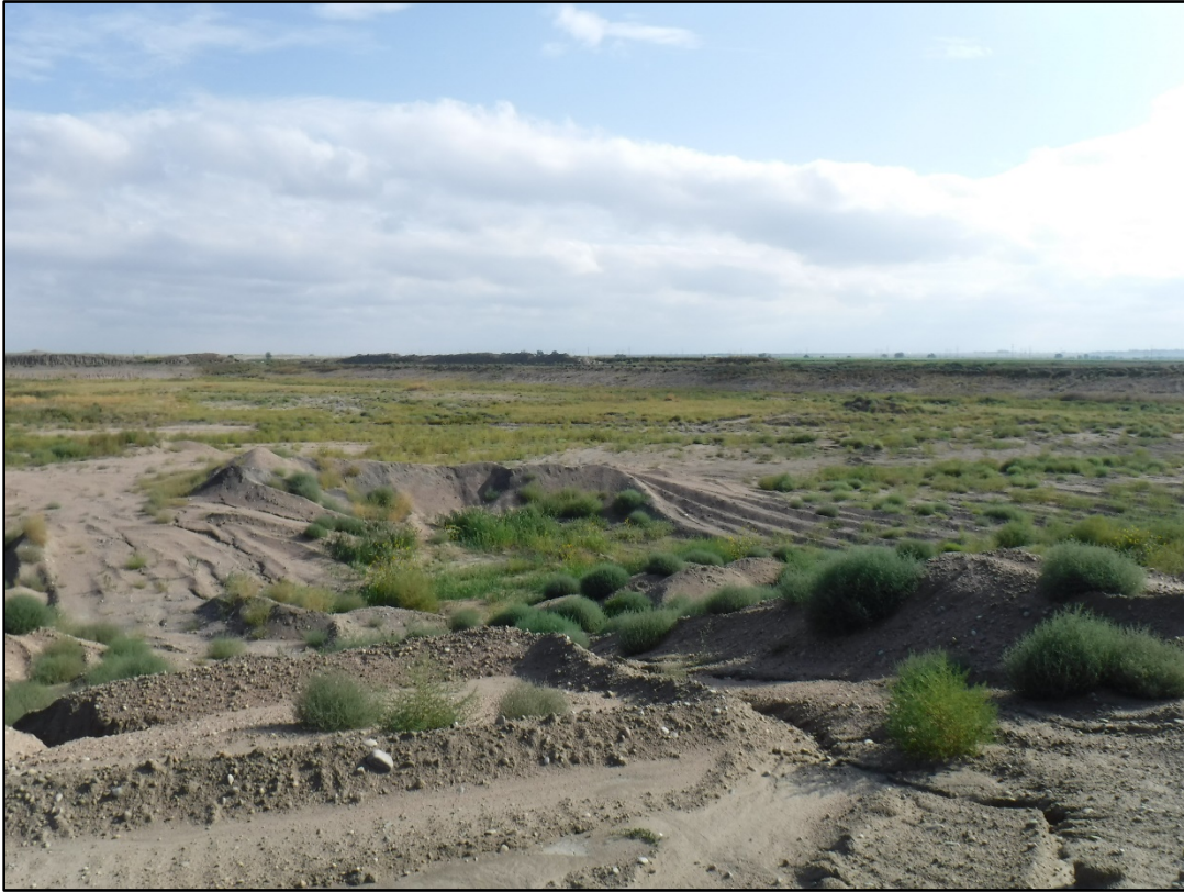
Photo 3: Looking to the northeast corner of pond from the southern boundary of pond