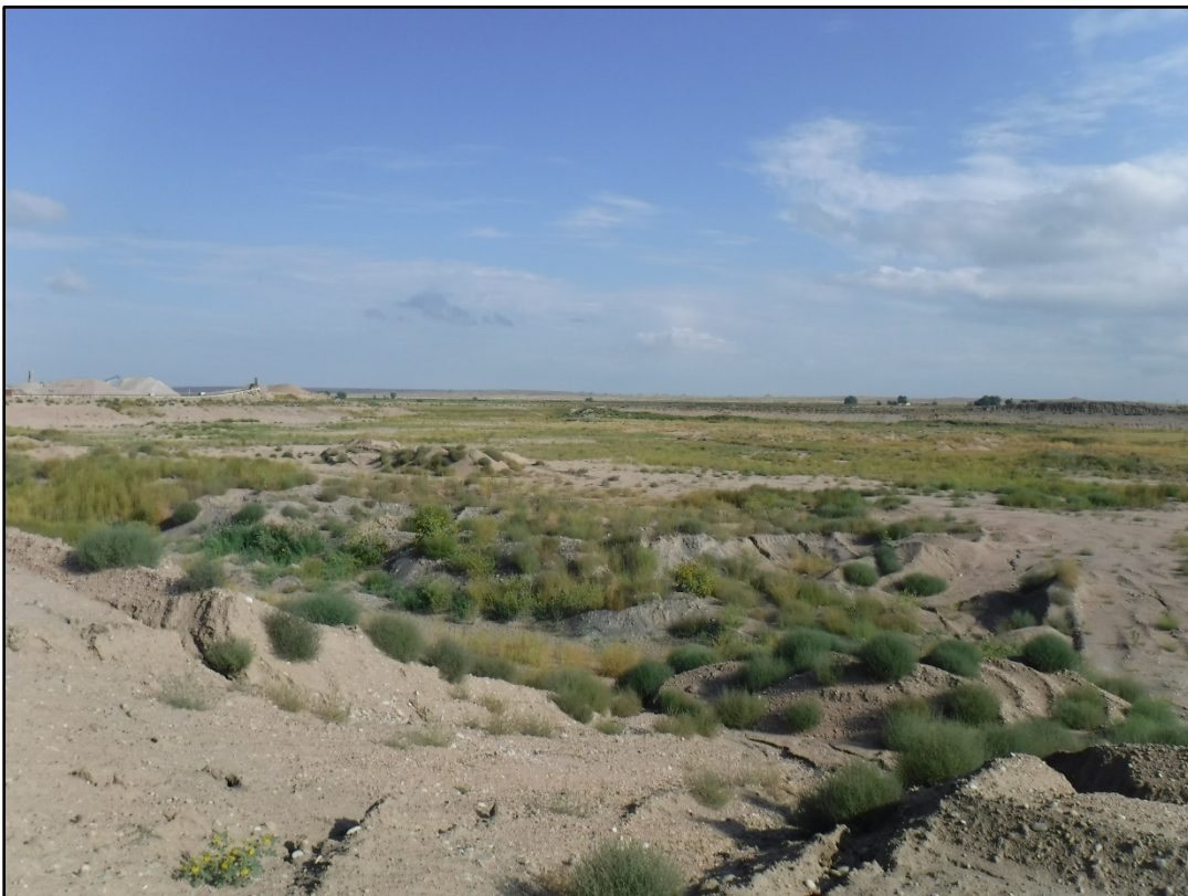
Photo 2: Looking northwest across the pond from near the southeastern corner