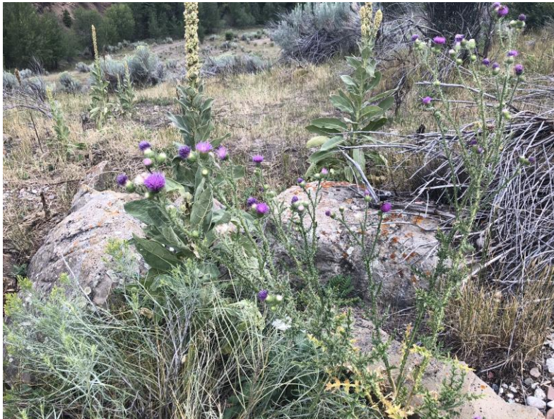
Thistle on hillside above ponds

Number of Partial Inspection this Fiscal Year: 1