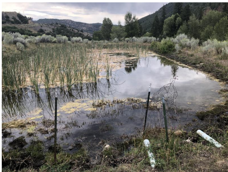
Treatment Pond T-1

Number of Partial Inspection this Fiscal Year: 1