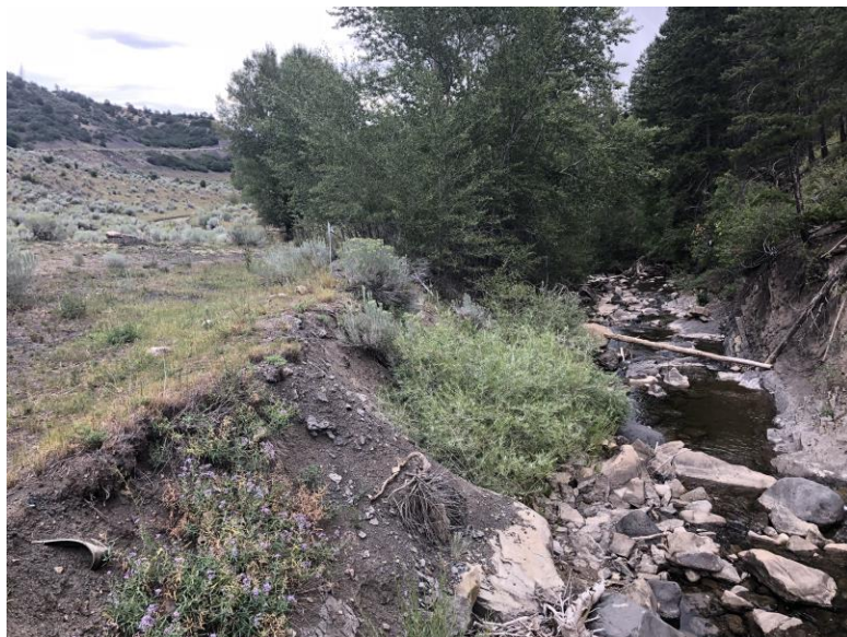
North Thompson Creek next to the mine site