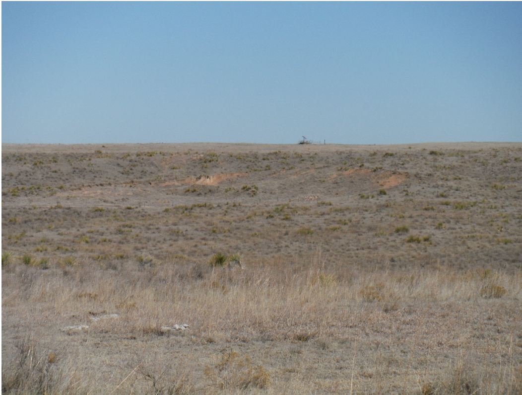
Pre-law disturbance east of the eastern permit boundary; looking east.

Don Marr Yuma County 1310 S. Blake Street Wray, CO 80758