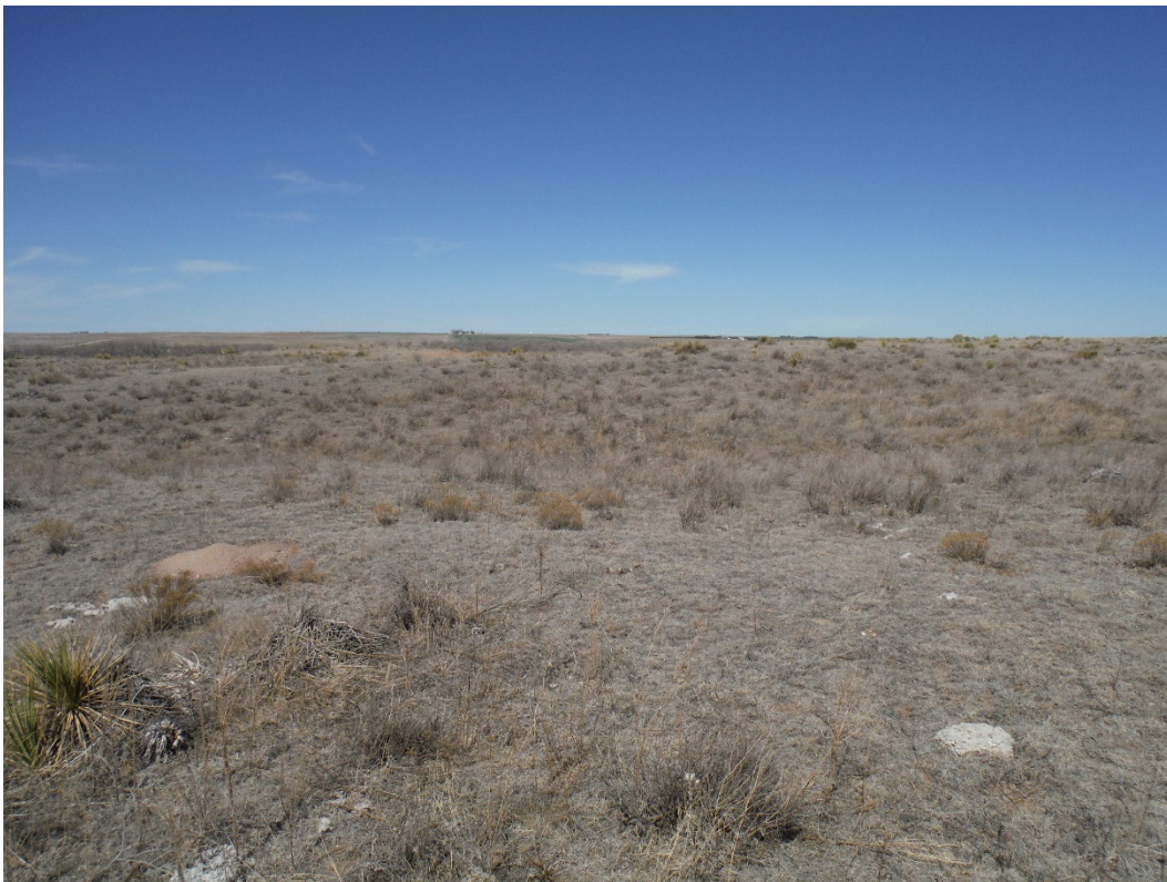
Sample photo of pre-permit conditions; looking north.