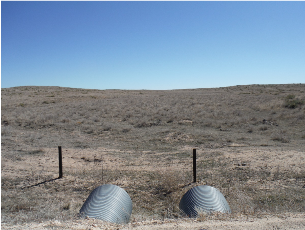
Sample photo of pre-permit conditions; looking south from County Road 2.