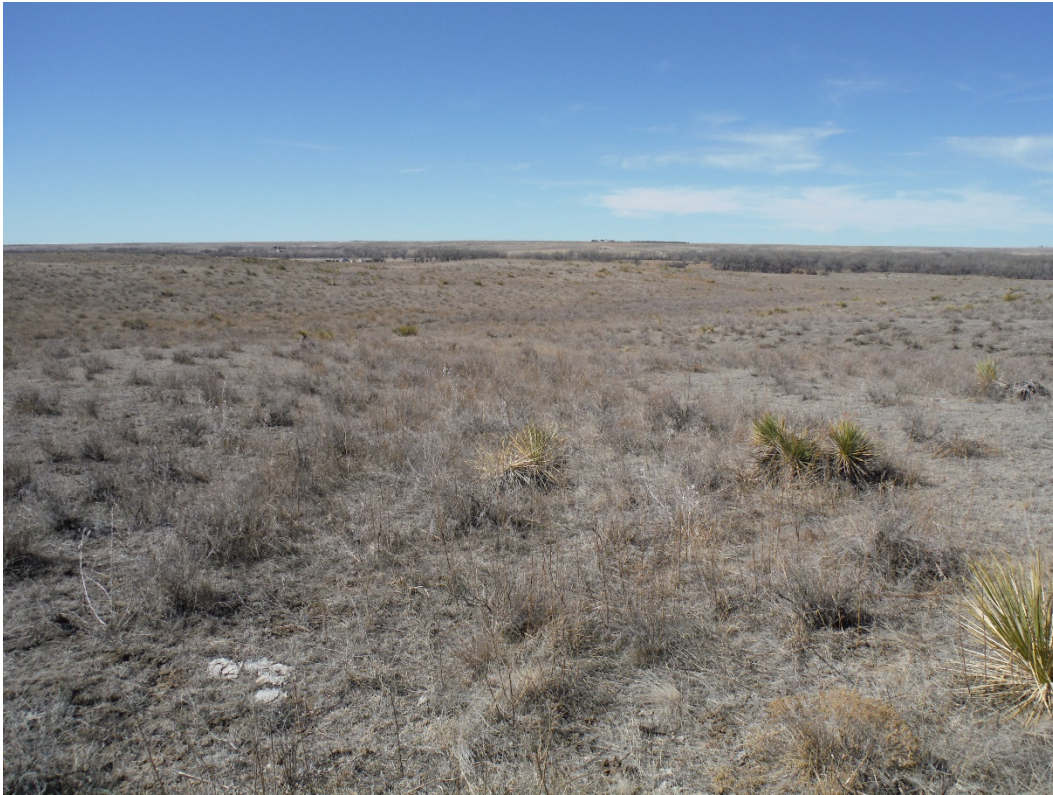
Sample photo of pre-permit conditions; looking northwest.