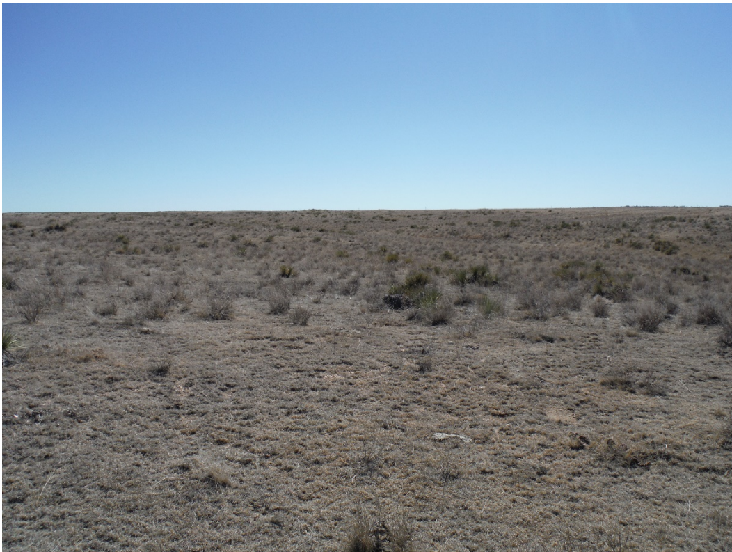
Sample photo of pre-permit conditions; looking south.