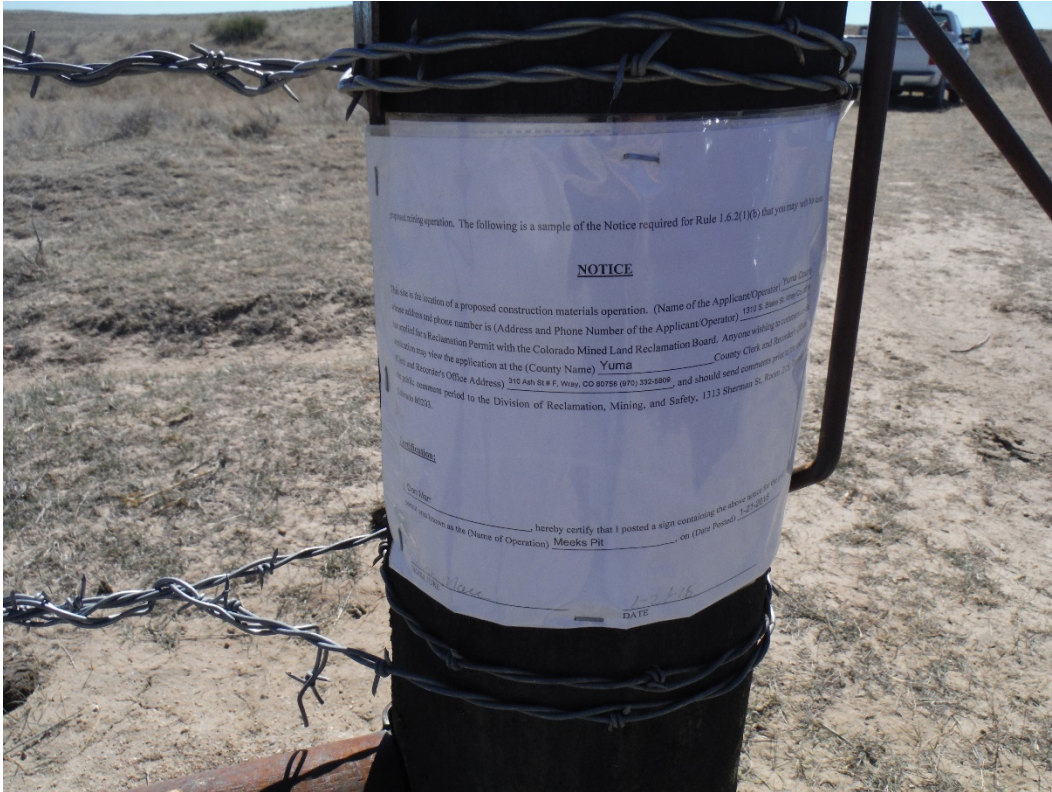
On-site notice; looking south.