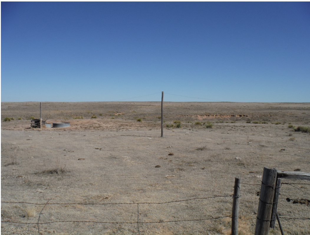
Sample photo of pre-permit conditions; looking east from County Road CC.