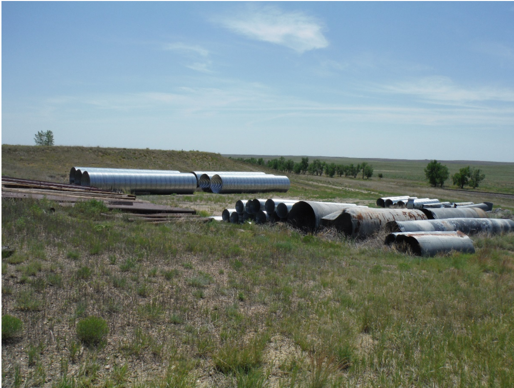
Culvert laydown/storage area located in northwest corner of the site; looking south.

Victor Gibbs Cheyenne County P.O. Box 567 Cheyenne Wells, CO 80810