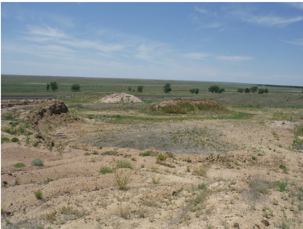
Most recently active pit in southeast portion of the site; looking west.