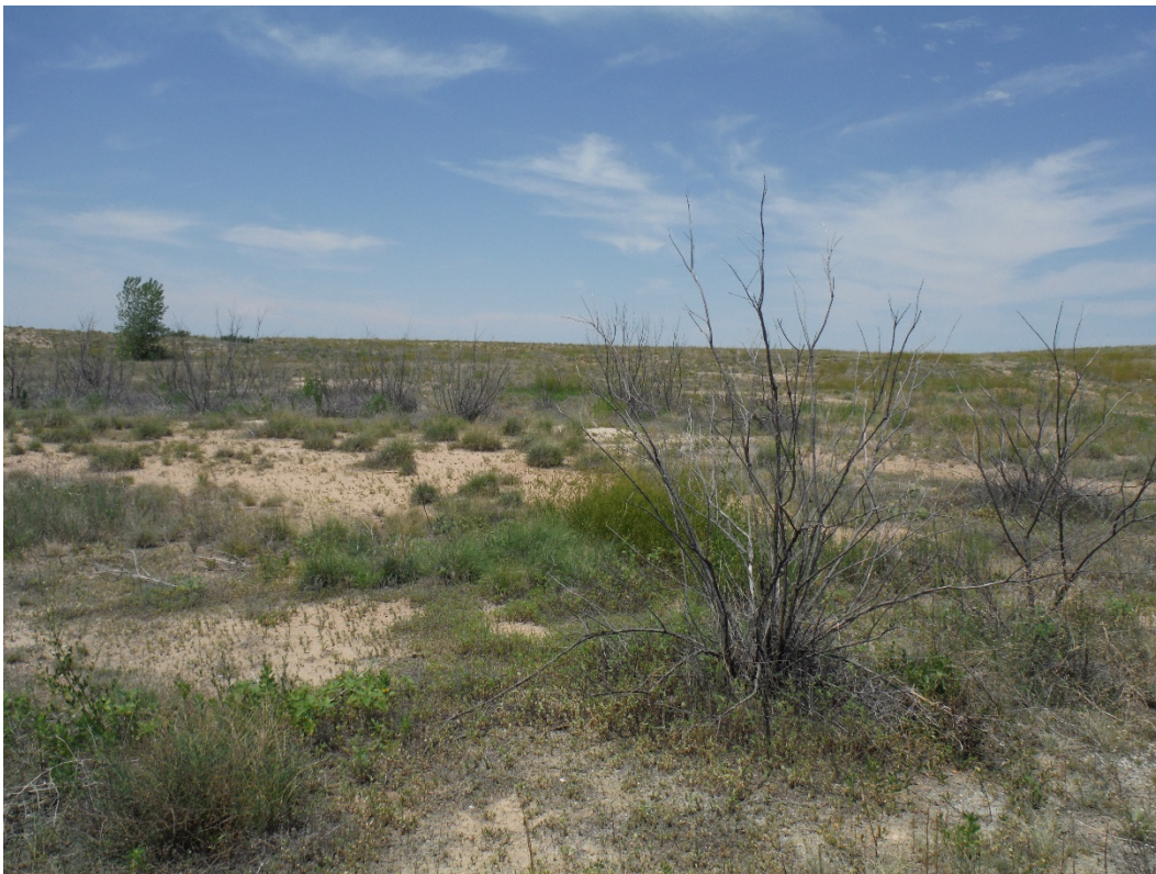
Treated tamarisks in central portion of the site; looking southeast.