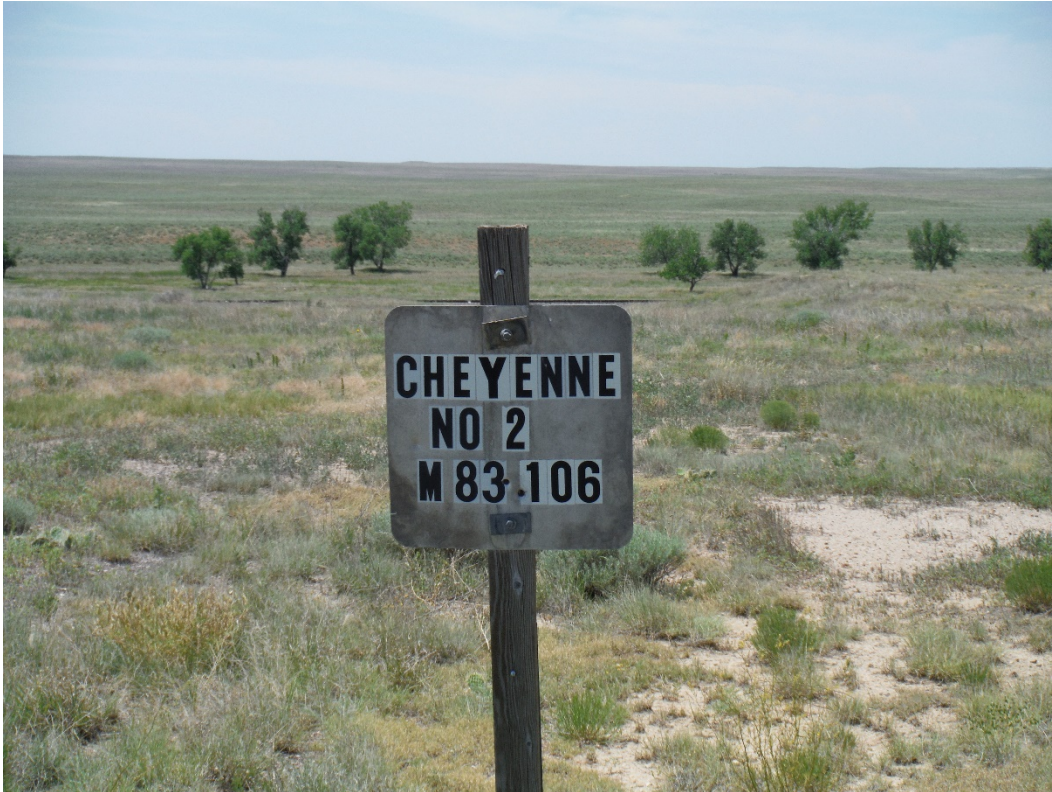
Mine identification sign; looking southwest.