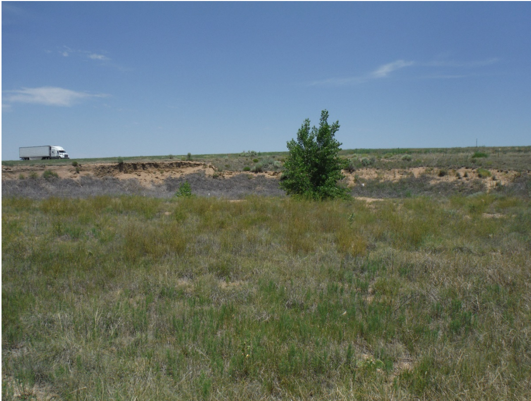
Small pit along north of the entrance; looking north.