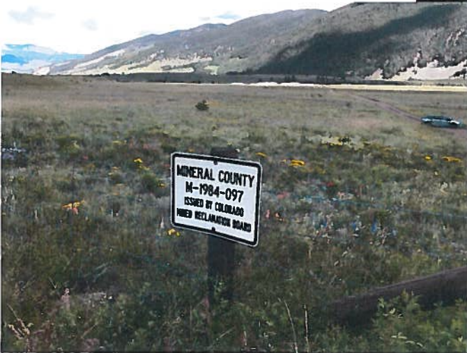
Mine ID Sign