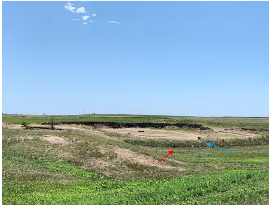
Permit boundary marker (red arrow) and topsoil pile (blue arrow)

Jeff Sprague JC Farms Inc. 55184 Co Rd 22 Yuma, CO 80759