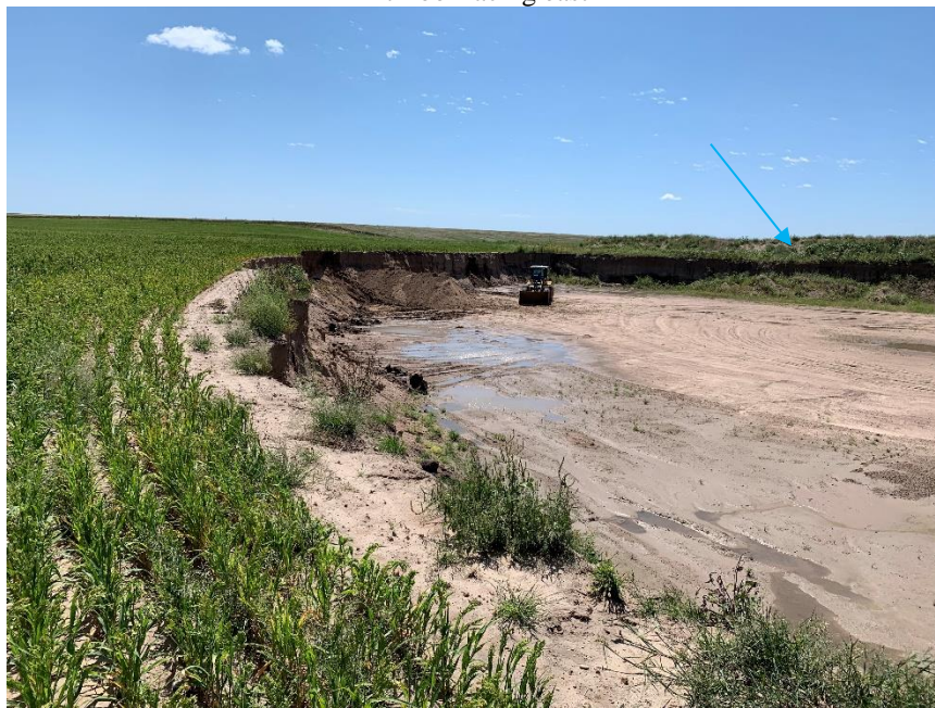
Highwall area and topsoil stockpile on right side