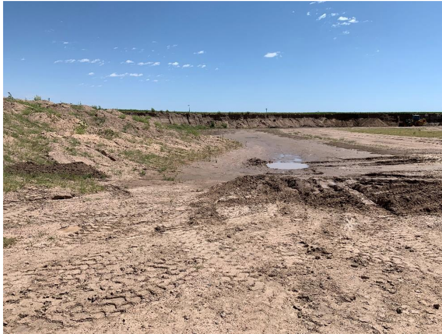
Pit floor facing east