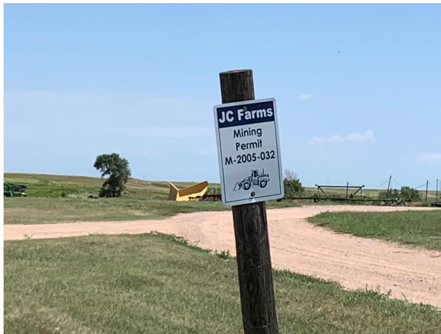
Mine entrance sign on County Road ZZ