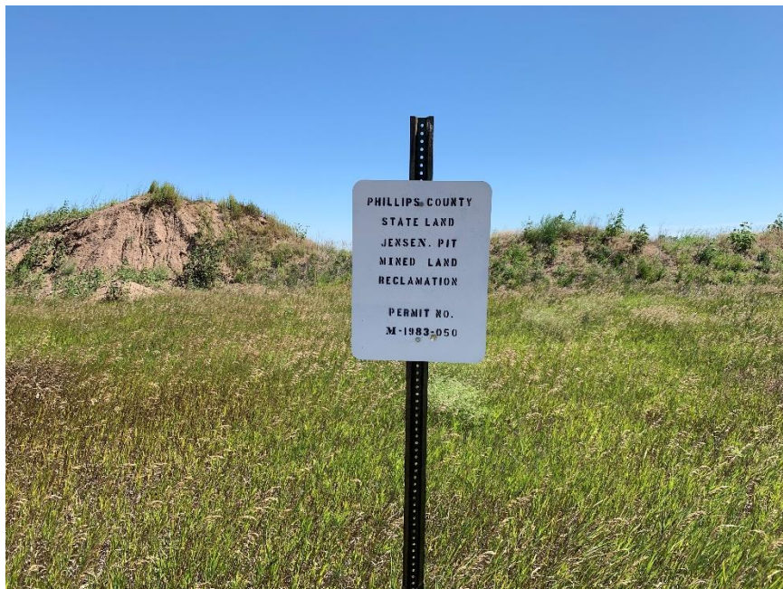
Mine entrance sign facing County Road 41