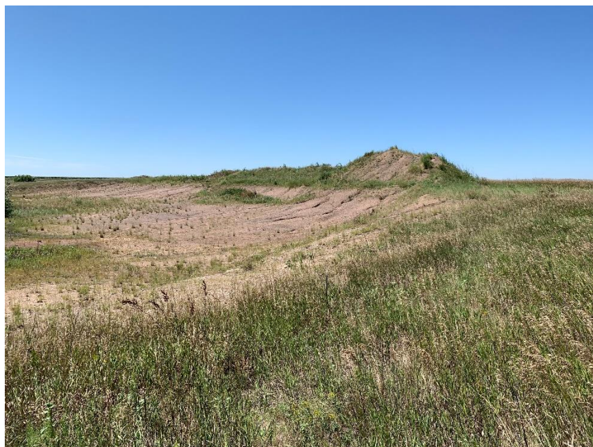
Gravel pile pushed to west side of pit area.