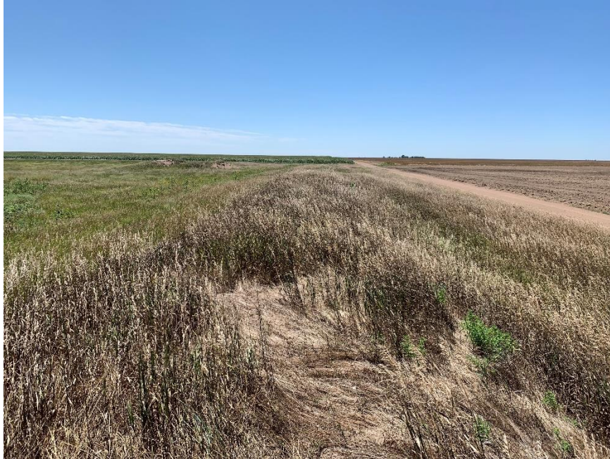
Topsoil stockpile along County Road 41. Picture facing south