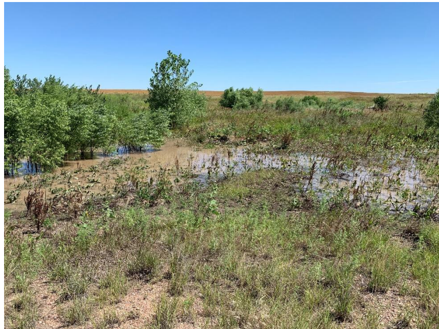
Standing water in the bottom of Dry Creek. Picture facing east.