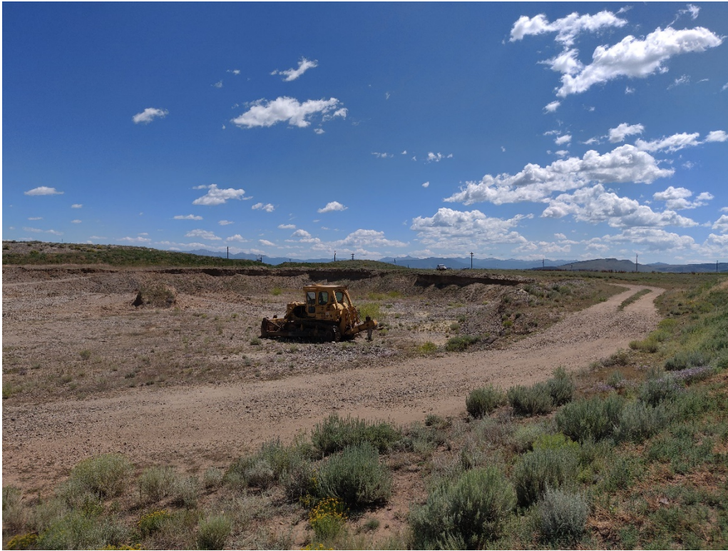
View of site from the southwest corner looking northeast