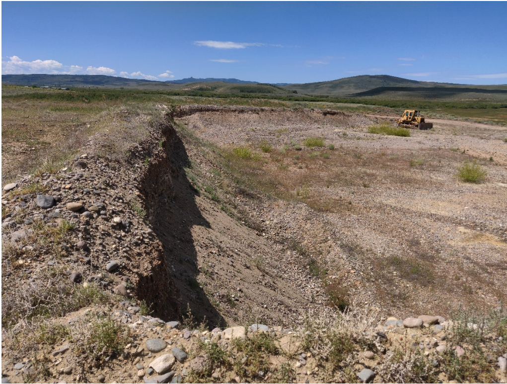
View of the east highwall looking southwest