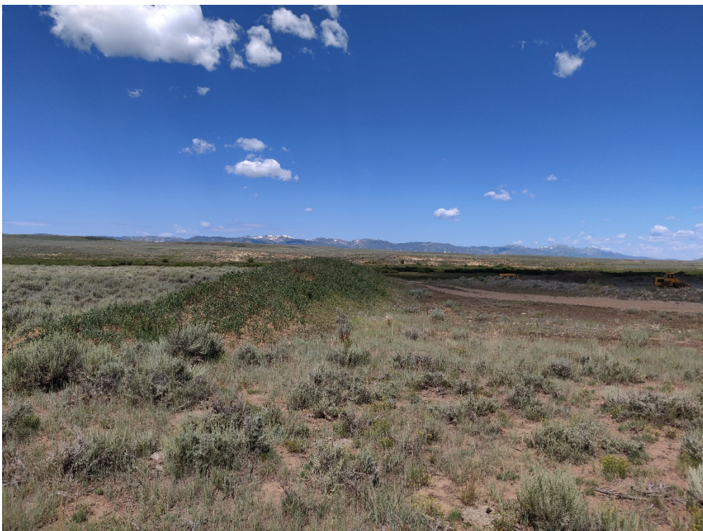
View of topsoil stockpile adjacent to the south permit boundary