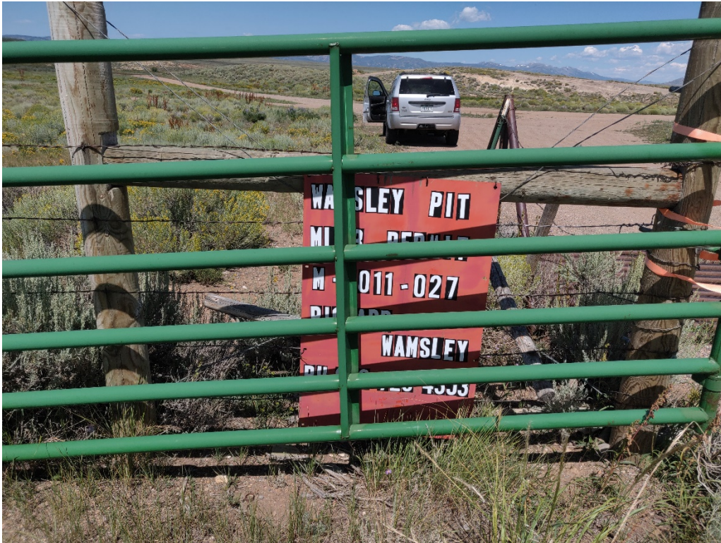
Wamsley Pit mine sign