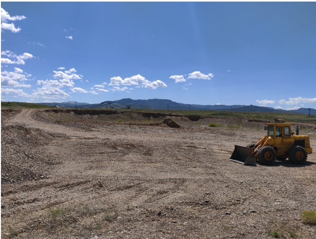
View of the site from the northwest corner looking east