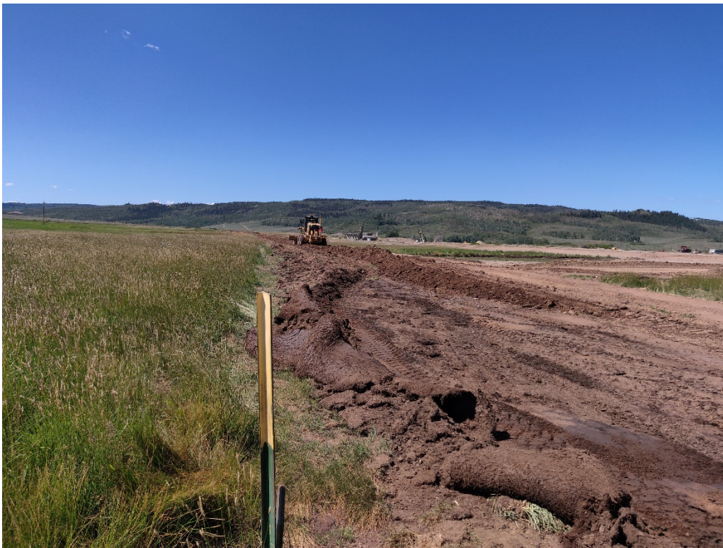
View of the topsoil replacement in the north mining area from the northeast corner of the site