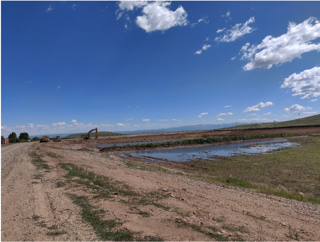
View of the north mining area from the access road looking north