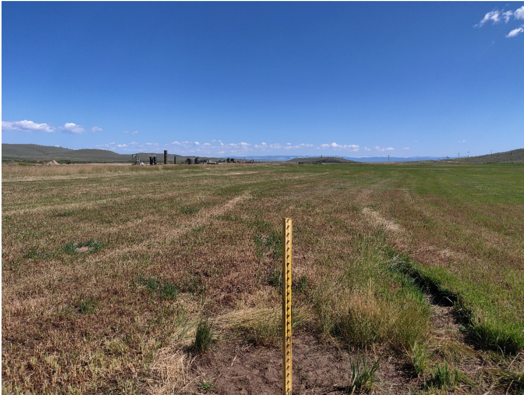
View of the site from the southeast corner of the mine site looking northwest