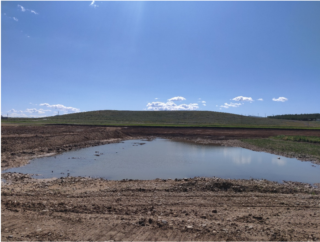
View of the recently mined area in the north section of the site