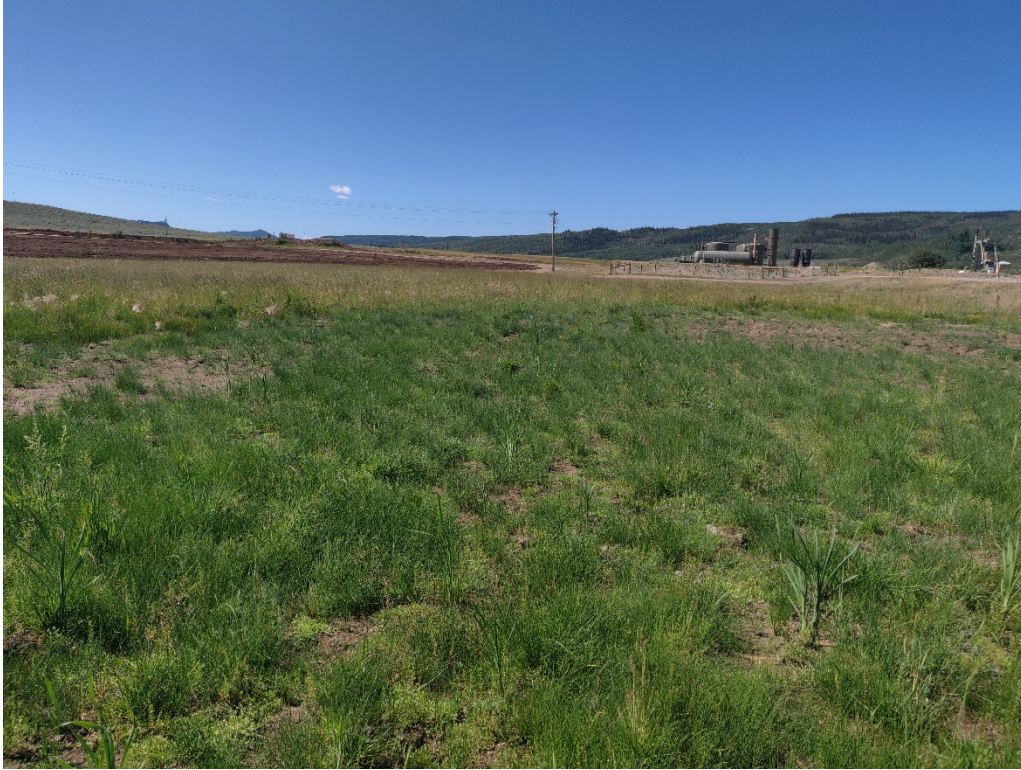
View of reclamation from last year in the south portion of the north mining area