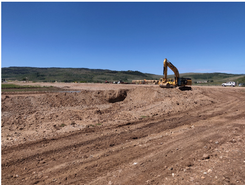
View of active mining operation in the north section of the site