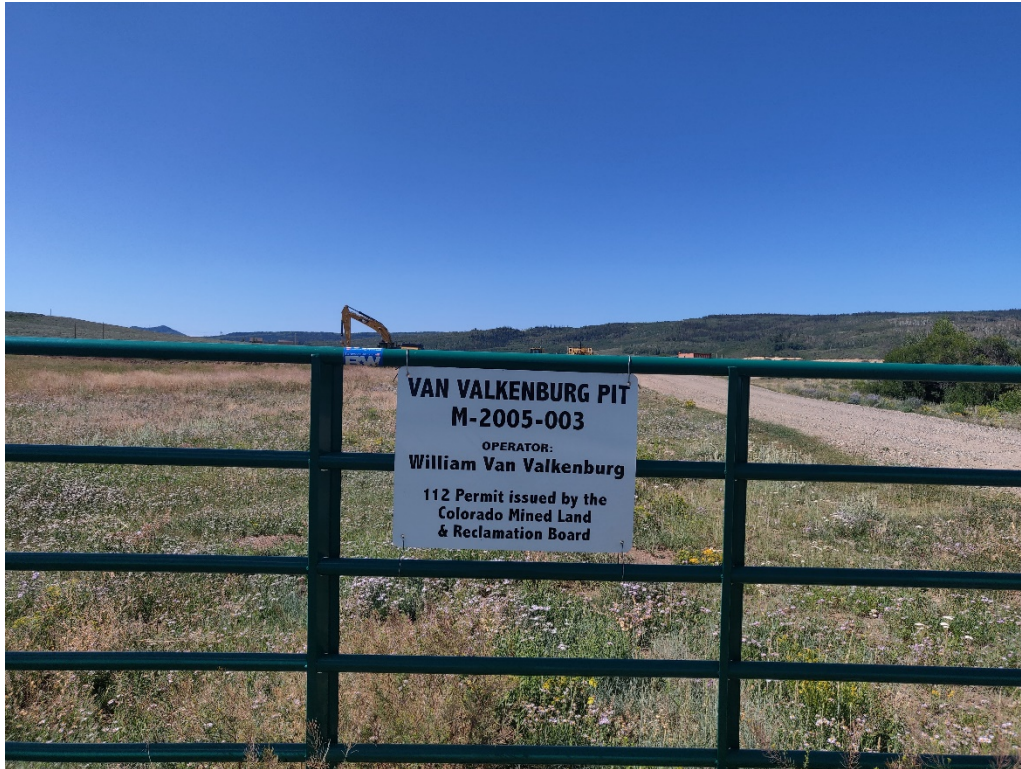
Van Valkenburg Pit mine sign