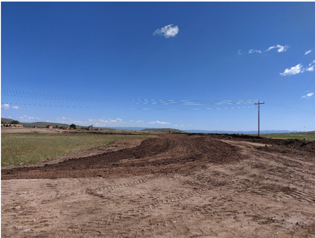
View of the north mining area from the southeast corner of the area looking northwest