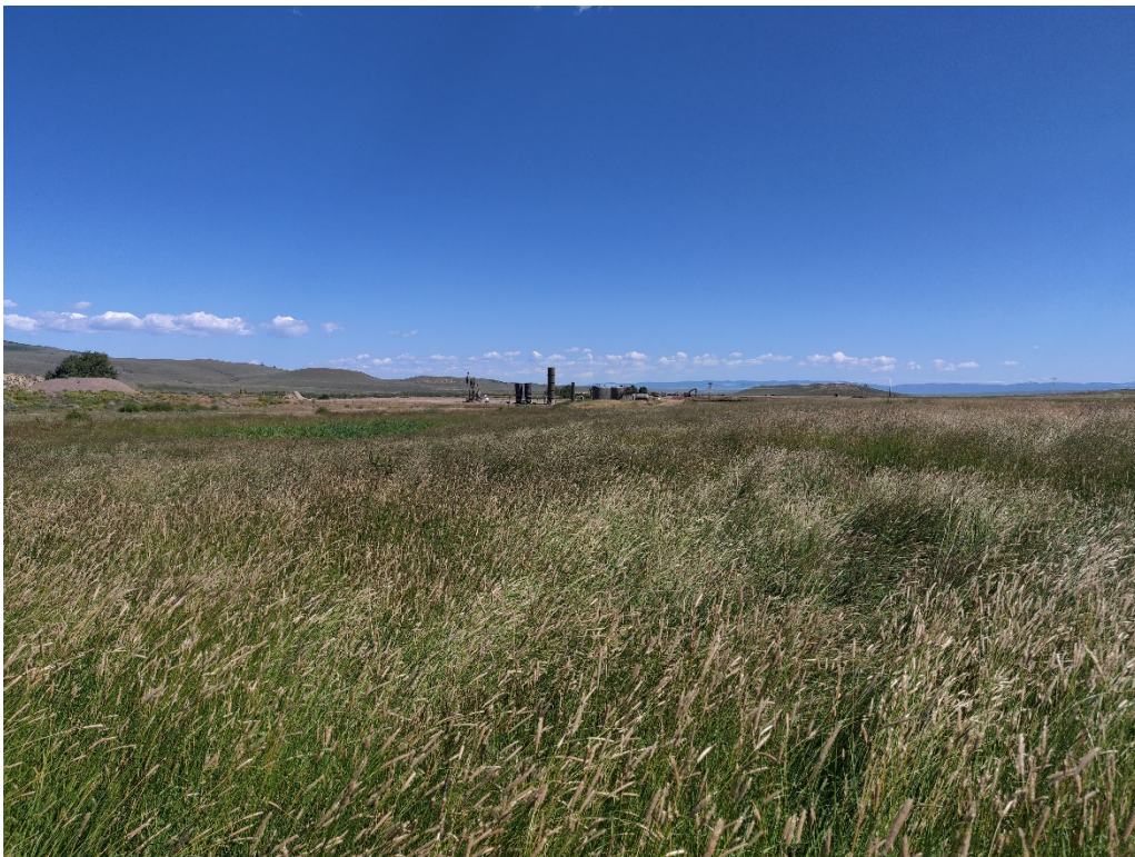
View of the vegetation in the south portion of the site