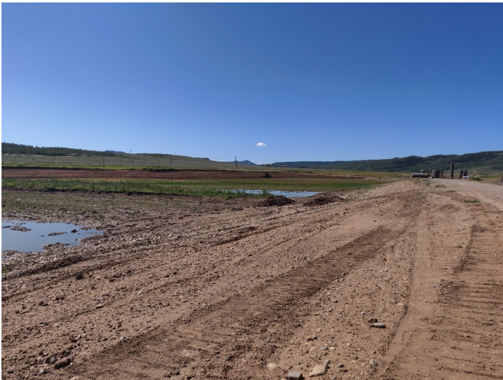
View of the previous year's mining area and reclamation