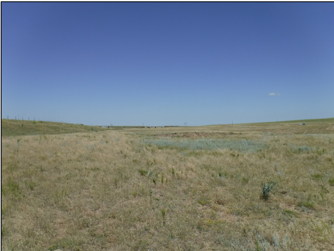
Photo 6: Looking north across westernmost disturbed area, note state of revegetation