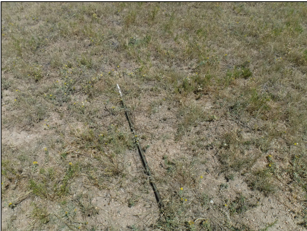
Photo 4: Boundary marker that was probably knocked down by cattle grazing