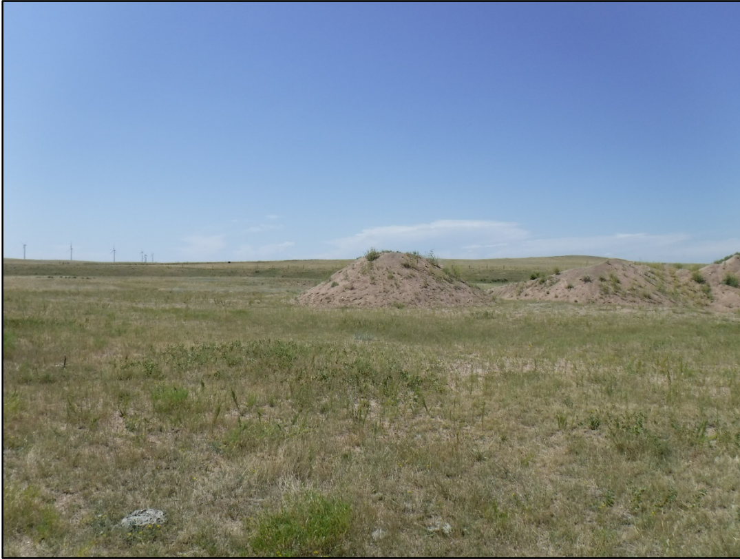
Photo 3: Stockpiles remaining at the site from CDOT operation to the north of permit area