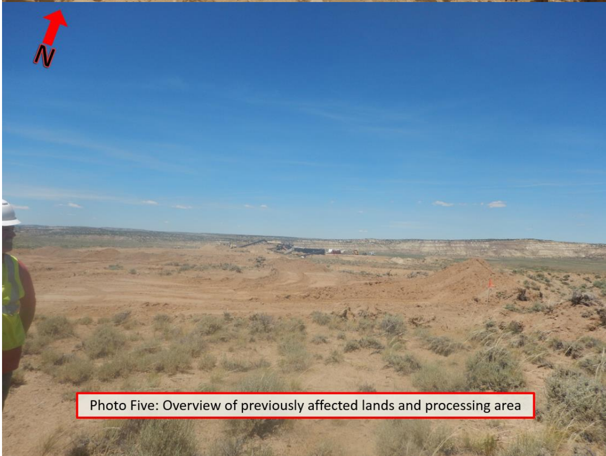
Photo Five: Overview of previously affected lands and processing area