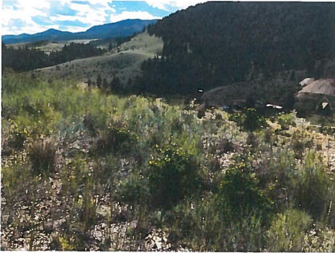
Drill Pad #2