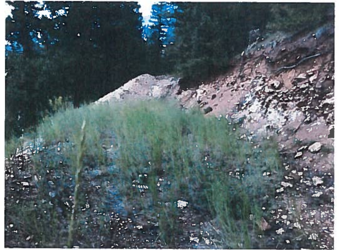
Drill Pad #3