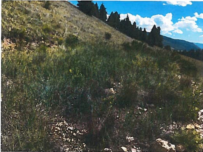
Drill Pad #2