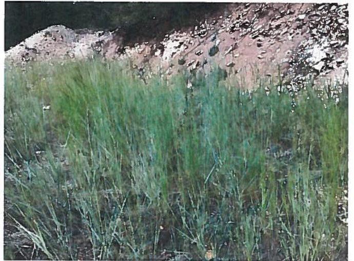
Drill Pad #3