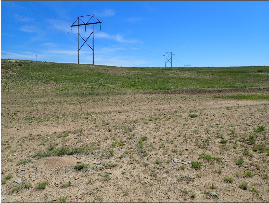
Pit floor and eastern slope; looking northeast.