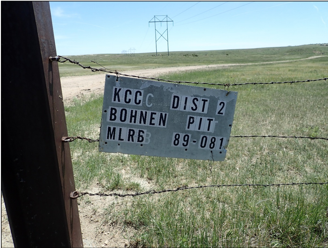
Mine identification sign posted at the entrance to the site; looking east.