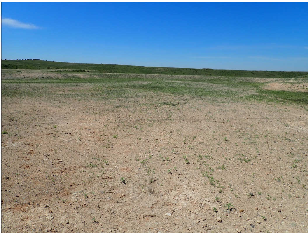
Pit floor; looking southwest.