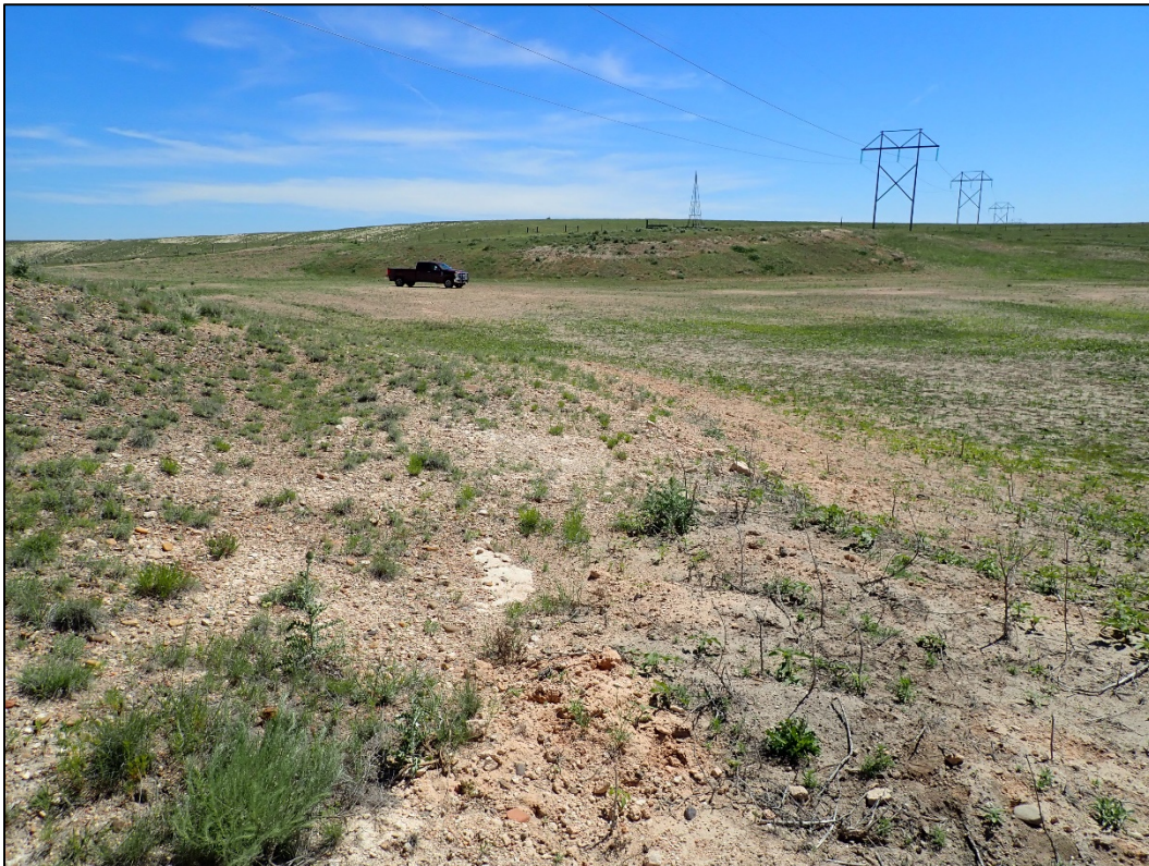
Site overview; looking northeast.