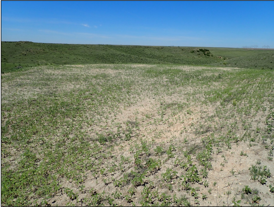
Annual weeds germinating on southeast portion of the site; looking southeast.

Dave Hornung Kit Carson County P.O. Box 249 Burlington, CO 80807