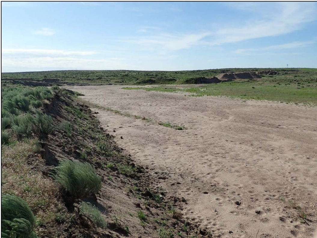
Photo 4. Bonny Creek within the permit boundary; looking southeast and downstream.