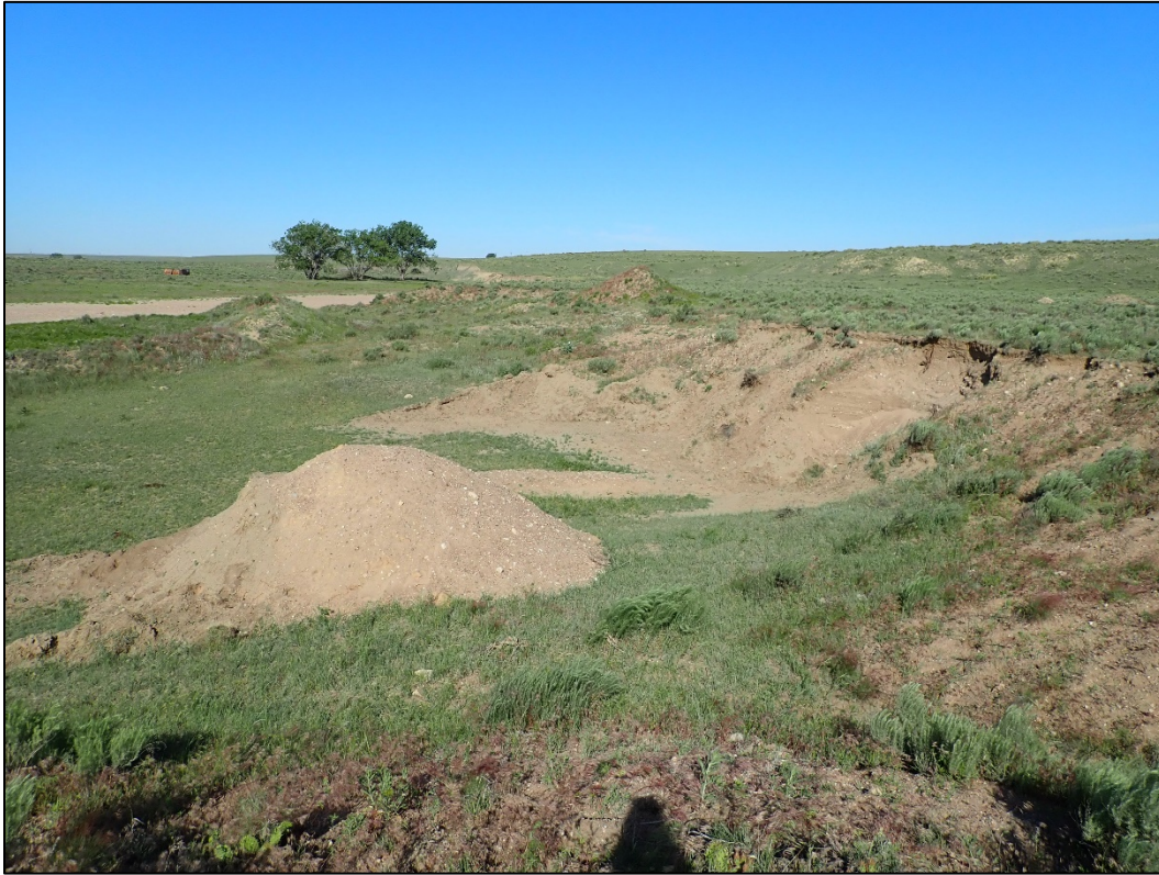
Photo 5. Excavated area on the north of the creek channel; looking west.

Dave Hornung Kit Carson County P.O. Box 160 Burlington, CO 80807