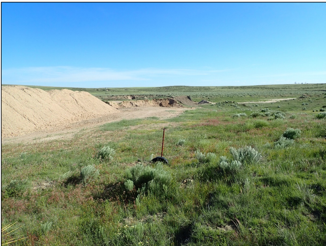
Photo 2. Southeast boundary marker and product stockpile; looking north.