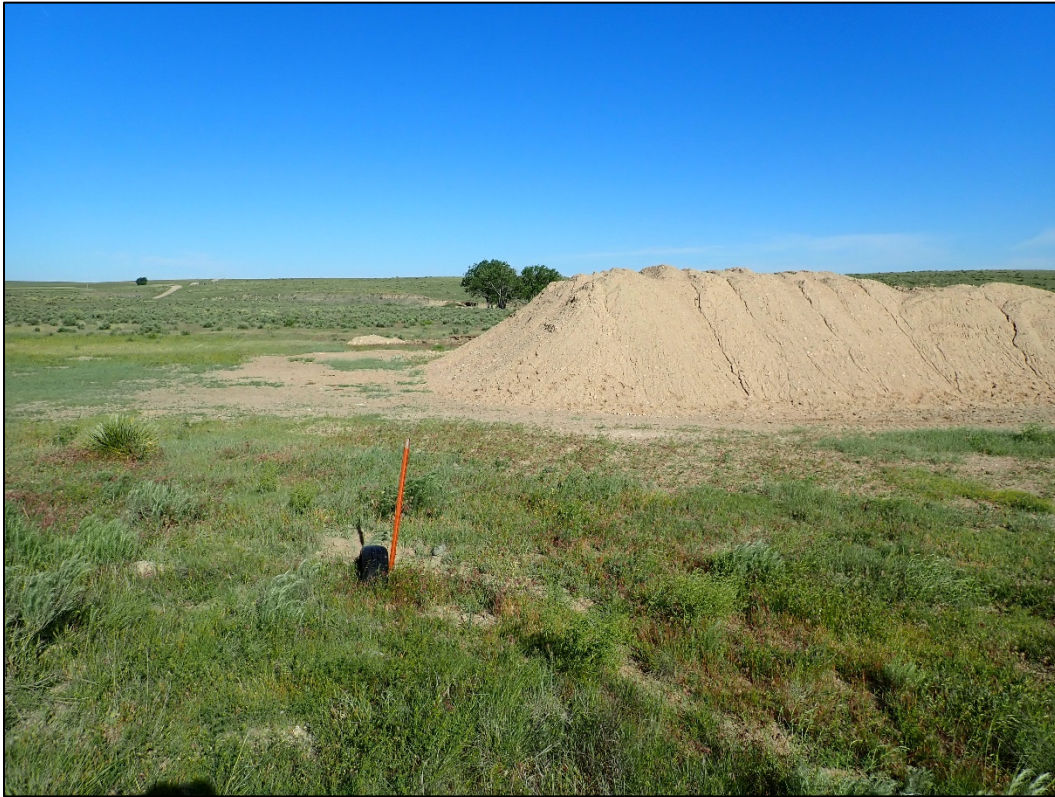
Photo 3. Southeast boundary marker and product stockpile; looking west.