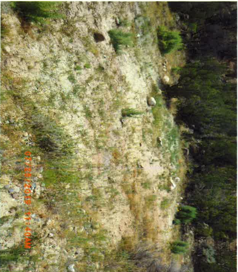
Drill pad from county road.