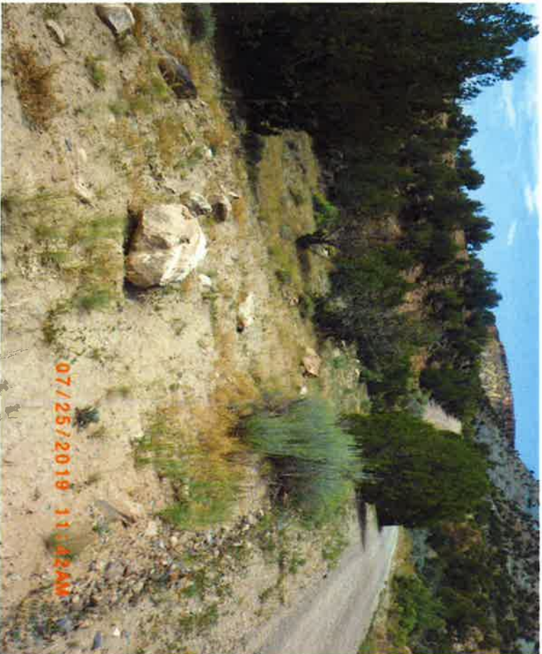
Access from county road. Looking at pad from county road.