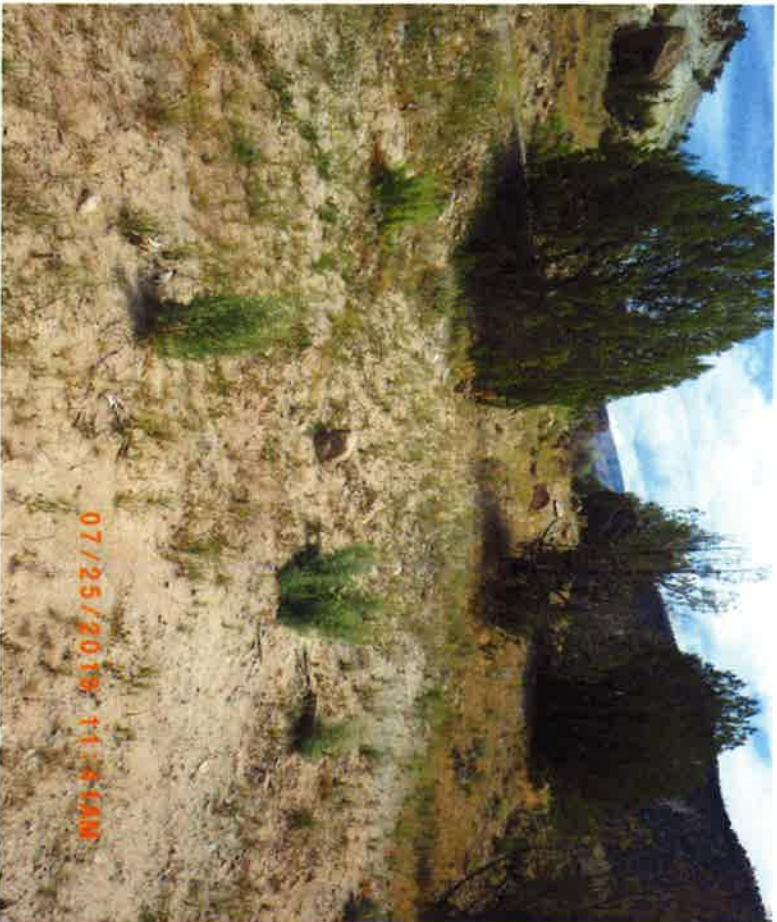
Drill pad looking at access from county road.