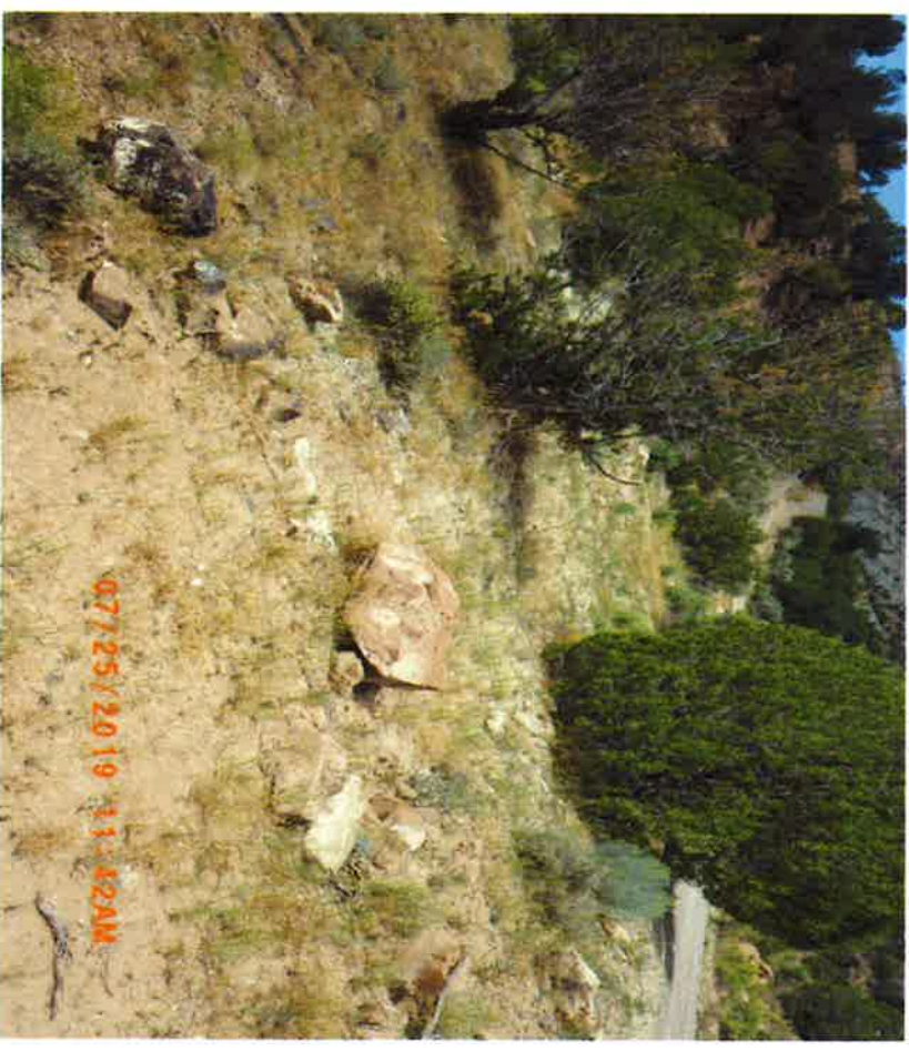
Access from county road. Taken from county road.