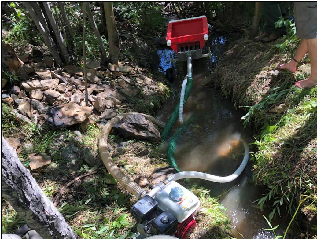
Photo 6. View looking downstream in Beaver Creek, showing equipment utilized for suction dredging during inspection. Green hose = dredge hose; white hose = dredge pressure hose; larger yellow/off-white hose = water intake.