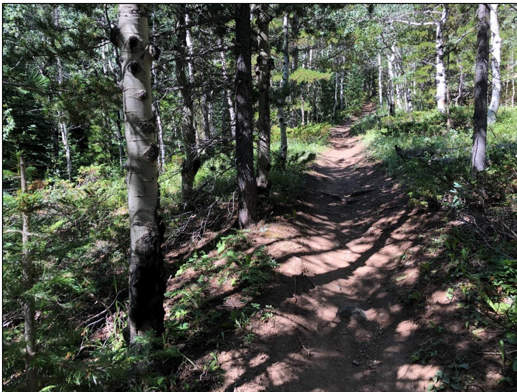
Photo 2. View looking west along School Bus trail (929.1) used to access the site. Beaver Creek is located south of this trail (at left in photo).