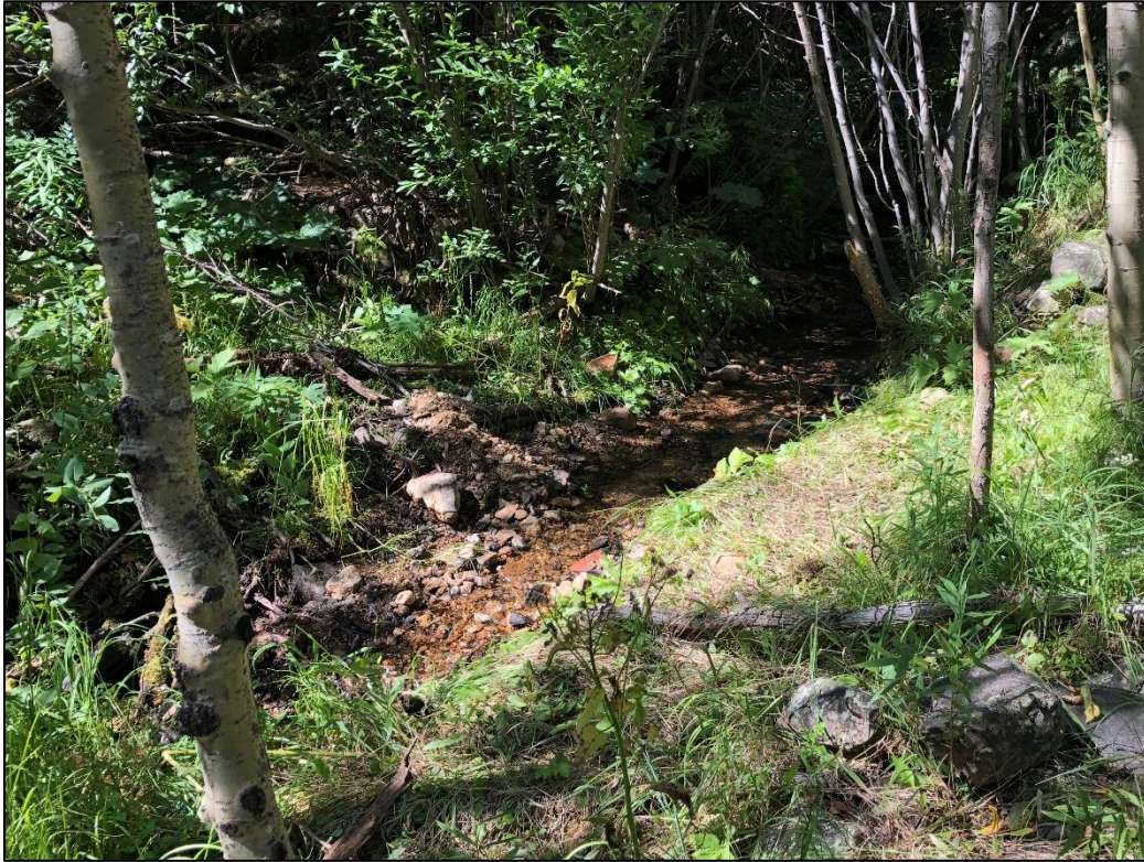
Photo 7. View looking upstream in Beaver Creek immediately above where suction dredging was taking place during inspection.