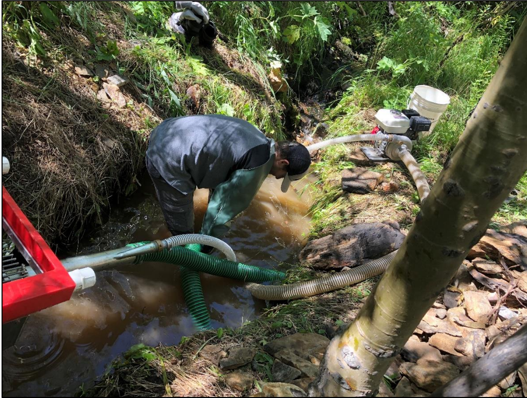
Photo 3. View looking upstream in Beaver Creek, showing suction dredge in operation during inspection.