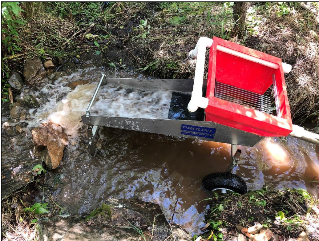
Photo 4. View of Proline 3" dredge/highbanker combo unit utilized for suction dredging during inspection.