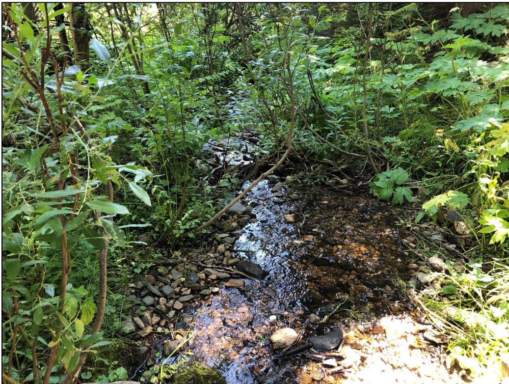
Photo 8. View looking upstream in Beaver Creek near eastern/downstream edge of Fool's Errand placer claim. Creek was running clear during inspection with no visual evidence of impairment.