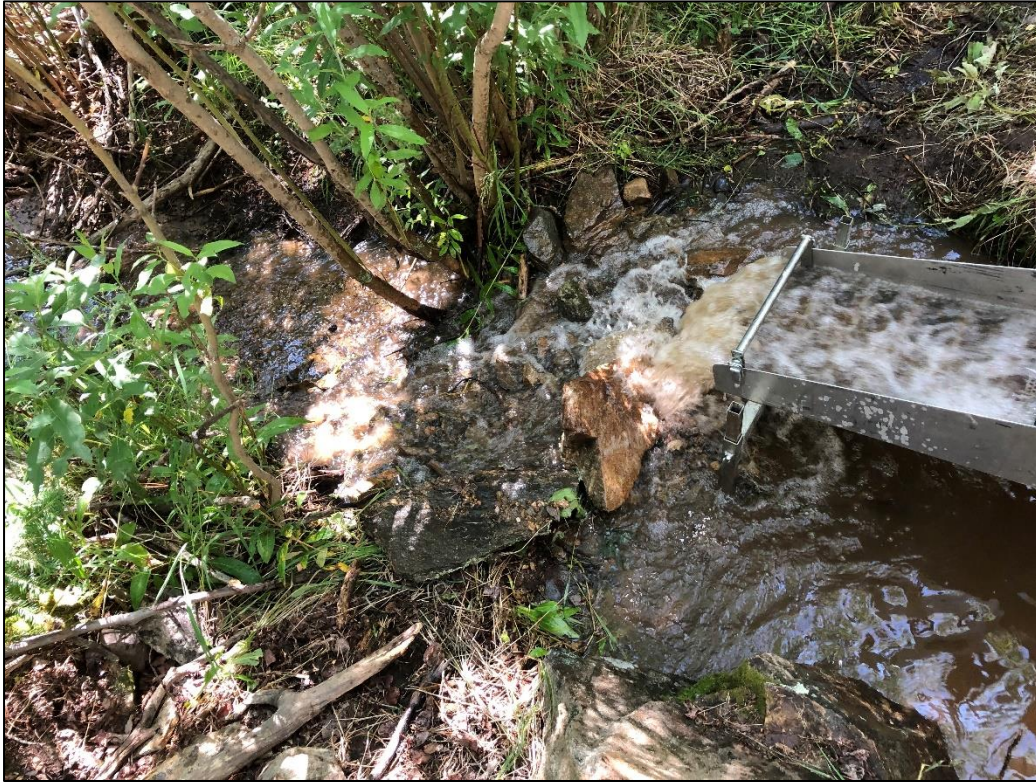
Photo 5. View looking downstream in Beaver Creek, showing outflow to creek from suction dredge operation.