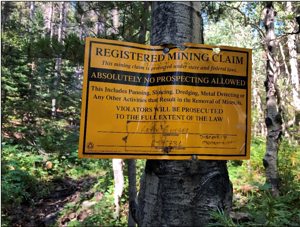
Photo 1. View of mining claim sign (for FMC# 289736) posted on tree adjacent to Beaver Creek, near eastern edge of Fool's Errand placer claim.