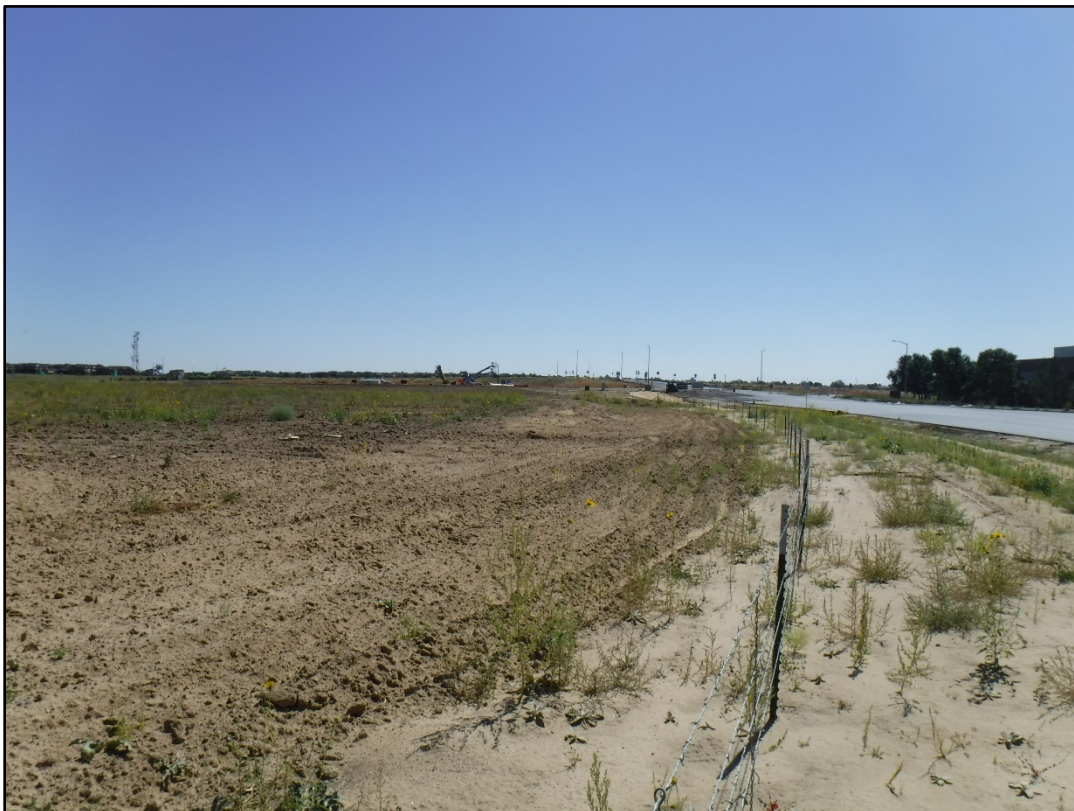
Photo 2: Looking east from the former pit entrance along the southern pit boundary