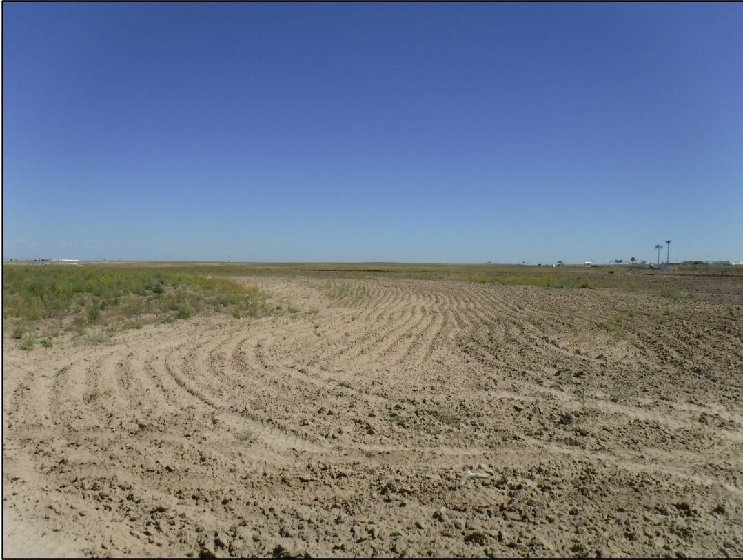
Photo 5: Looking north from the southeastern corner of permit boundary