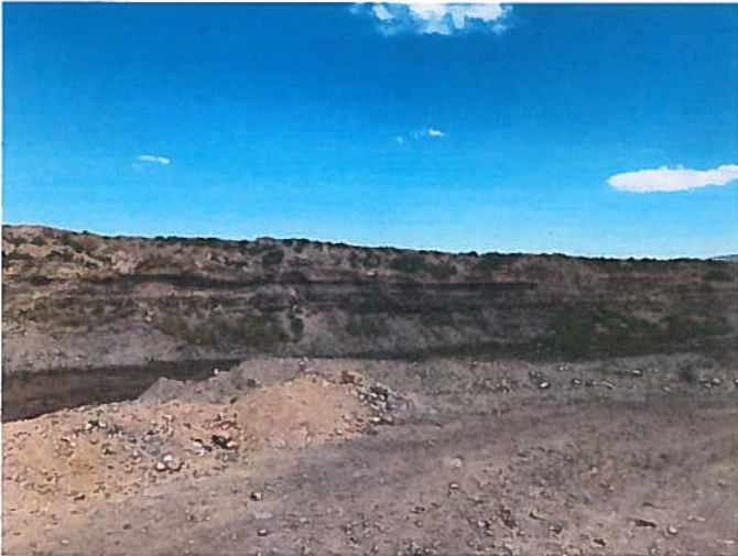
Active Highwall- does not require fencing