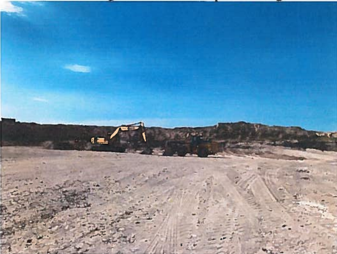
Loader and Excavator on site