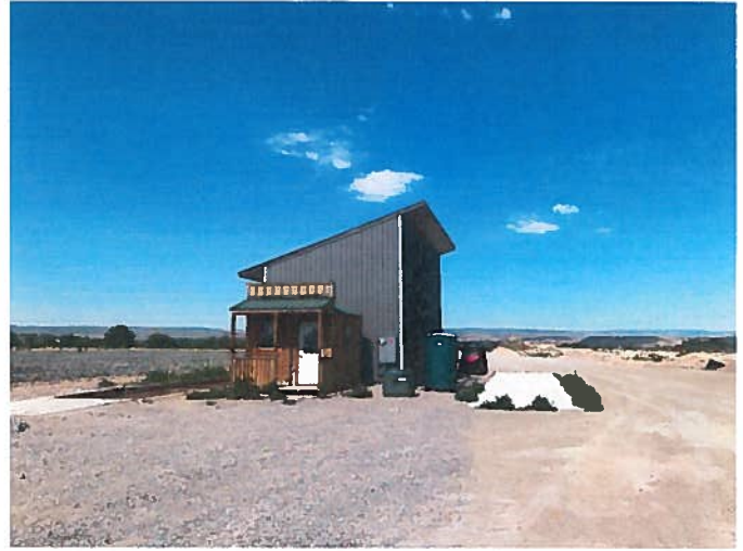
Scale House and Storage facility- water