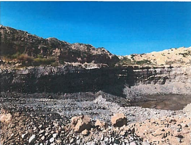
Irrigation tails impounded