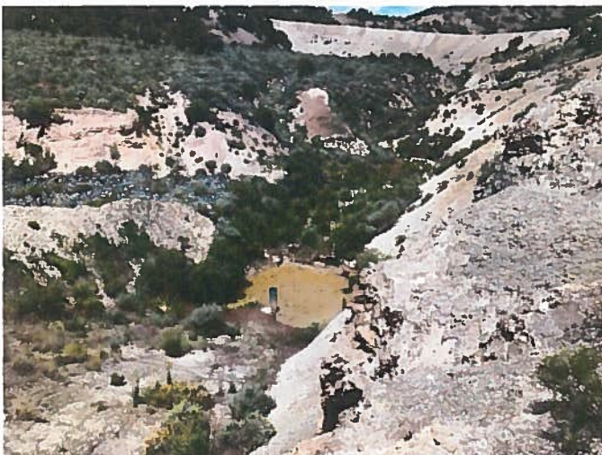
Stormwater Structure 2