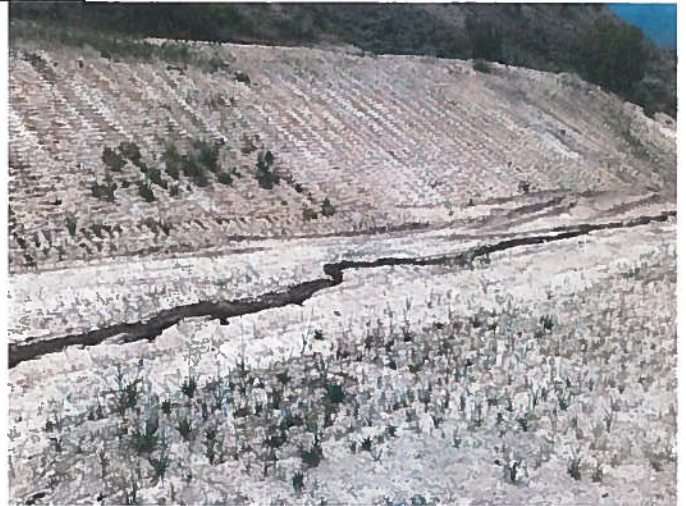
Gully – needs rip rap