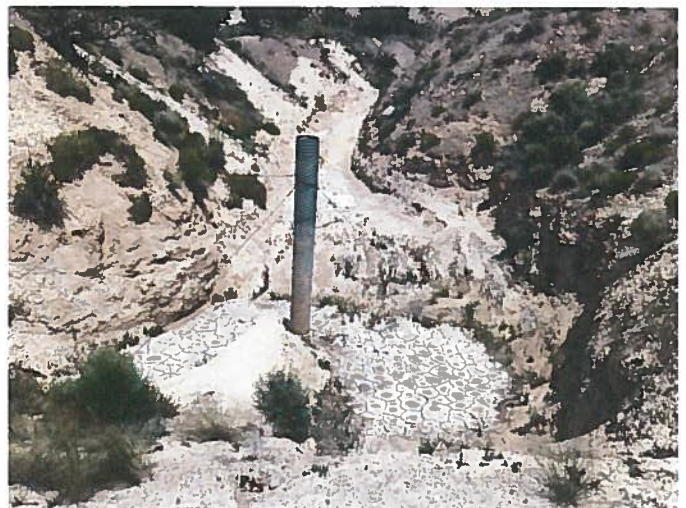
Stormwater Structure 5