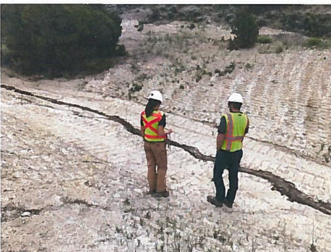
Gully by Pond 1b