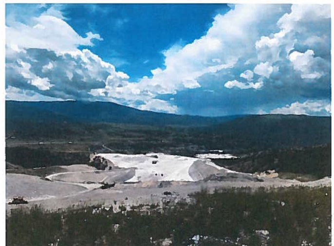
Overall Site- Upper pit