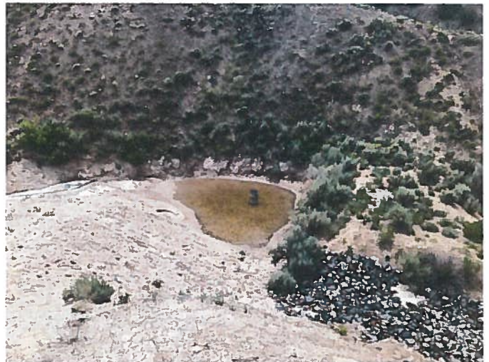
Stormwater Structure 6