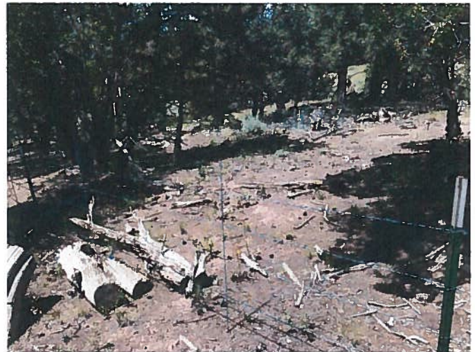
Fence above highwall