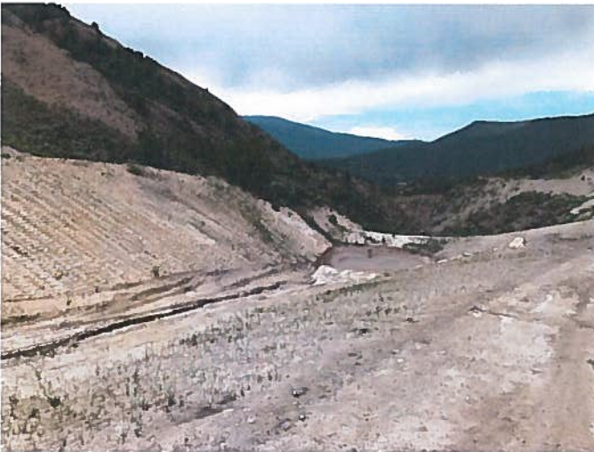
Pond 1 b