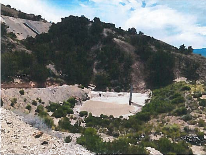
Stormwater Structure 4