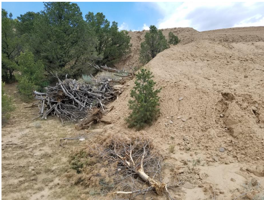
Figure 4. From the southwest end of the former overburden storage area looking north. Steep slope area that will need to be graded.