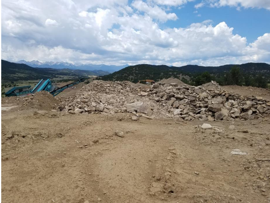
Figure 7. Top area of Area 2.