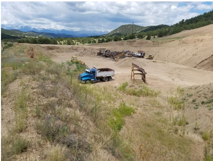
Figure 2. From the south western end of the south boundary looking west by northwest into Area 1 pit.