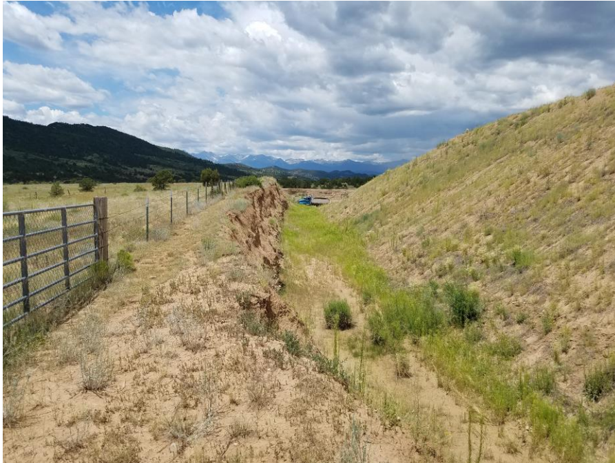
Figure 1. From the south central portion of the permit boundary looking west.