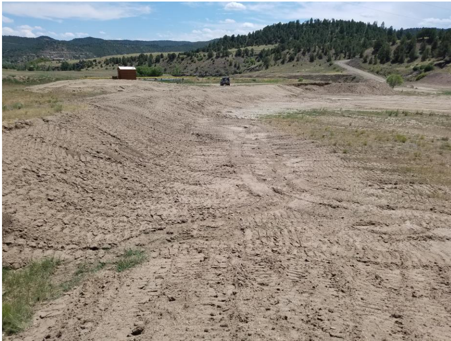
Figure 8. Reclamation Area Only parcel. North of the access road looking south from the east end.