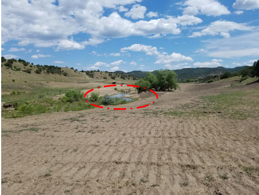
Figure 9. From the north end of the Reclamation Area Only parcel looking south. Northern water basin highlighted in red.