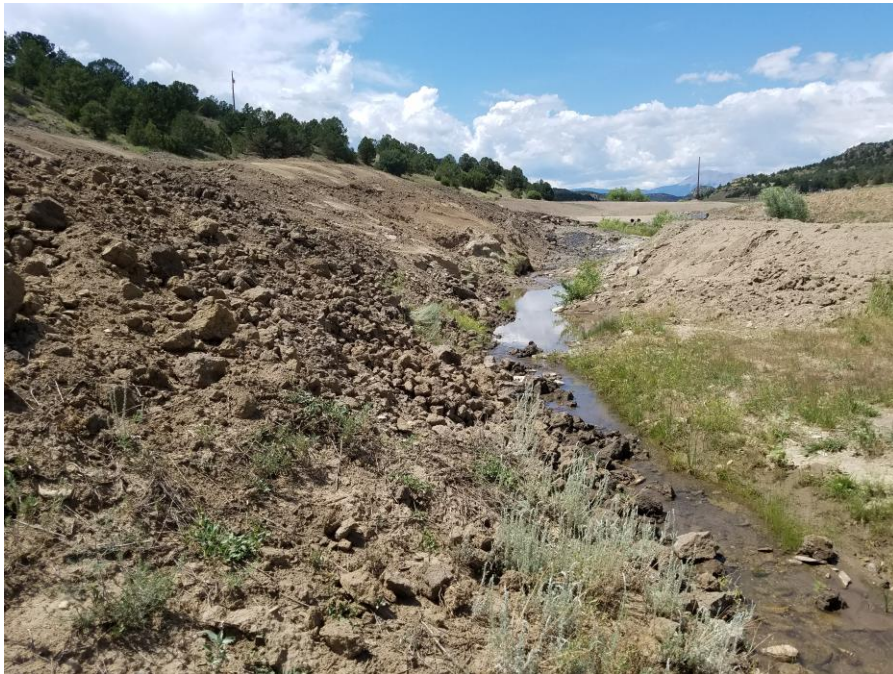
Figure 10. Re-established stream channel on the south side of the Reclamation Area only parcel looking north.