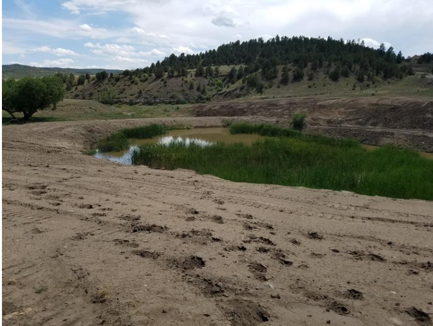
Figure 11. Pit basin on the south side of the access road from the east side looking west.