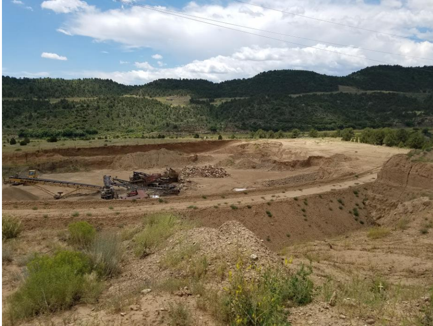
Figure 5. From the north side of the southwest portion of Area 1 looking south.