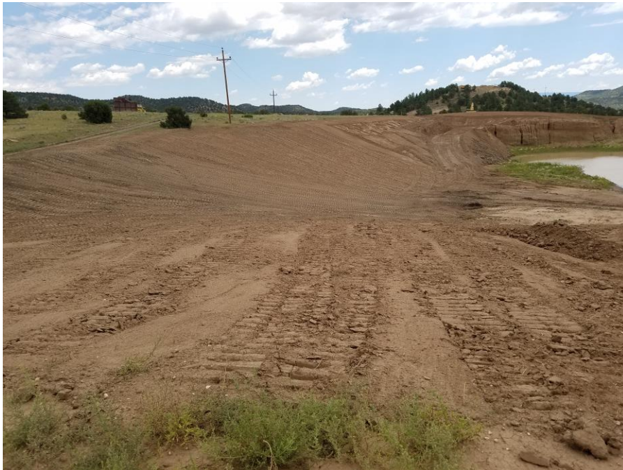
Figure 6. From the north central portion of Area 1 looking southeast at the graded portion of Area 1.