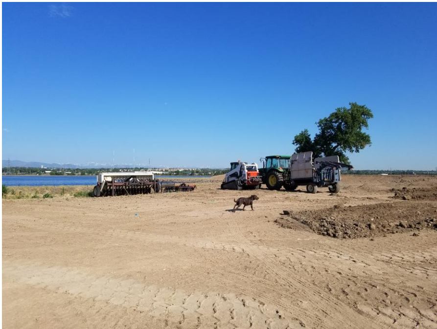
Figure 2. Reclamation equipment staged at the site.