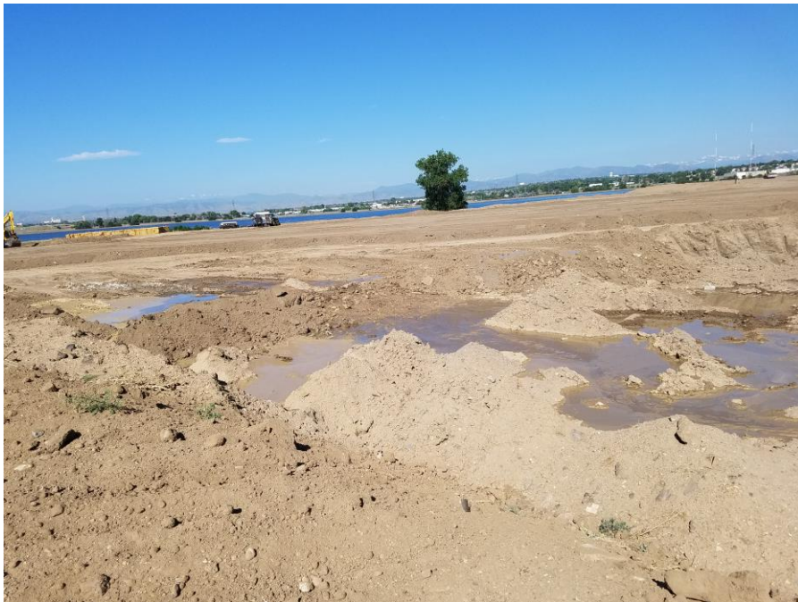
Figure 8. Landowner's fill within northeast basin.