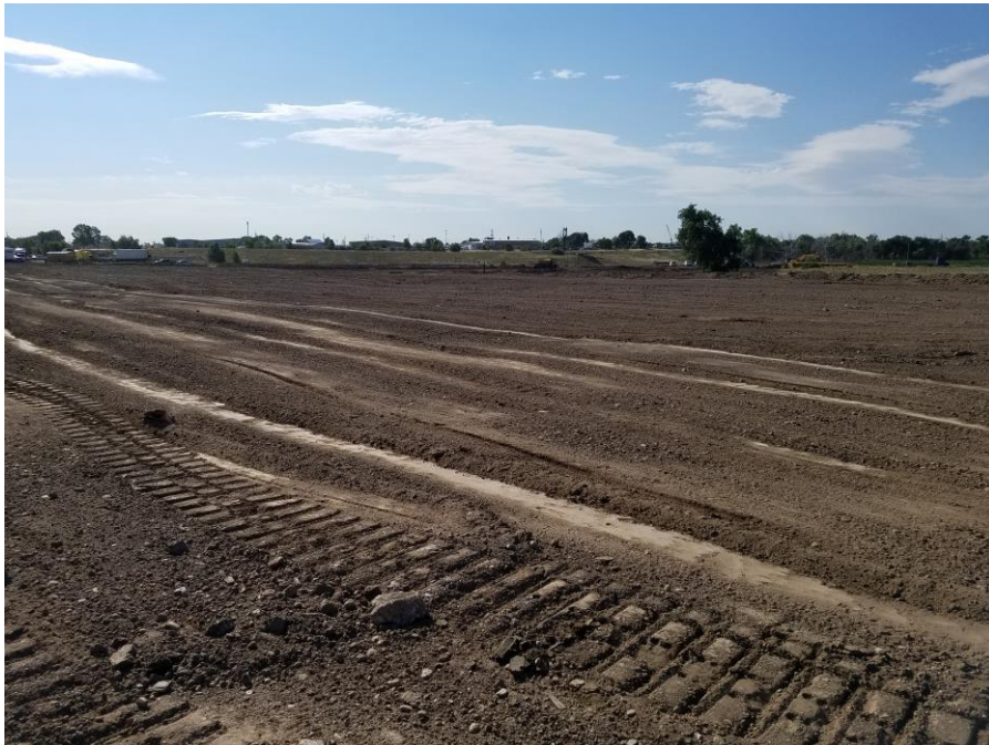
Figure 6. From the northern end of the site looking south.