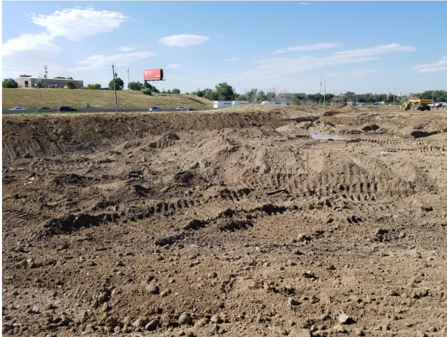
Figure 7. Pit basin located in north east portion of the site in the Industrial zoned area.