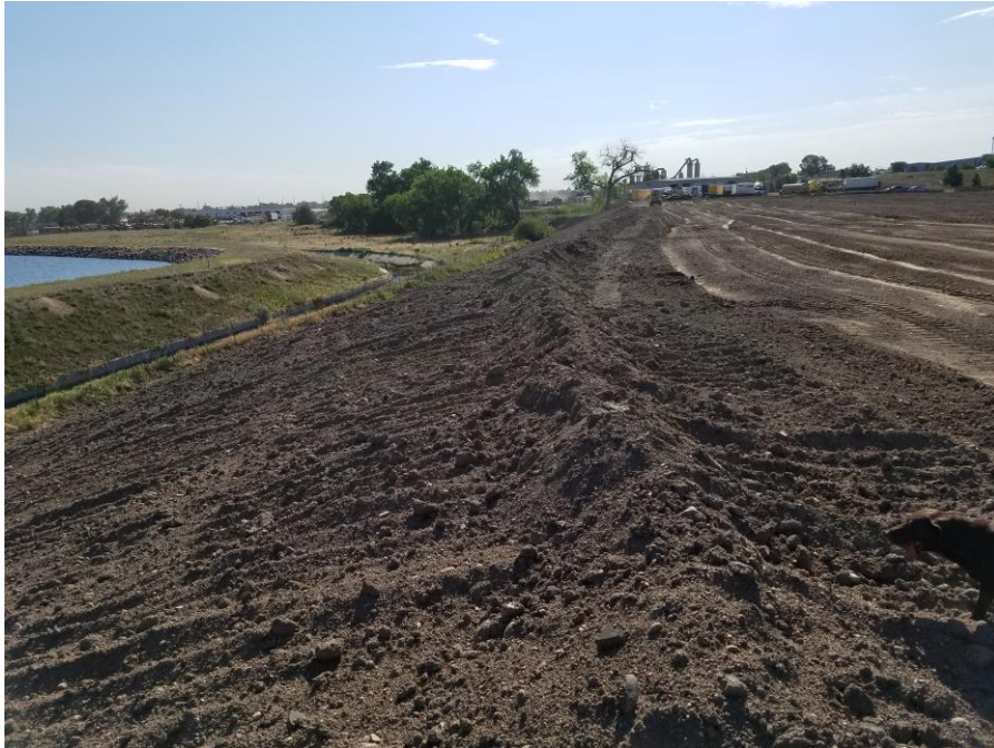
Figure 5. Regraded northern pit slopes.