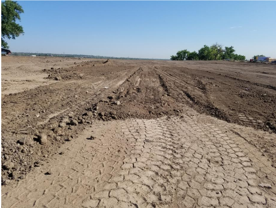
Figure 3. From the south end of the site looking north.