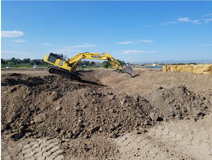
Figure 1. Storm water basin construction, near south corner of the site.