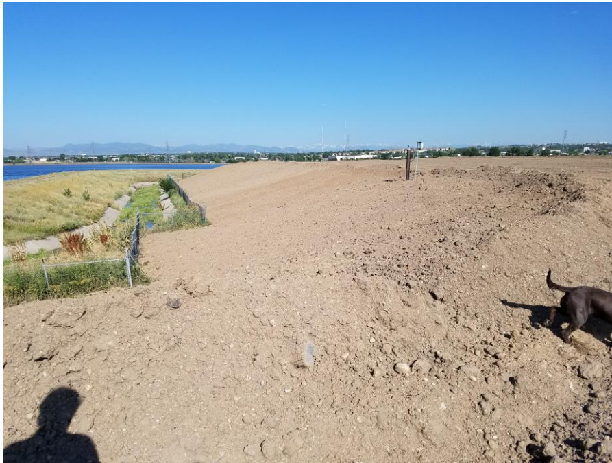
Figure 4. Reggraded southern fill slopes.