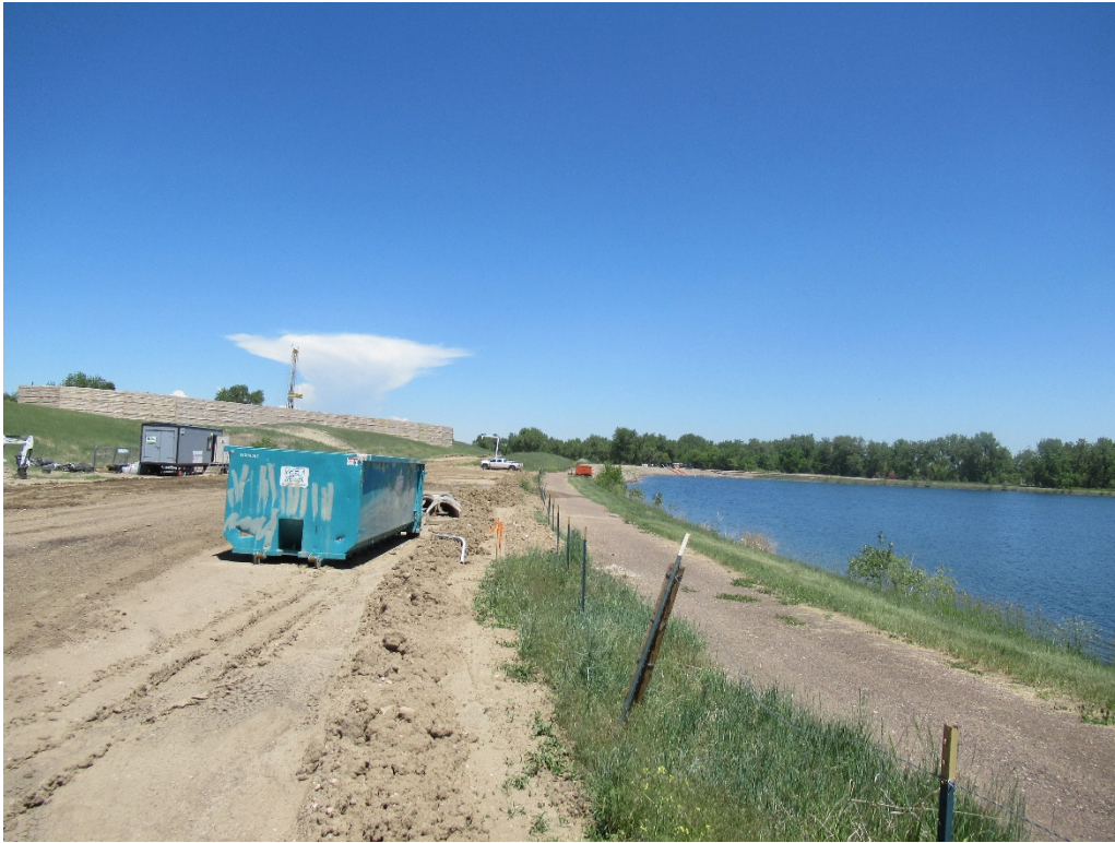
View of the temporary trail and oil and gas facilities from the southwest corner of the reservoir looking north