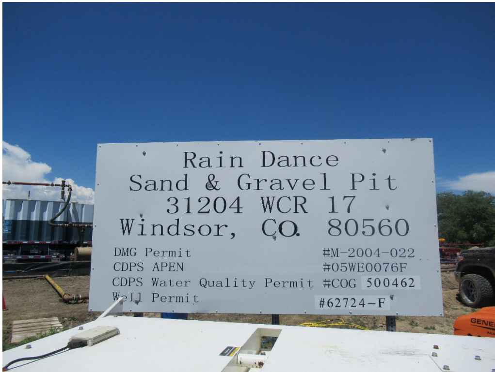
Raindance Mine sign