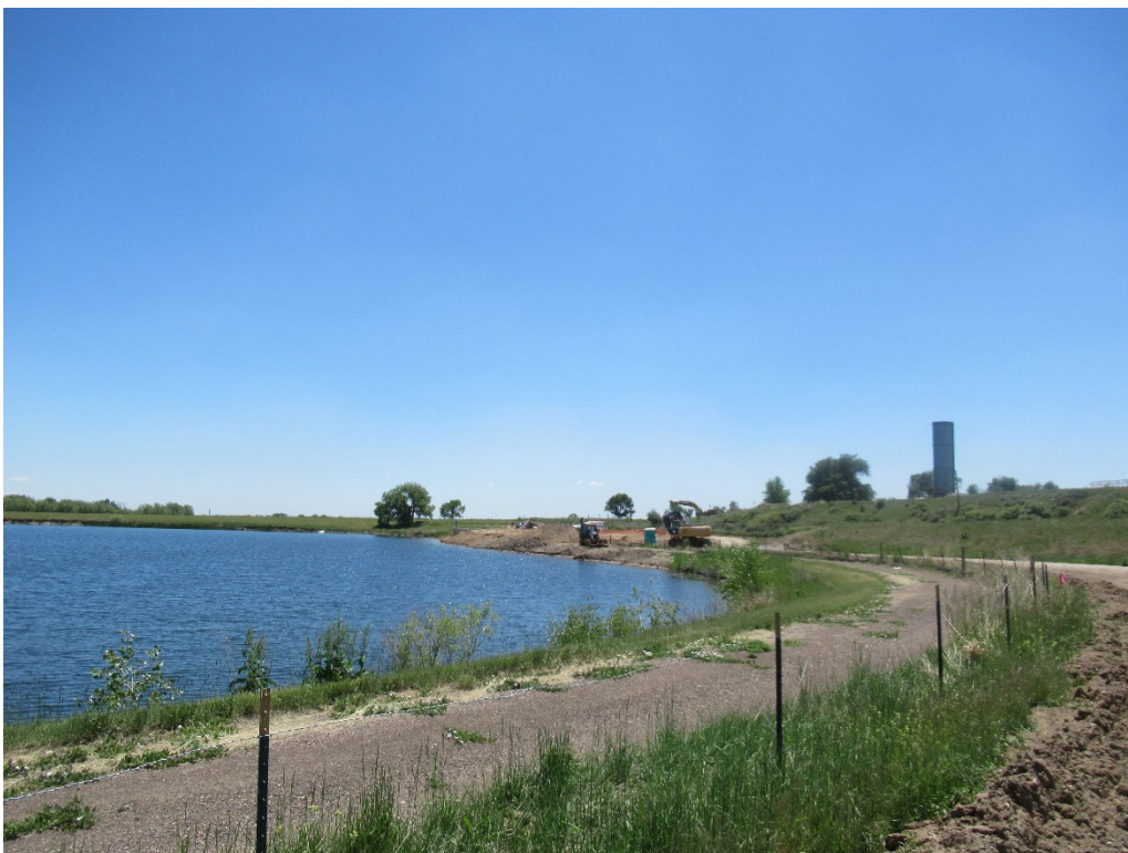
View of the temporary trail and pump station construction from the southwest corner of the reservoir looking east