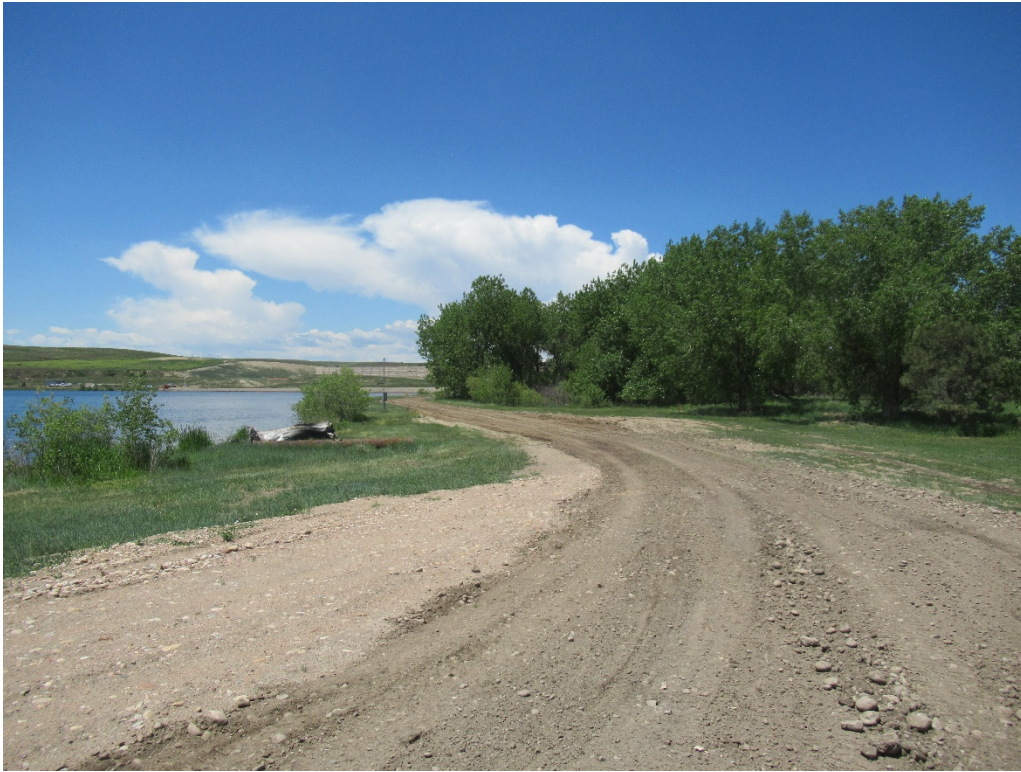
View of the temporary road in the northern portion of the site

Cody Wooldridge Raindance Aquatic Investments, LLC 1625 Pelican Lakes Point, Ste. 201 Windsor, CO 80550