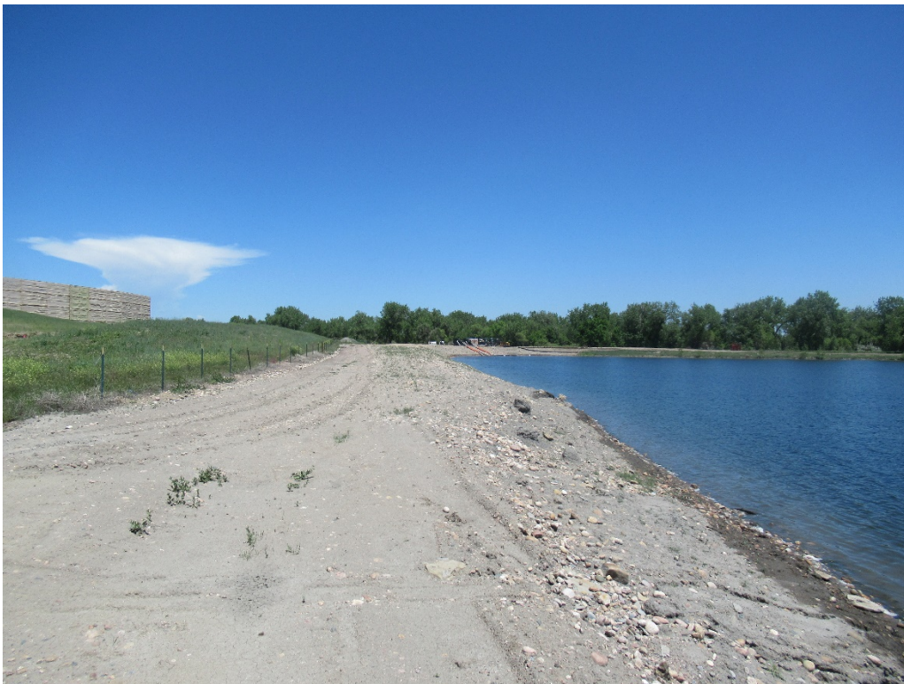
Backfill area located in the northwest corner of the reservoir