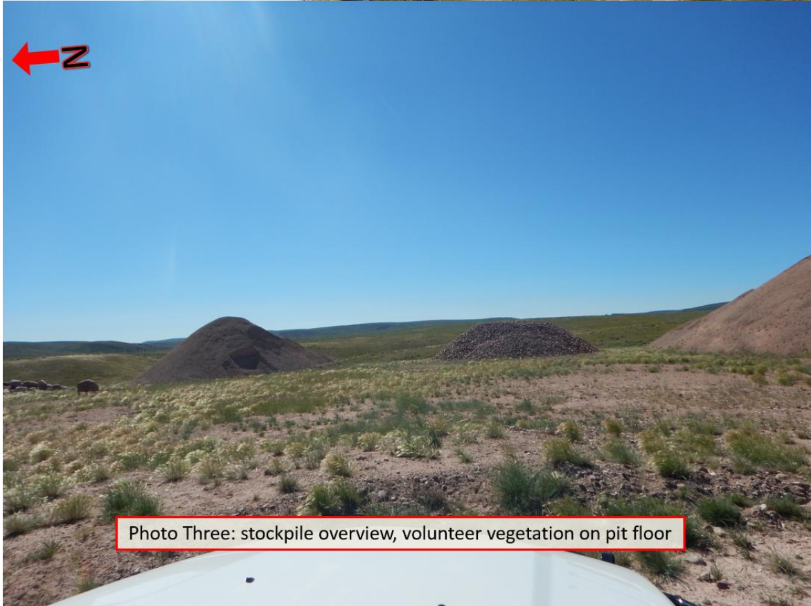
Photo Three: stockpile overview, volunteer vegetation on pit floor