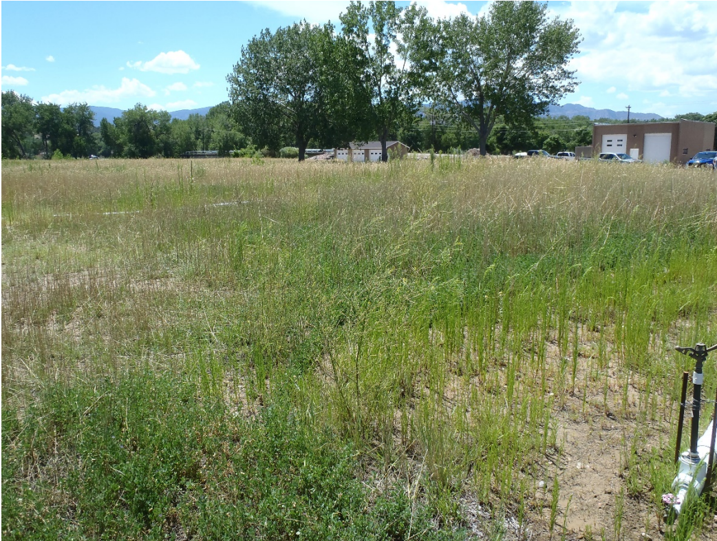
Photo 4. Diverse established grasses (looking SW from near east pond, note refurbished buildings).