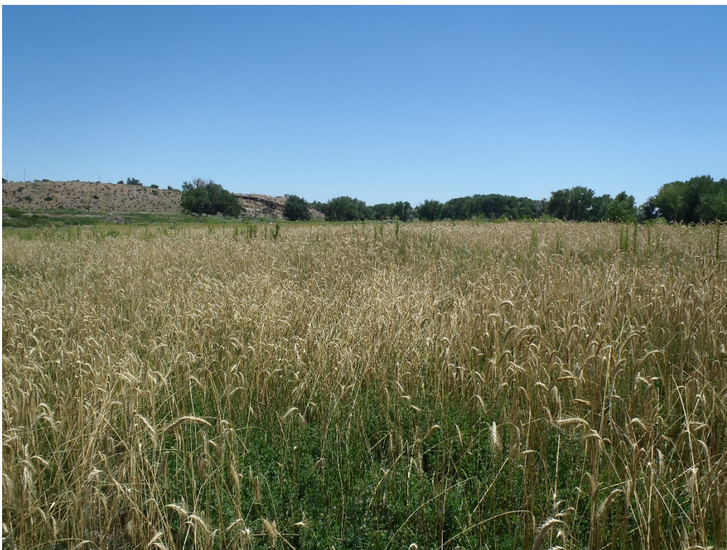
Photo 3. Established grasses and alfalfa (looking SE from near east pond).