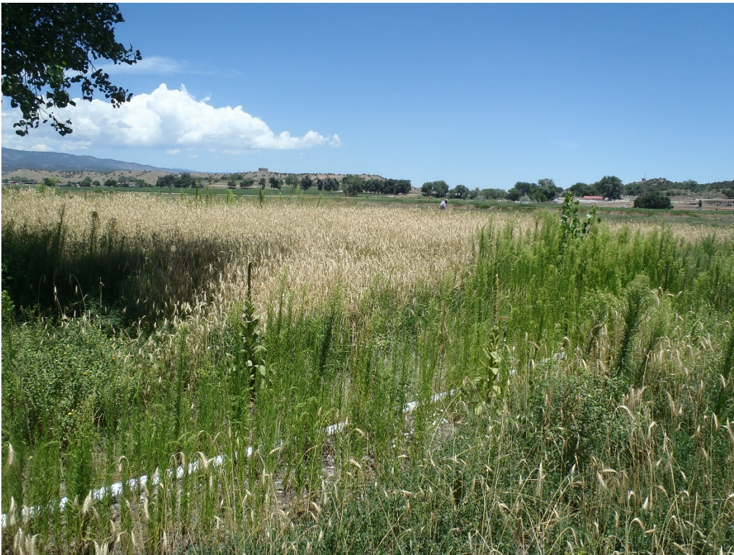
Photo 1. Established diverse grasses and forbs (looking NE from reclaimed west side of east pit).