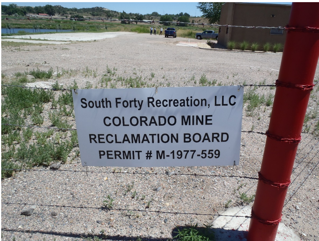
Photo 5. Permit sign at entrance.