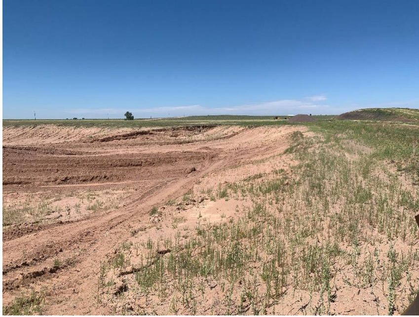
Pit area looking west.