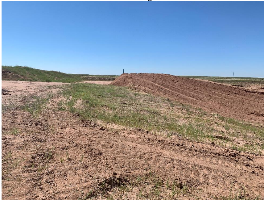
Gravel stockpile looking south.

Steve Williams PO box 32 11920 Co. Rd CC Anton, CO 80801