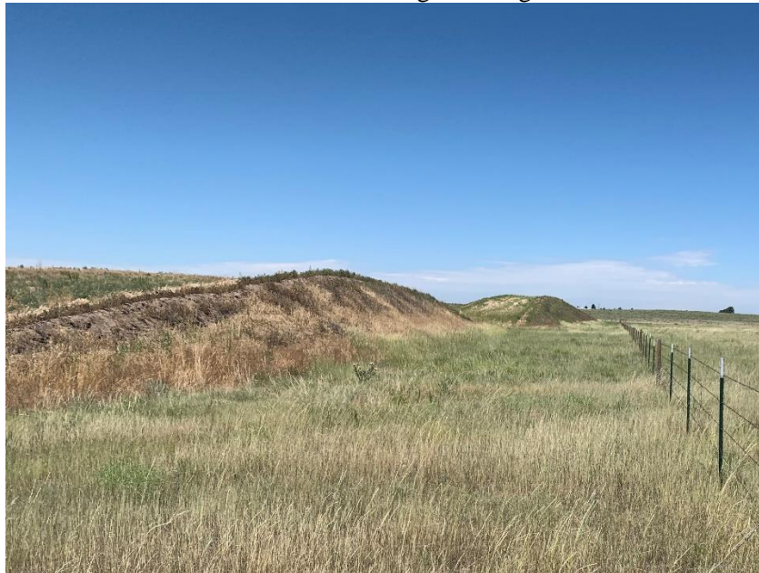
North permit boundary fence, looking west. Topsoil stockpile on left, overburden on right.