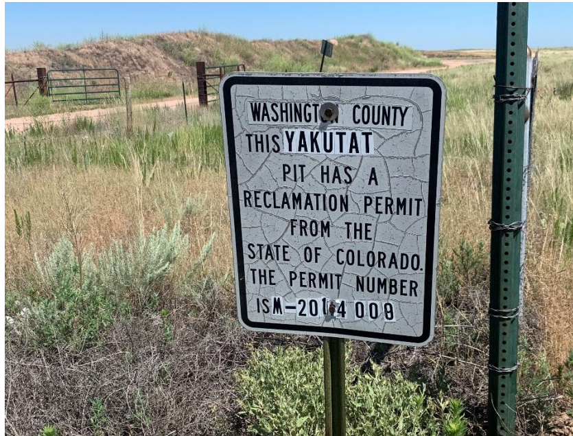
Permit identification sign looking north.