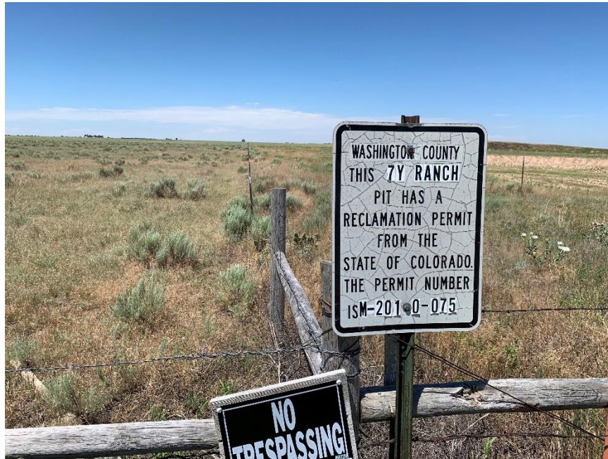
Permit identification sign; looking west.