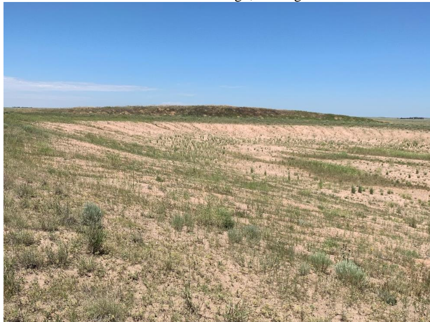
Pit area and topsoil stockpile, looking west