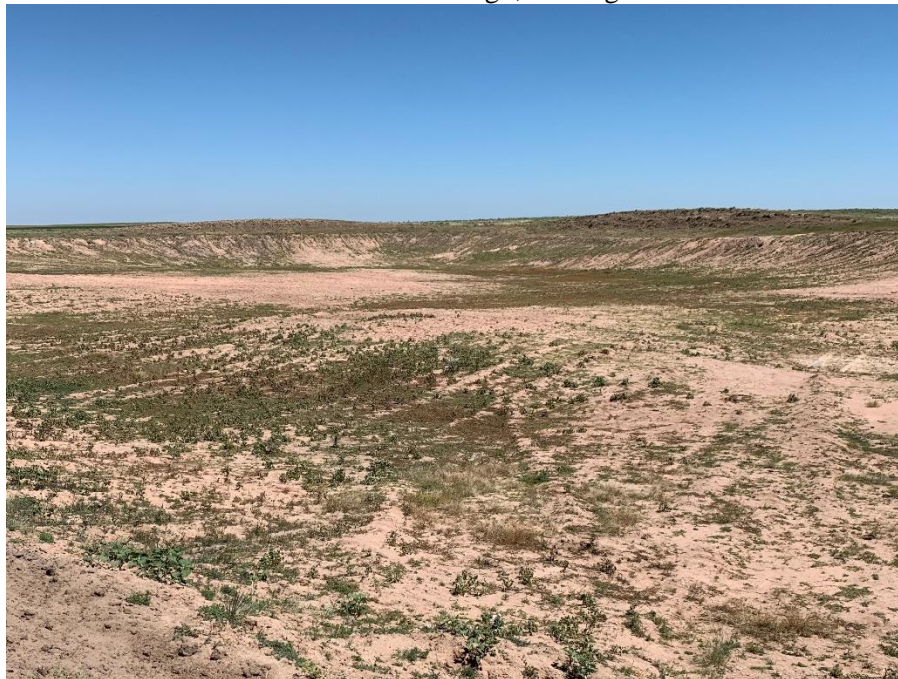
Pit area and topsoil stockpiles, looking northeast