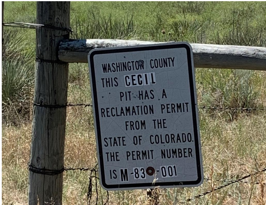
Permit identification sign; looking south.