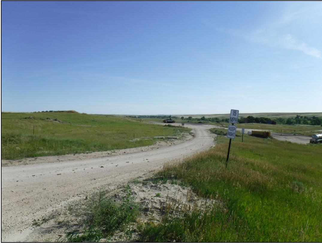
Photo 7: Elbert County Road and Bridge storage area north of haul road