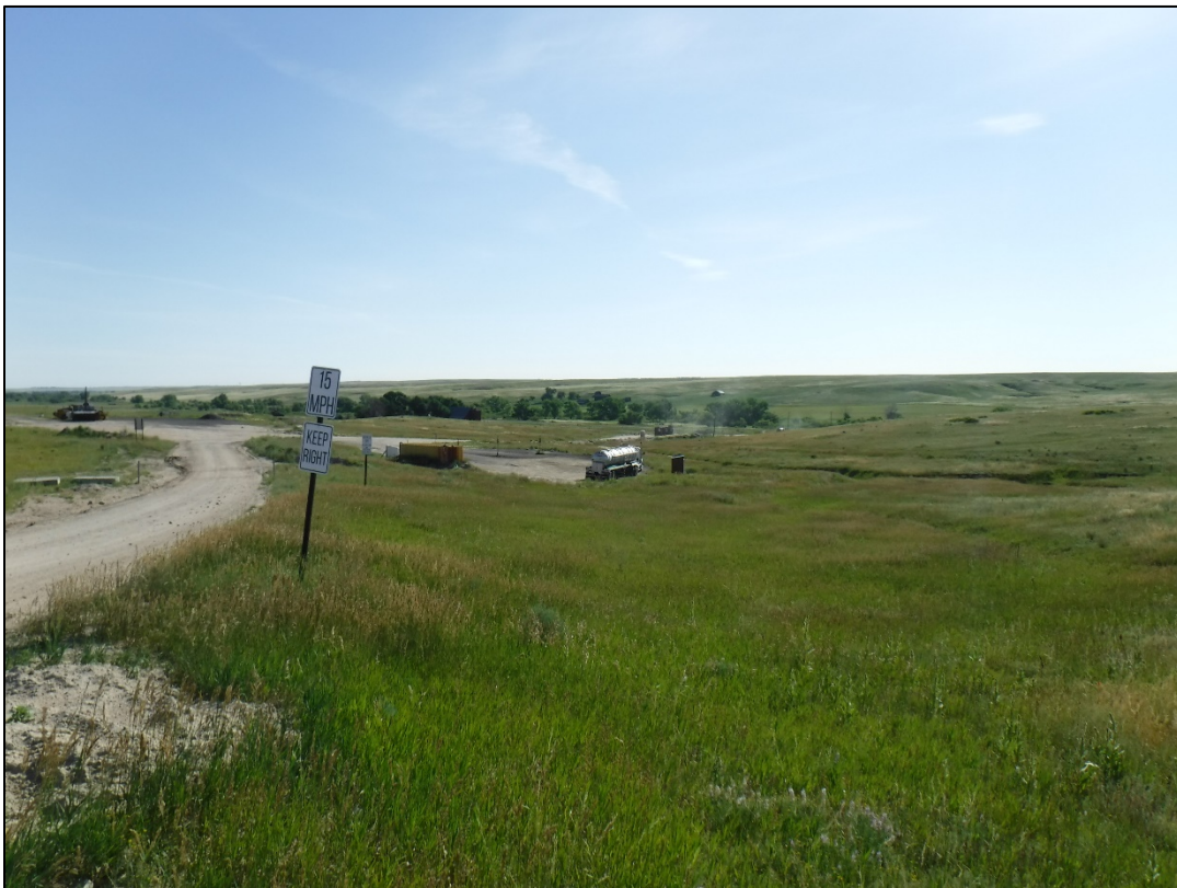
Photo 6: Waste transfer area south of the haul road to access the mine