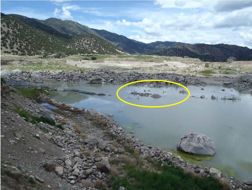
Photo 1. Exposed groundwater in main pit (looking NW, note geese, circled).