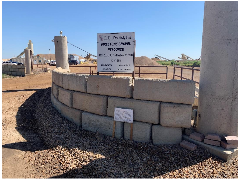
Mine Entrance Sign and Amendment Application Sign