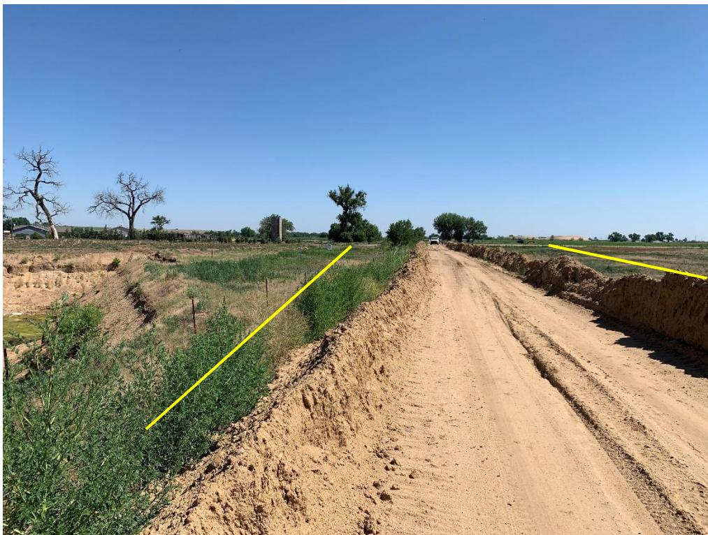
Amendment Area is Between the Yellow Lines