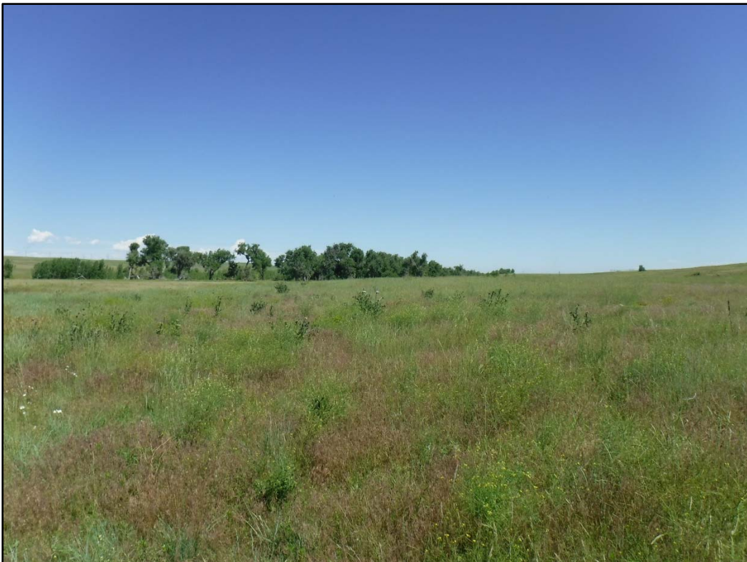
Photo 6: Looking north across the reclaimed area from near the western boundary of release area