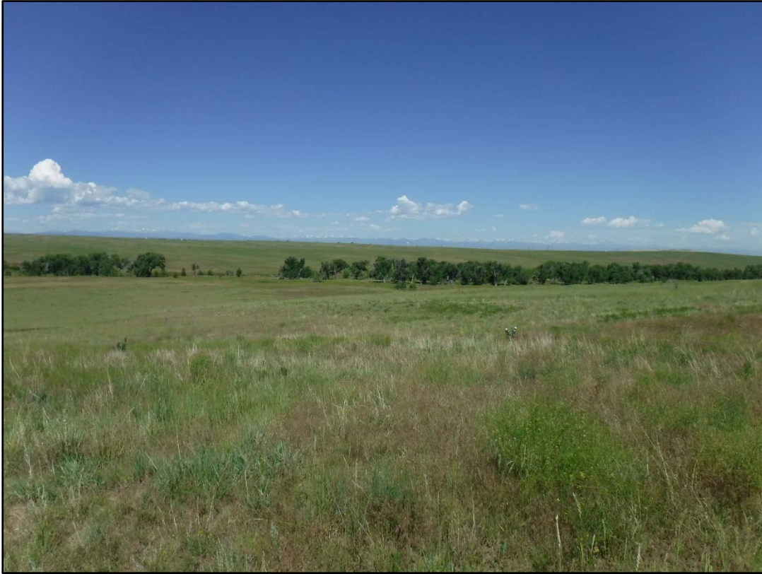
Photo 3: Looking northwest across the reclaimed area from near the access road