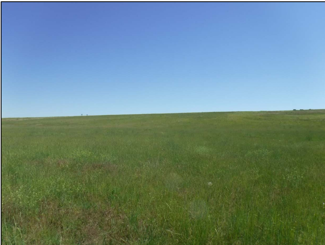
Photo 4: Looking northeast across the reclaimed area from near the western boundary of release area