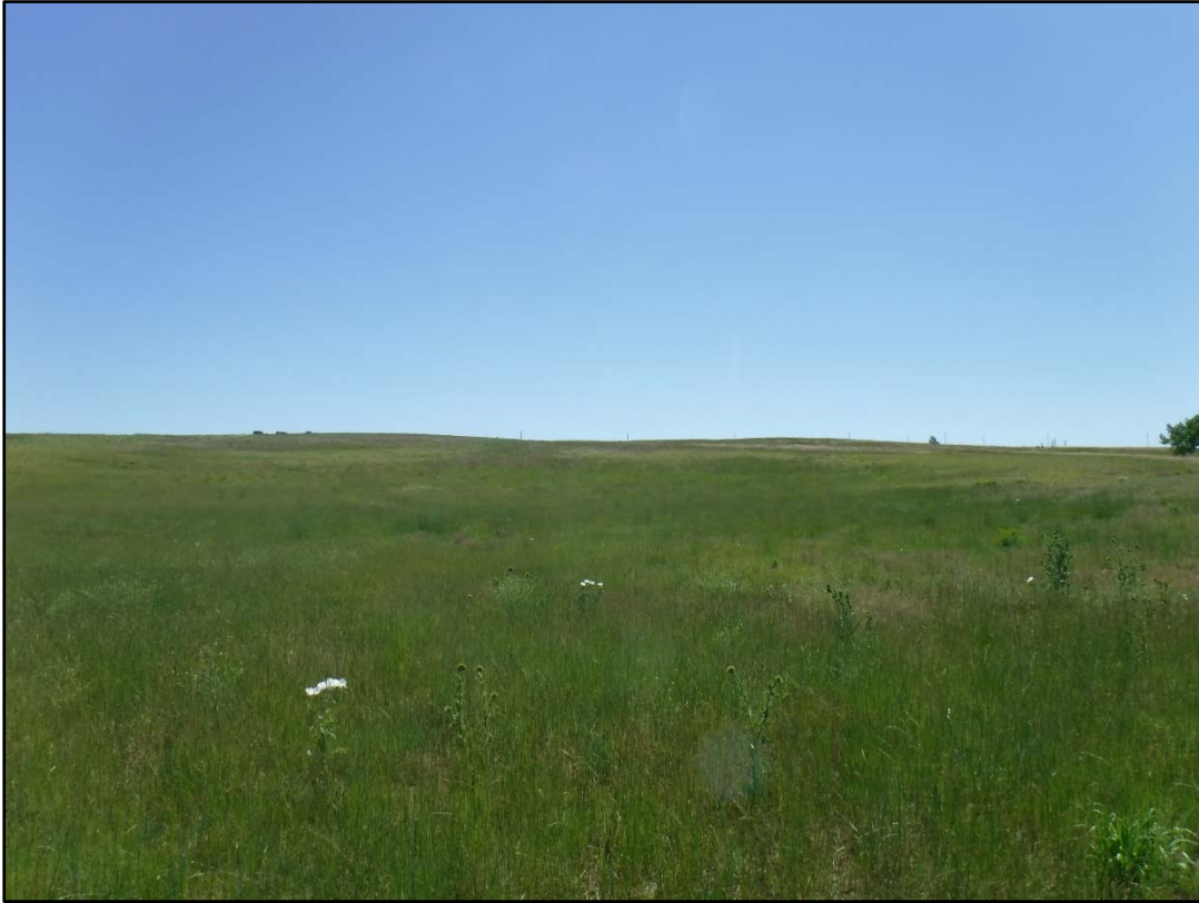
Photo 5: Looking southeast across the reclaimed area from near the western boundary of release area