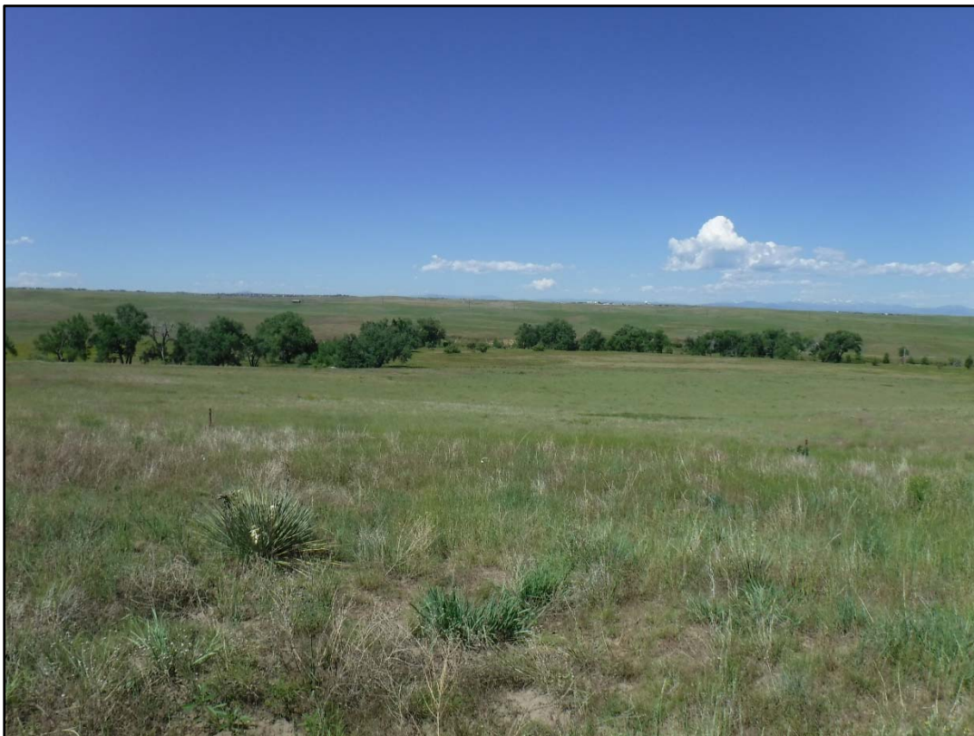
Photo 2: Looking southwest across the reclaimed area from near the access road