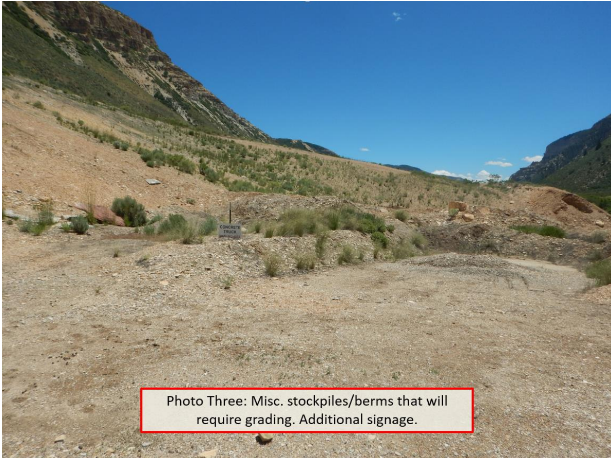
Photo Three: Misc. stockpiles/berms that will require grading. Additional signage.