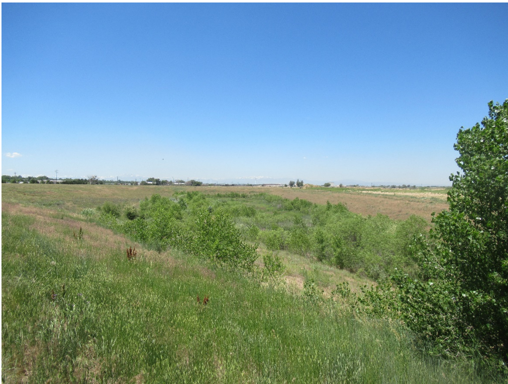
View of the lake in the west area looking west from the southeast corner