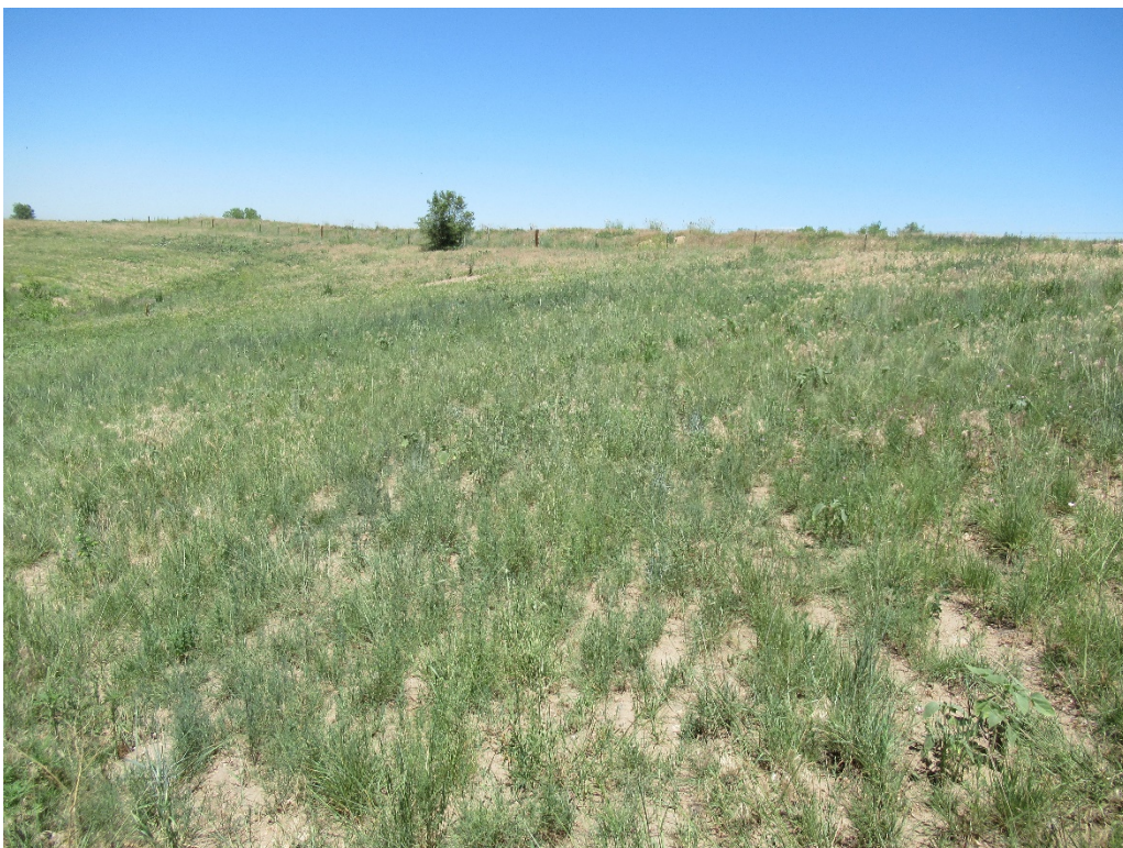
View of vegetation in the south portion of the east area