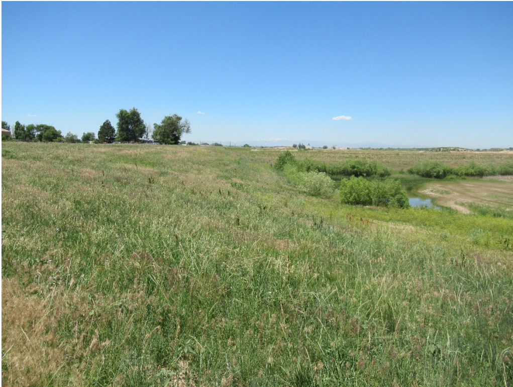
View of vegetation in the south portion of the east area southeast of the lake