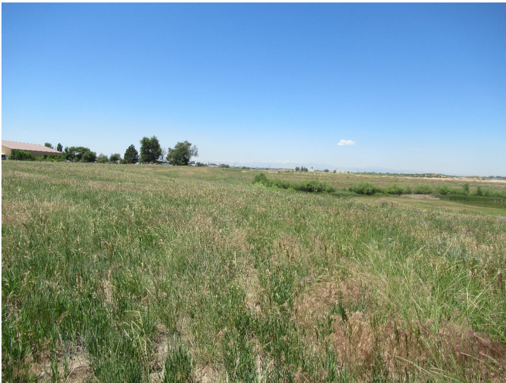
View of vegetation in the south portion of the east area southeast of the lake