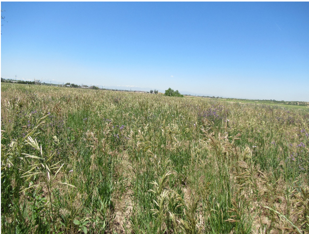
View of typical vegetation in the west area looking west