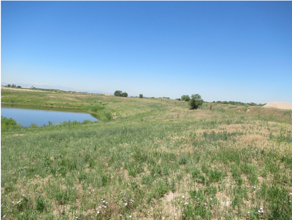
View of the north shoreline of the northeast lake looking west