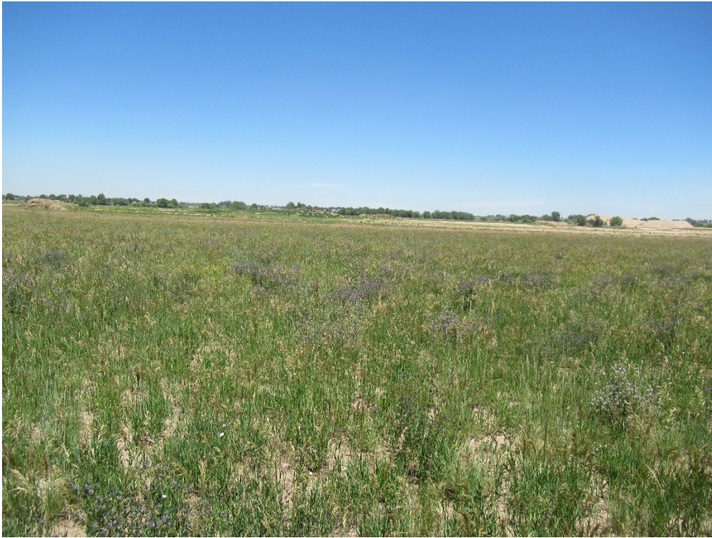
View of typical vegetation in the middle of the west area looking north