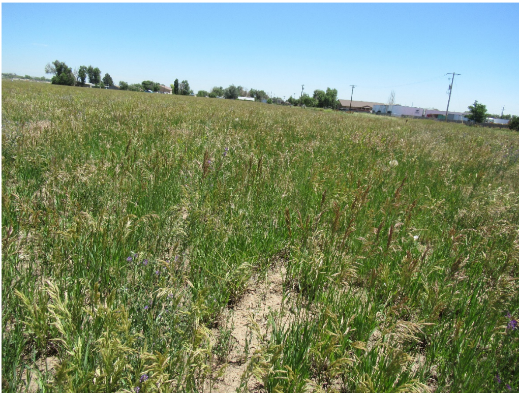
View of typical vegetation in the middle of the west area looking east