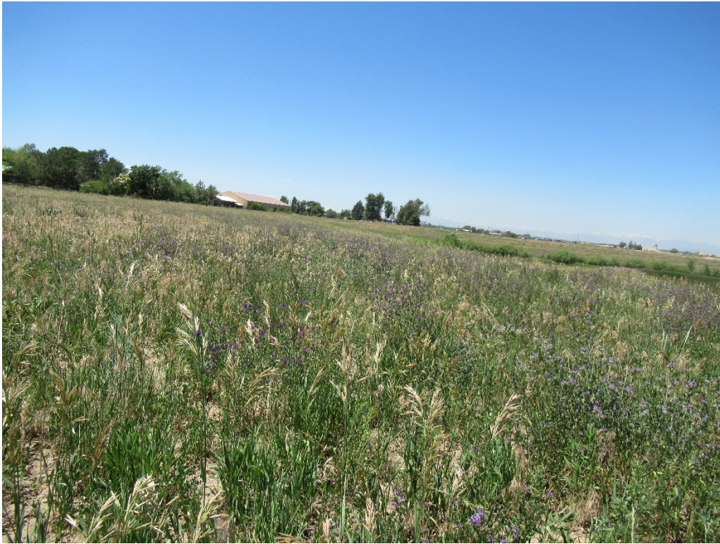
View of vegetation in the south portion of the east area east of the lake