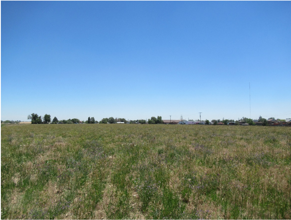
View of the west area from the west side looking east