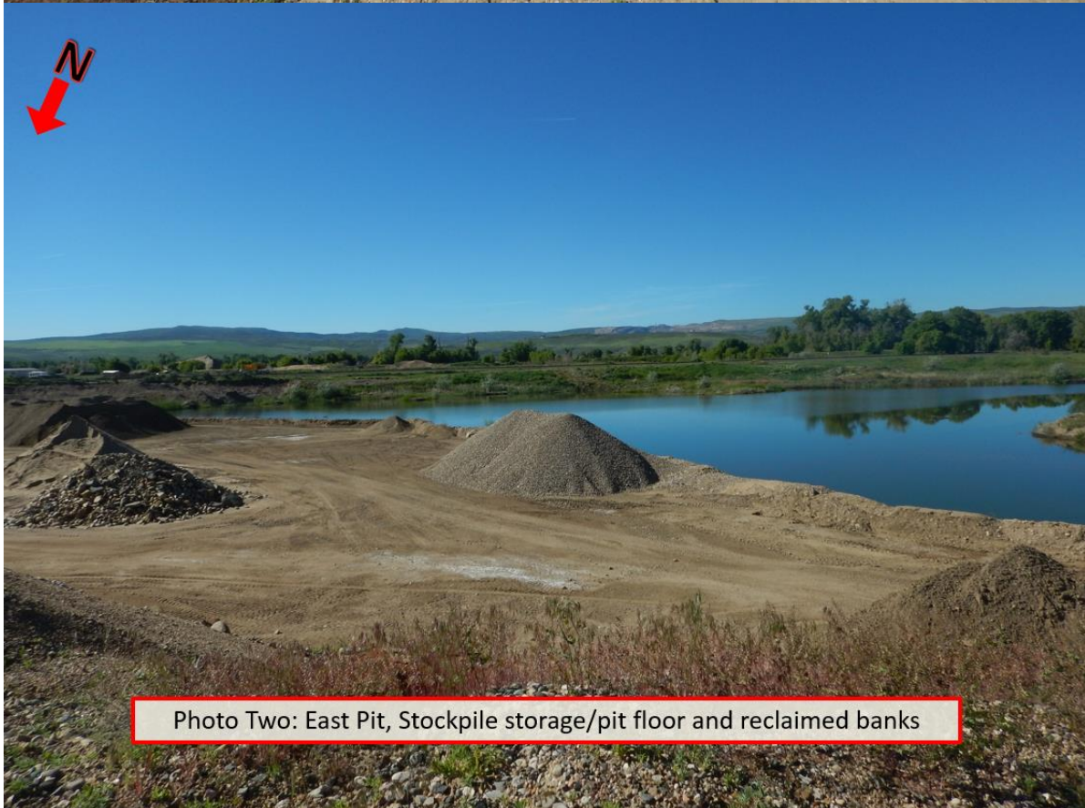
Photo Two: East Pit, Stockpile storage/pit floor and reclaimed banks