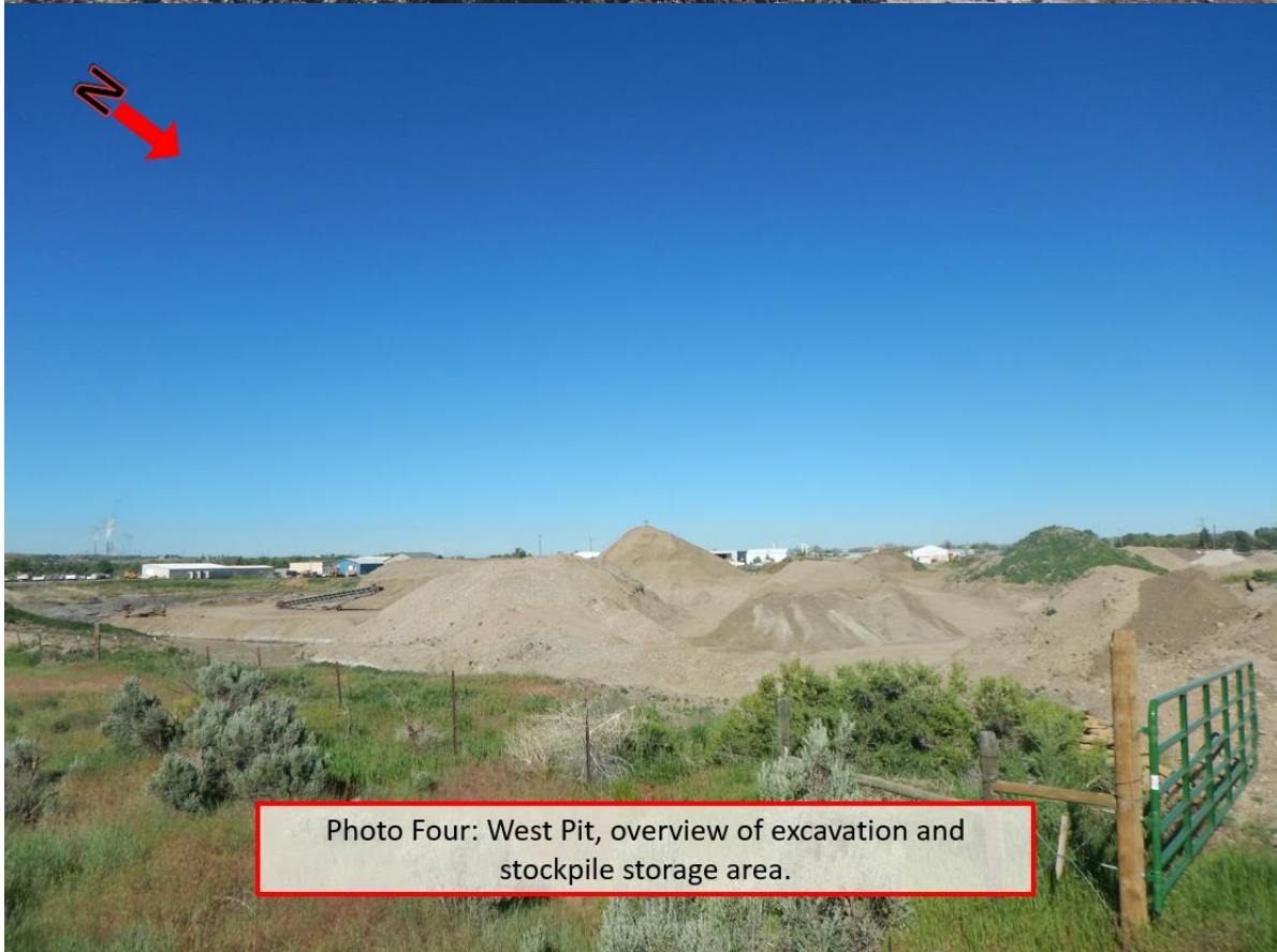
Photo Four: West Pit, overview of excavation and stockpile storage area.