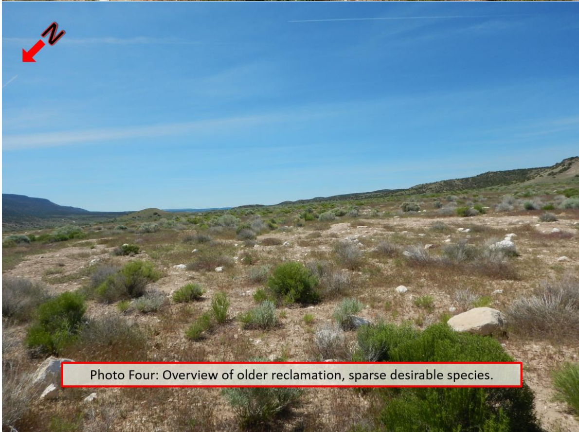
Photo Four: Overview of older reclamation, sparse desirable species.