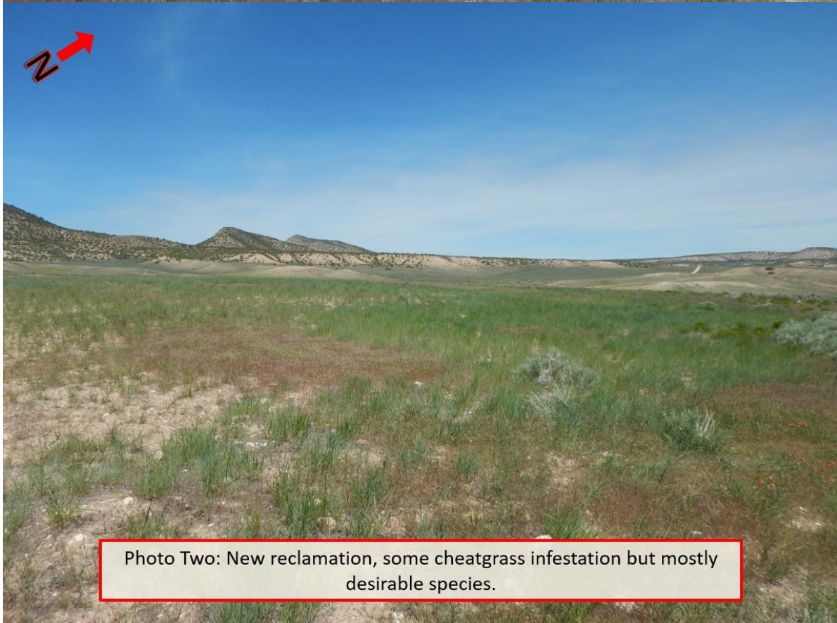
Photo Two: New reclamation, some cheatgrass infestation but mostly desirable species.