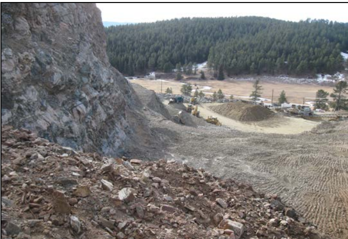
3. Overview of lower quarry. Photo taken from north end of highwall.