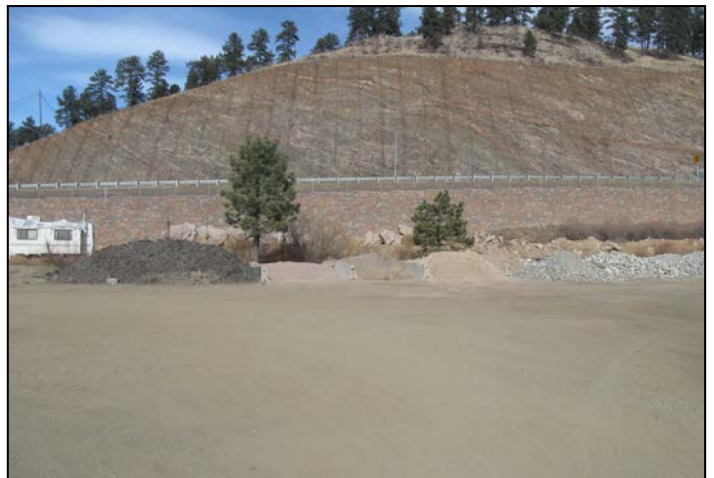
6. Quarry floor and product stockpiles.