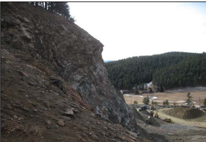
5. Overview of upper section of highwall.