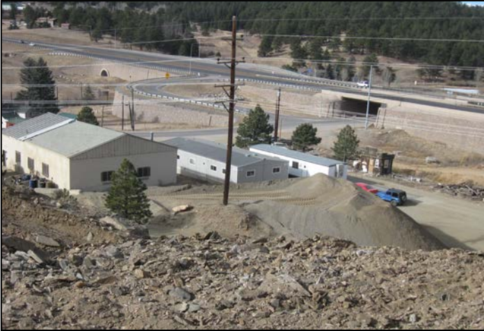
1. Overview of mine facilities.