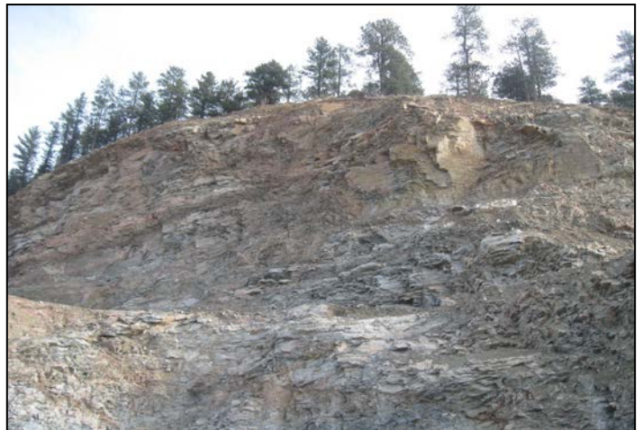
4. Northern section of the highwall. Photo taken facing east.