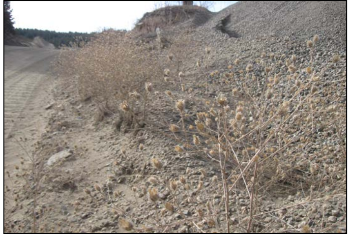
2. Diffuse knapweed growing along internal mine road.