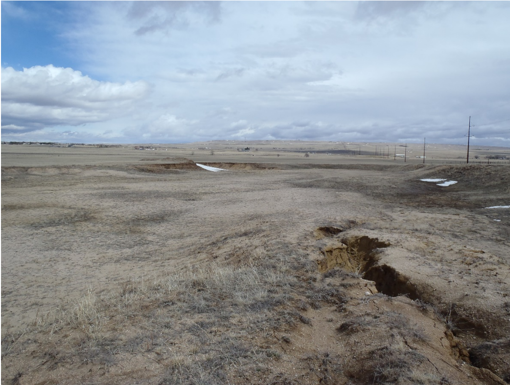
Photo 3. Observed disturbance (same as 2015 inspection, looking east from access road).