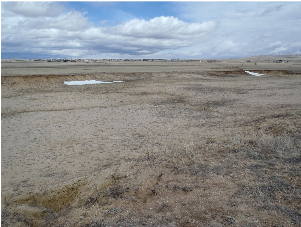
Photo 2. Observed disturbance (same as 2015 inspection, looking NE from access road).