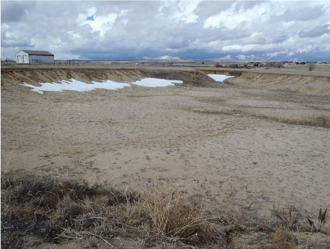
Photo 1. Observed disturbance (same as 2015 inspection, looking NW from access road).