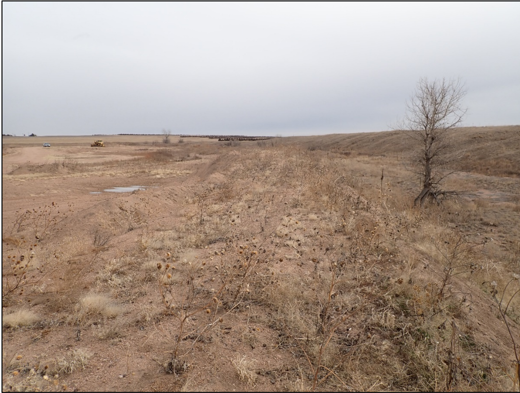
Photo 7. Sandy Creek (right) and current Phase 2 excavation (left); looking downstream to the northeast.

Rick Ensminger P.O. Box 276 Haxtun, CO 80731