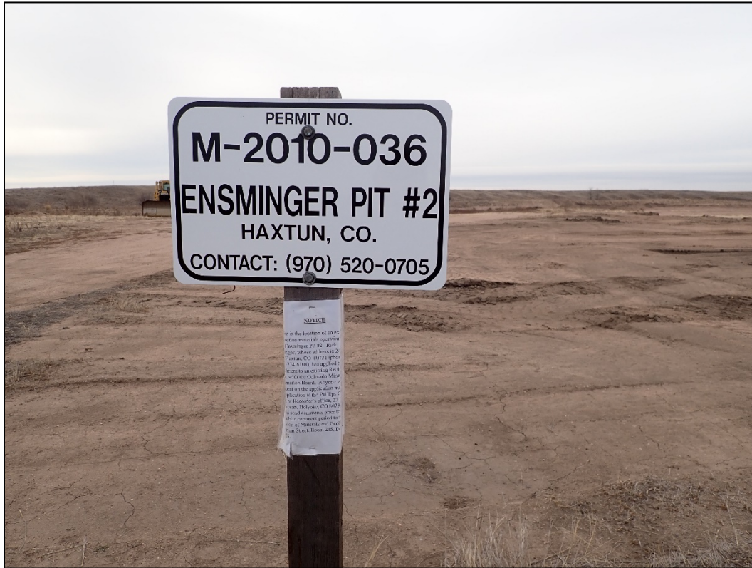
Photo 1. Mine identification sign and on-site AM-01 notice; looking south.