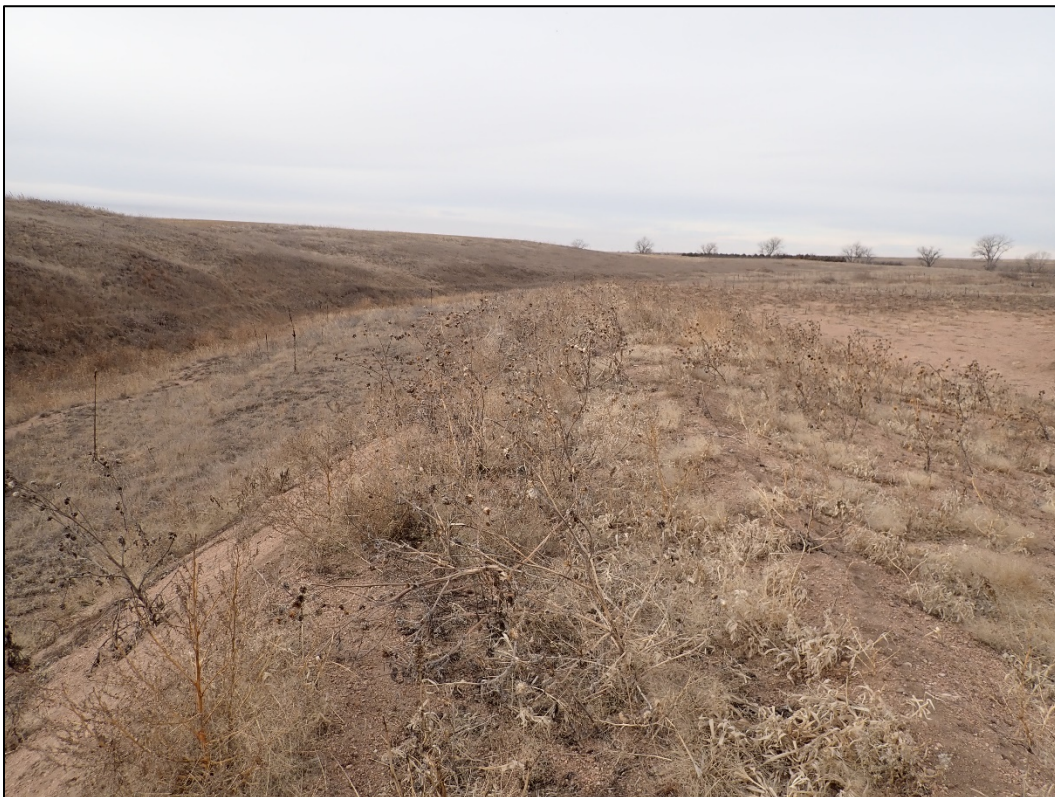
Photo 6. Sandy Creek (left) and current Phase 2 excavation (right); looking upstream to the southwest.