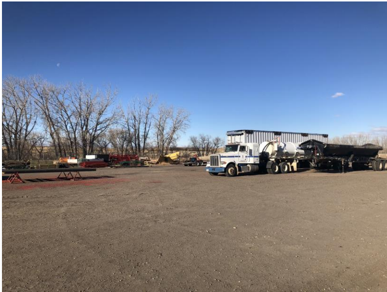
Facilities yard, west side

Number of Partial Inspection this Fiscal Year: 4