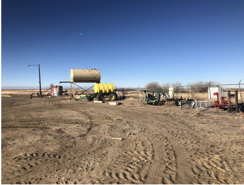
Facilities yard, north side