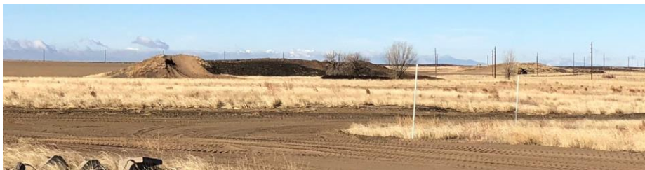
Topsand Pile A-3

Number of Partial Inspection this Fiscal Year: 4