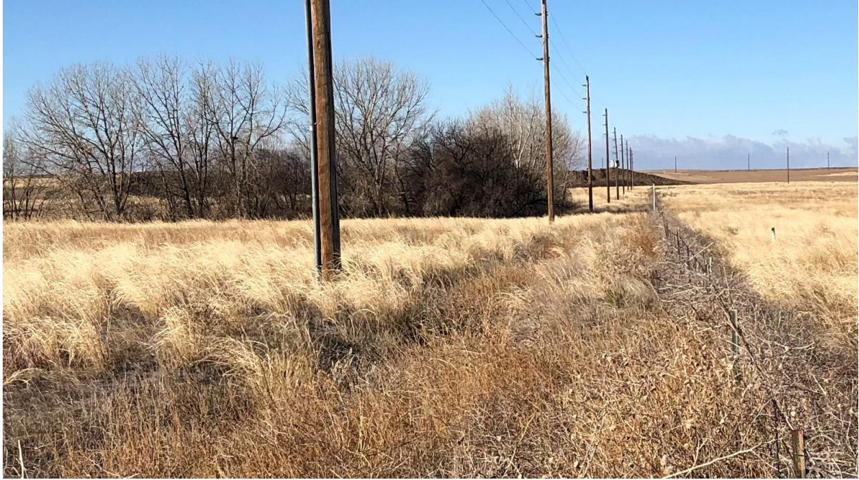
Sediment Pond 2 and area below it – the discharge point (spillway) is near the line of power poles

Number of Partial Inspection this Fiscal Year: 4