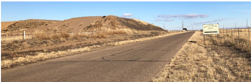
Entrance sign and Topsand Pile A-1