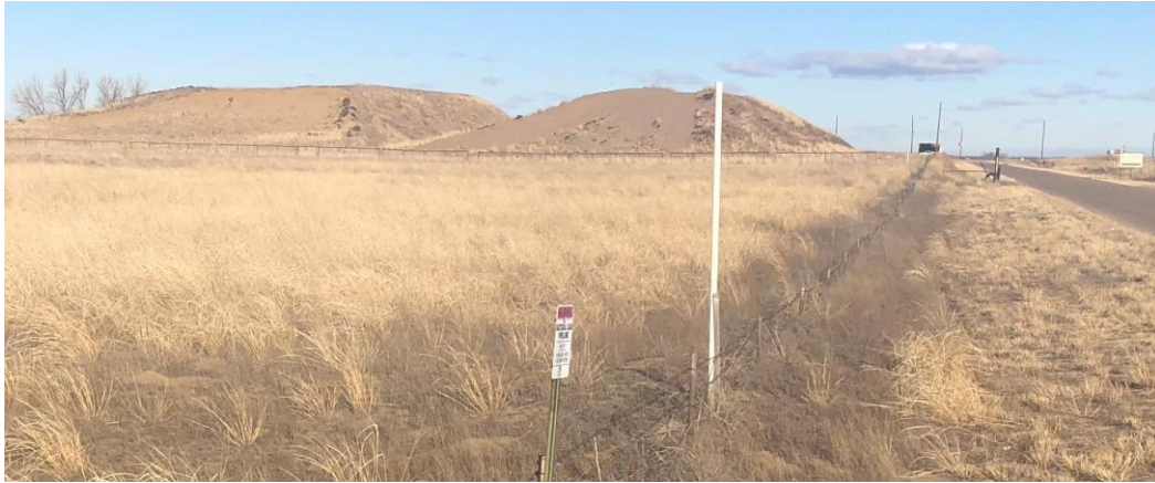
Southern sides of Topsand Piles B-1 and A-1 and permit boundary marker