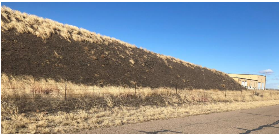
Eastern side of Topsand Pile A-1

Number of Partial Inspection this Fiscal Year: 4