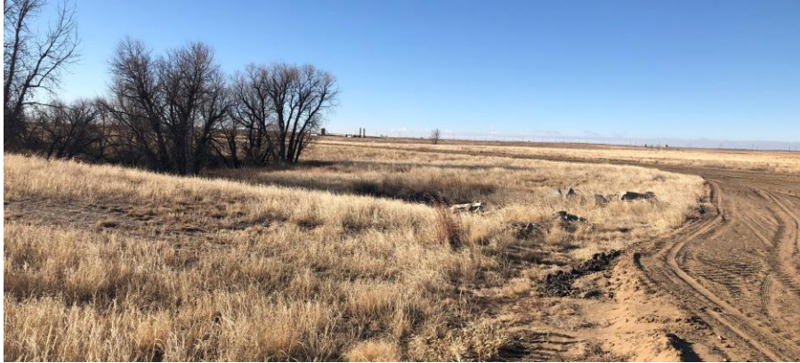
Area below Dugout Pond