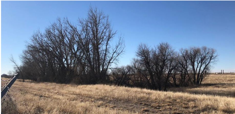
East side of Dugout Pond