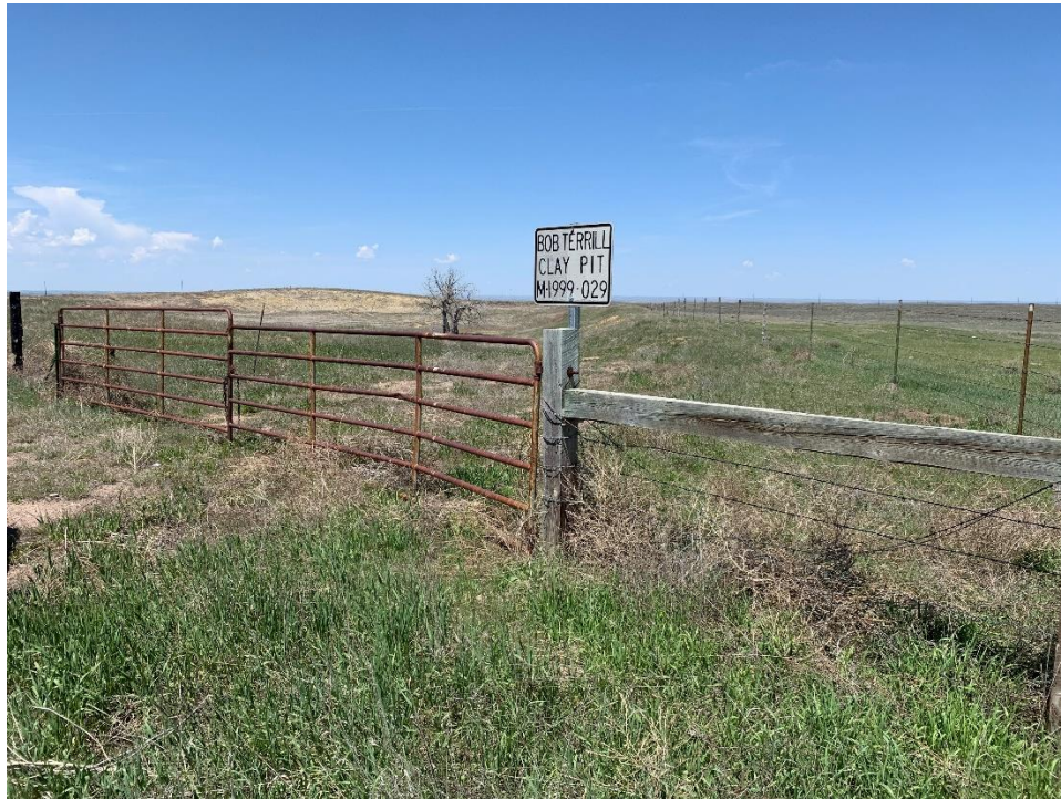
Mine Identification Sign Mounted to Post