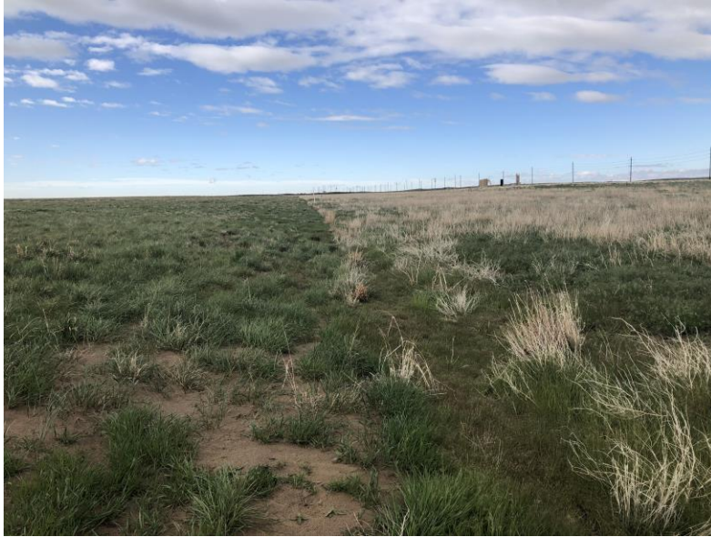
Looking south at Area 32 (on left) and undisturbed area (on right)