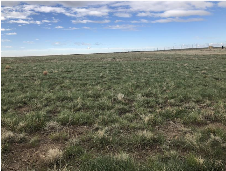
Looking south at Areas 32 (foreground) and 31

Number of Partial Inspection this Fiscal Year: 8