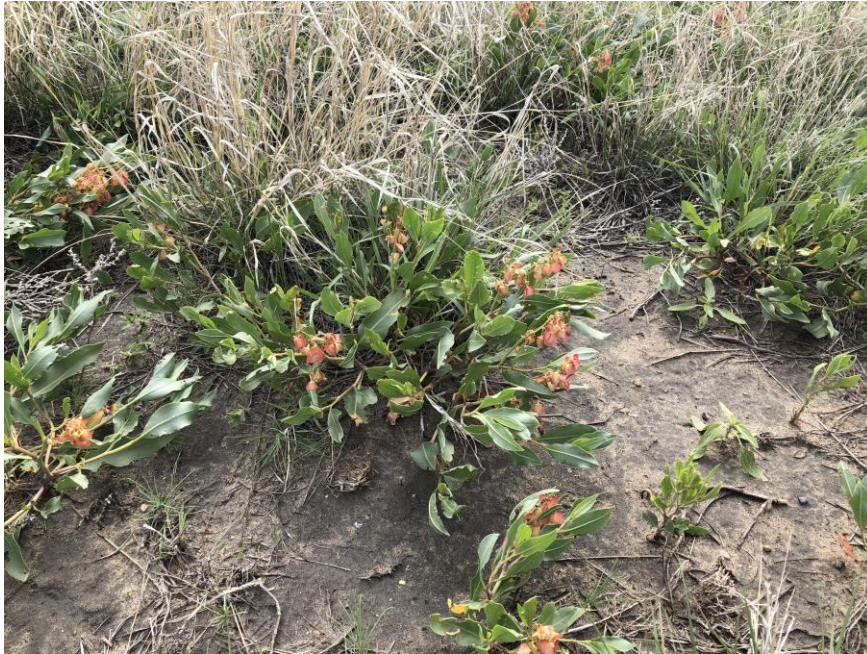
Unidentified plant between Dugout Pond and facilities area