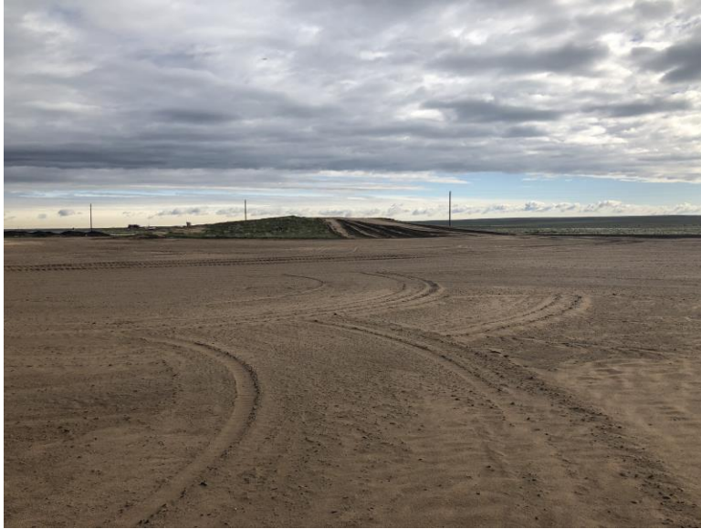
Remainder of B Horizon topsand in pile north of spoil area