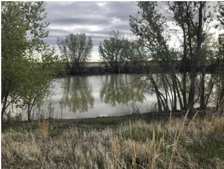
Sediment Pond 2

Number of Partial Inspection this Fiscal Year: 8