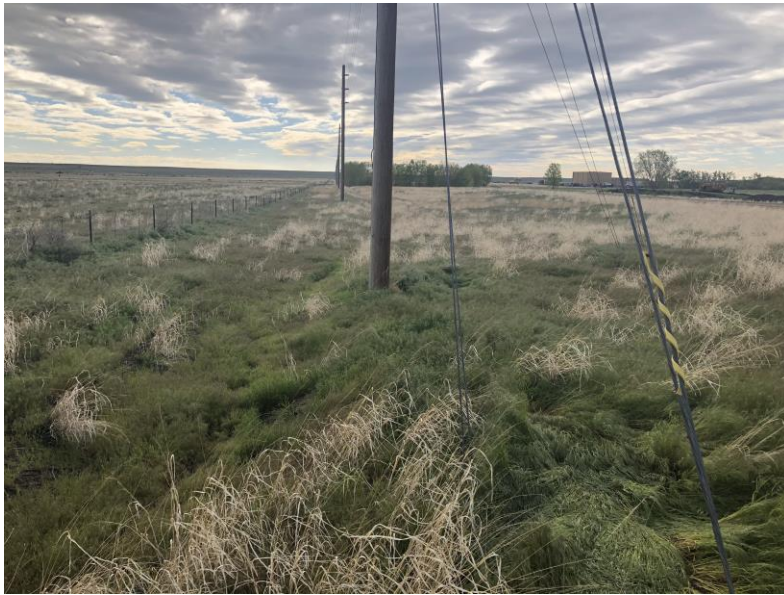
West Perimeter Ditch, looking east with Sediment Pond 2 in background (under trees)