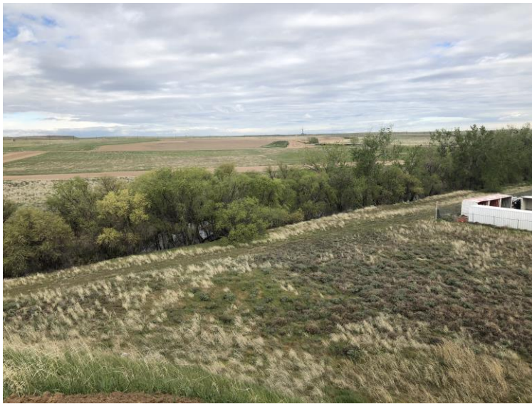
Dugout pond, Area 25, and long term spoil area

Number of Partial Inspection this Fiscal Year: 8