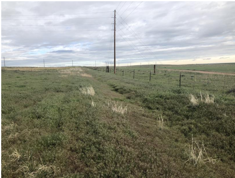
West Perimeter Ditch, looking west toward northwest corner of site

Number of Partial Inspection this Fiscal Year: 8