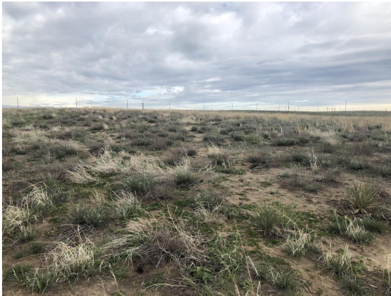
Undisturbed area north of B Pit

Number of Partial Inspection this Fiscal Year: 8