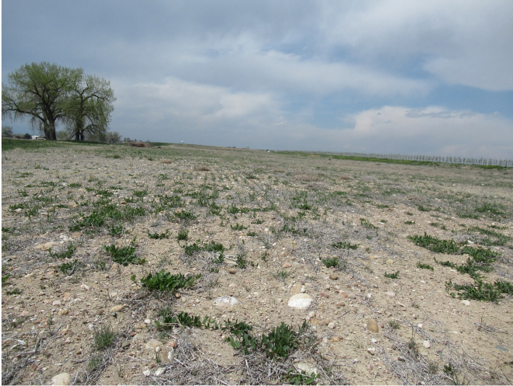
View of Phase 1 pit floor vegetation looking west