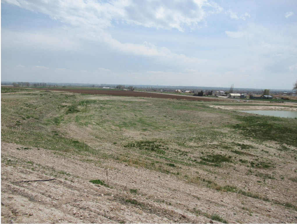
View of Phase 3 from the north side looking south