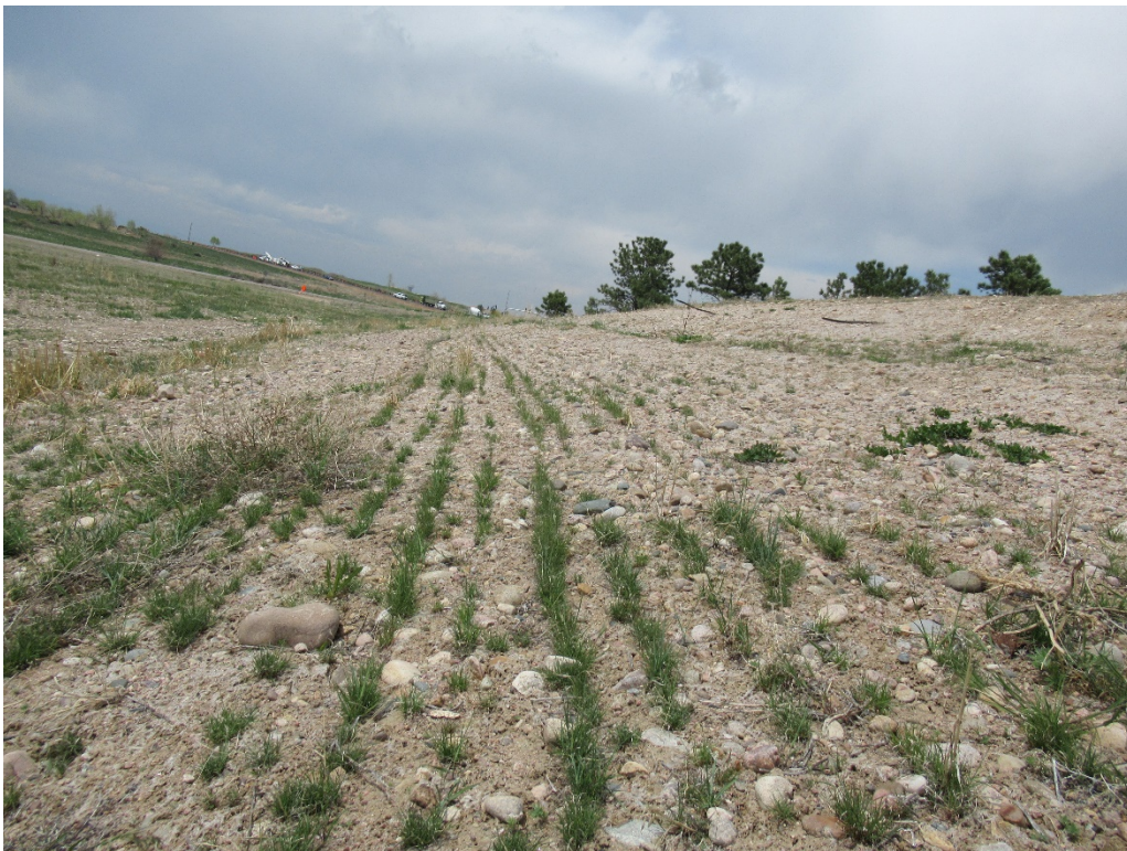
View of Phase 3 north slope vegetation looking west