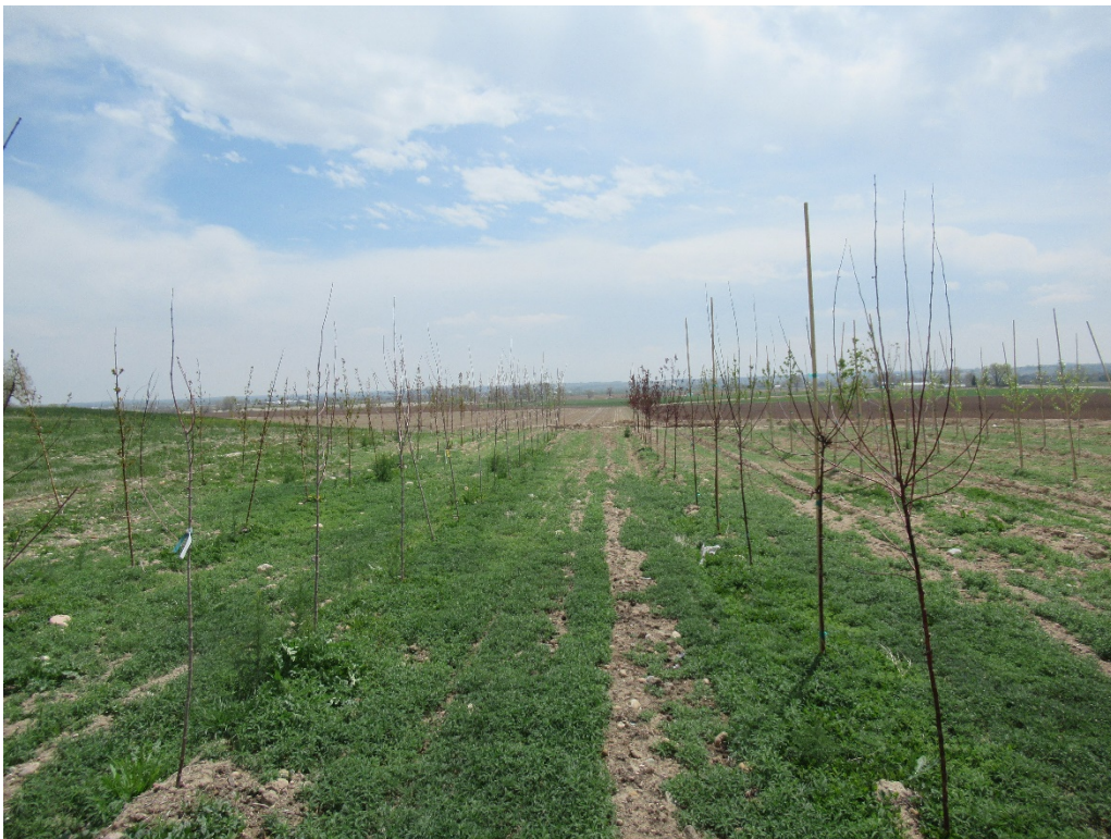
View of Phase 2 from the north side looking south