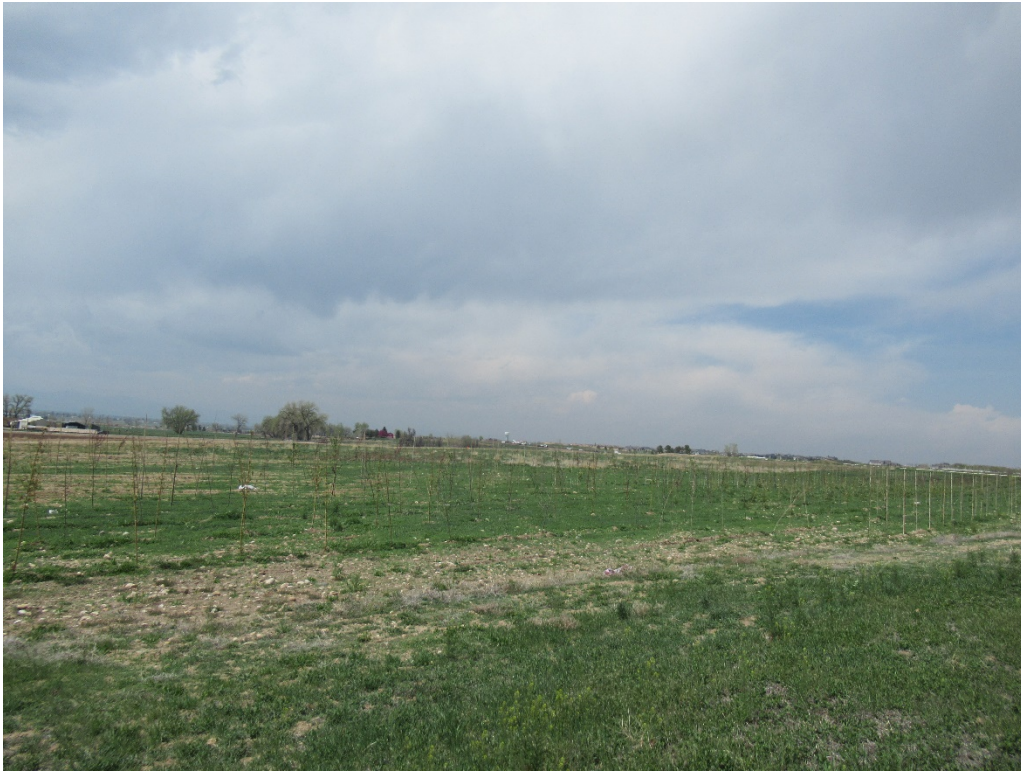
View of Phase 2 from the east side looking west