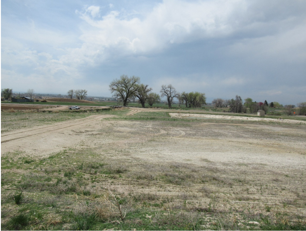
View of Phase 3 from the southeast corner looking west