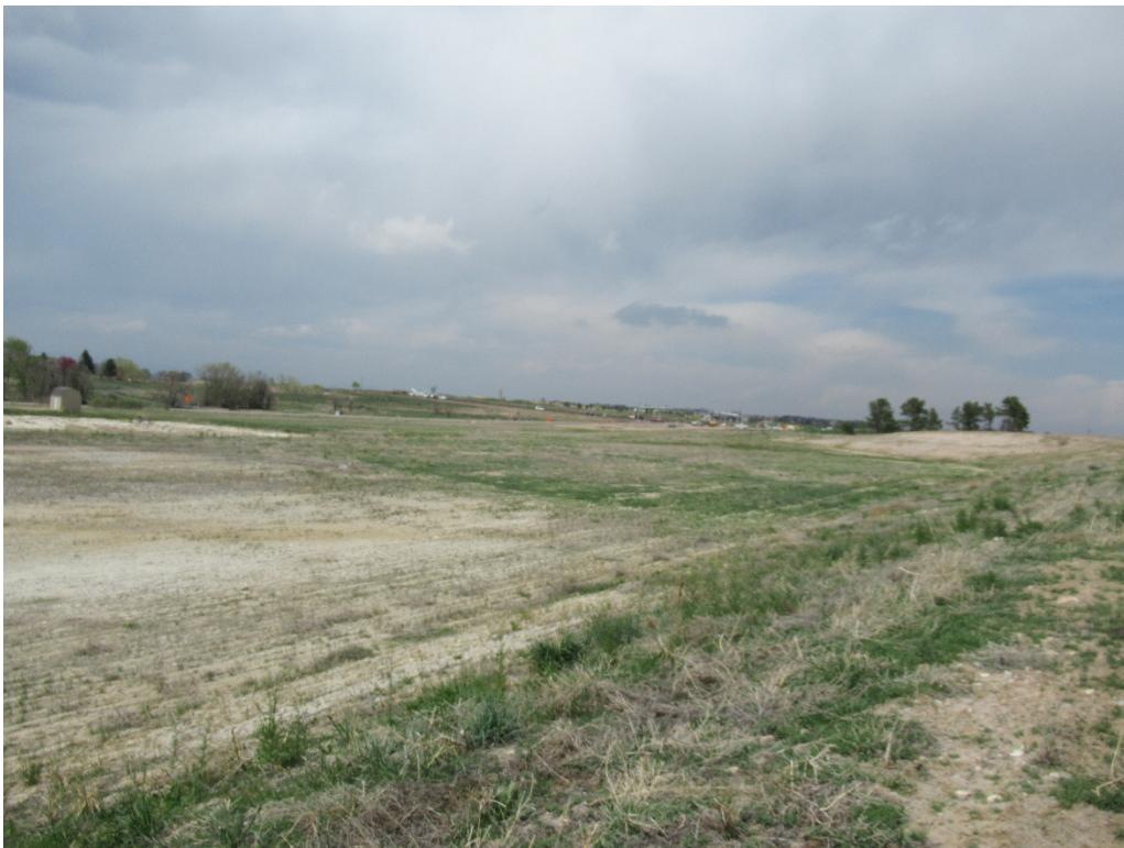
View of Phase 3 from the southeast corner looking northwest