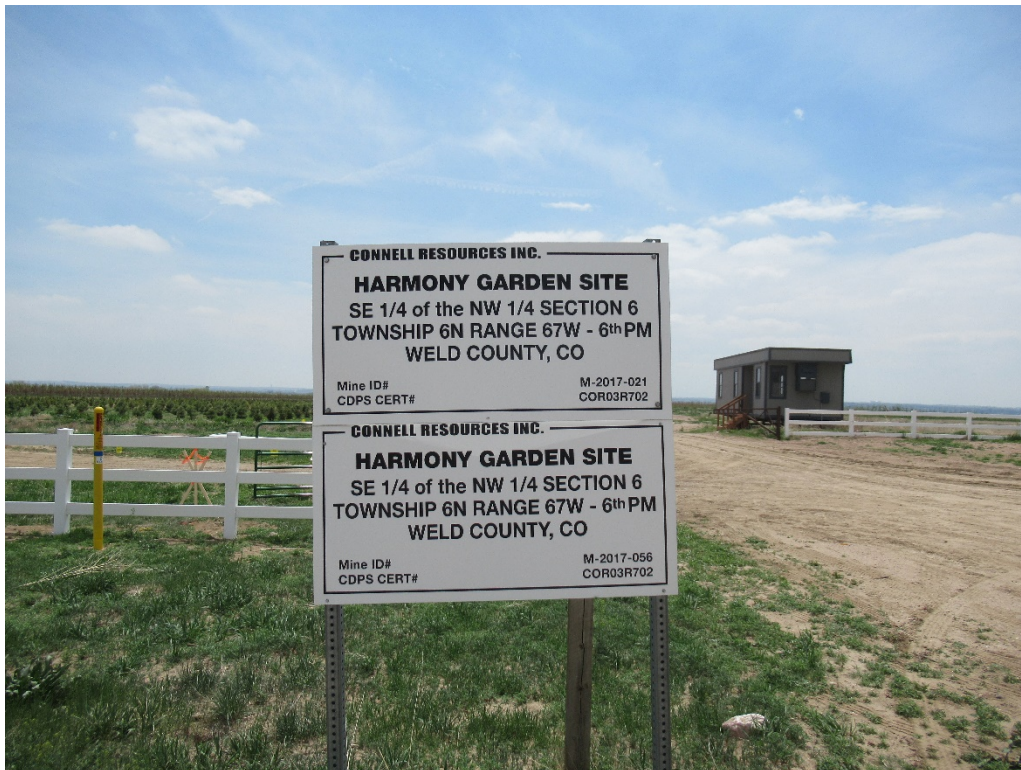
Harmony Windsor Site mine sign