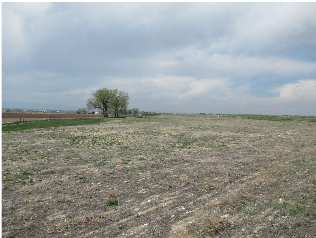
View of Phase 1 from the east side looking west