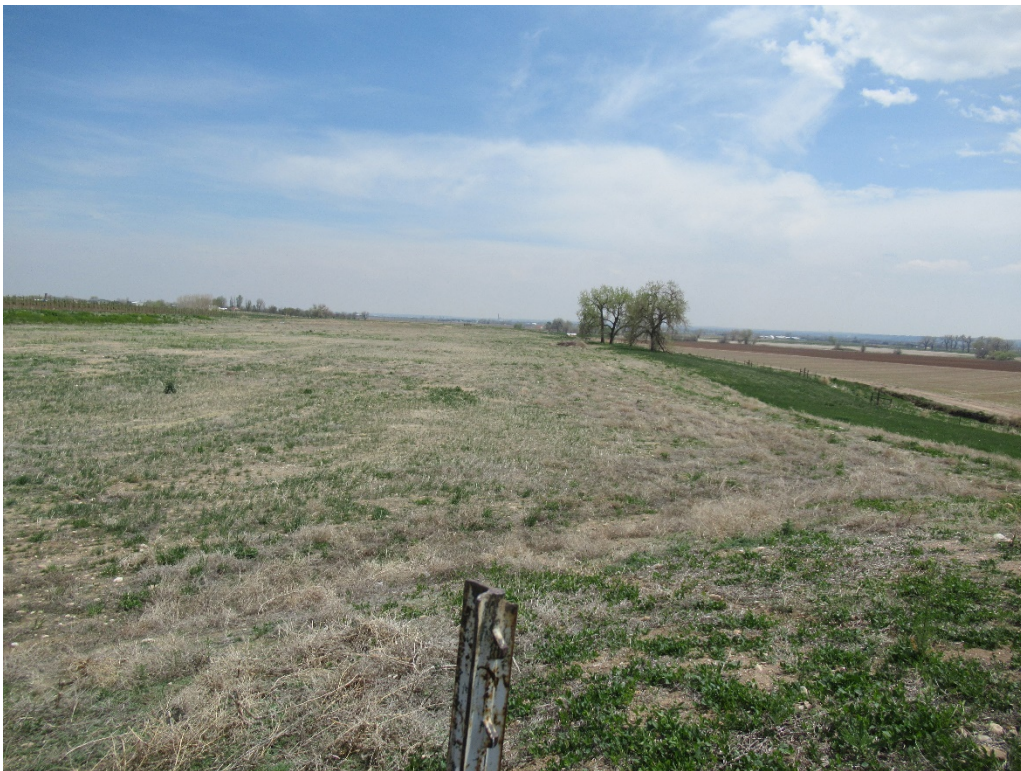
View of Phase 1 from the west side looking east