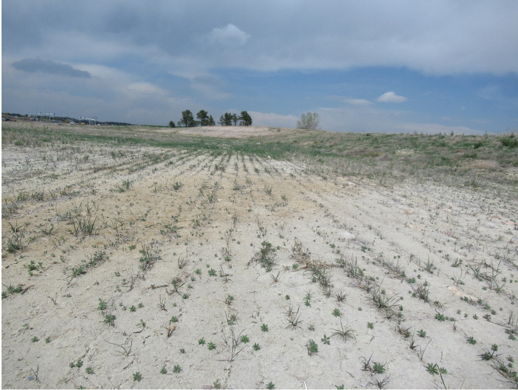
View of Phase 3 pit floor vegetation looking north