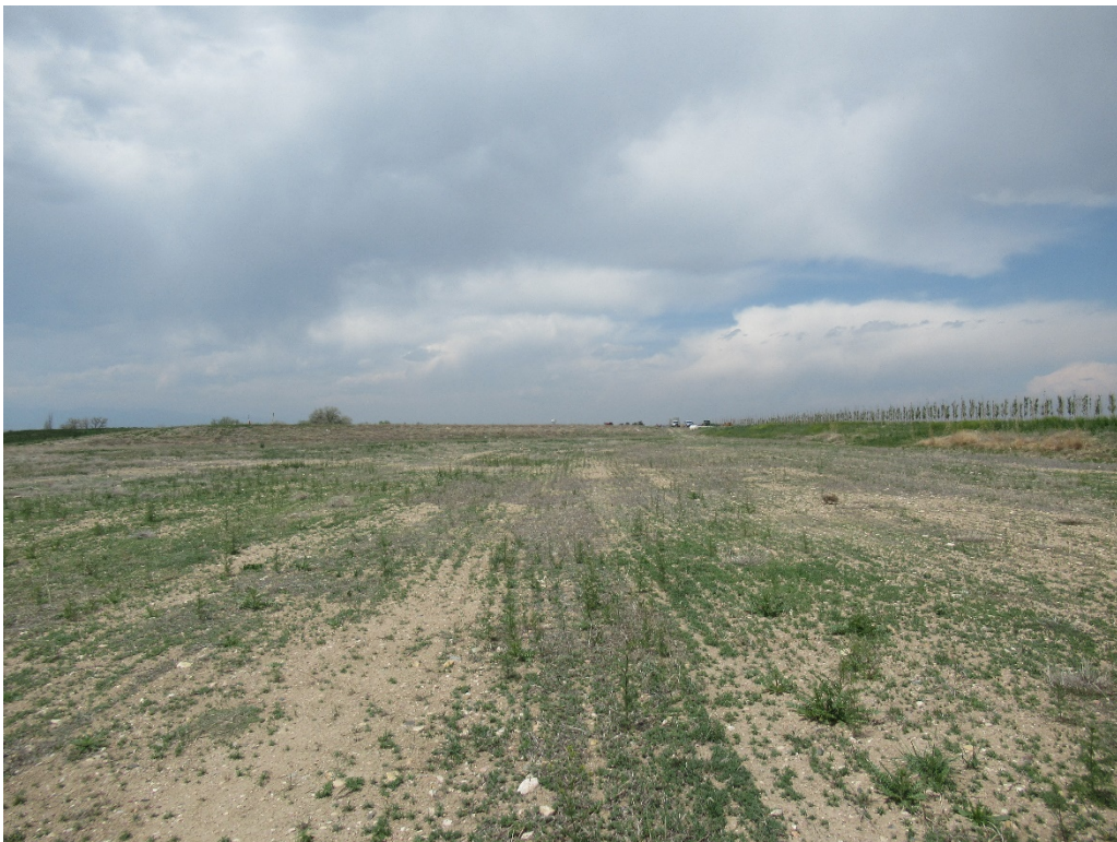
View of the East Mining Area pit floor from the middle of the area looking west