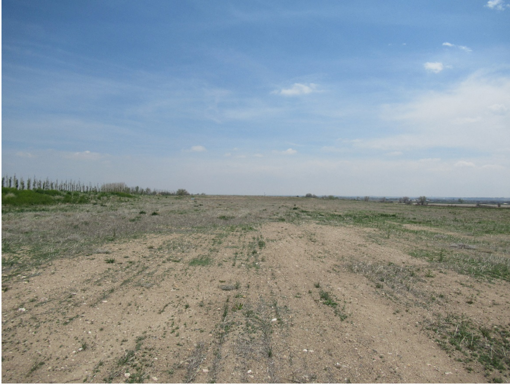
View of the East Mining Area pit floor from the middle of the area looking east