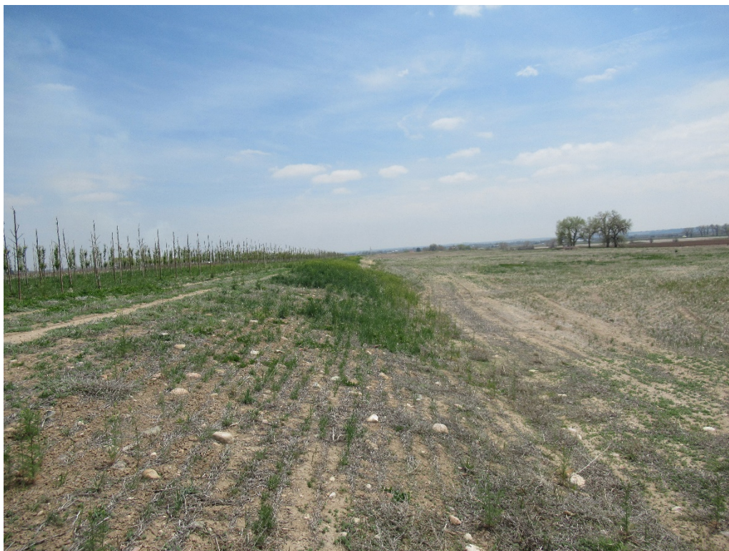
View of the East Mining Area from the northwest corner looking east