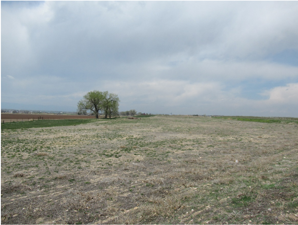
View of the East Mining Area from the southwest corner looking east