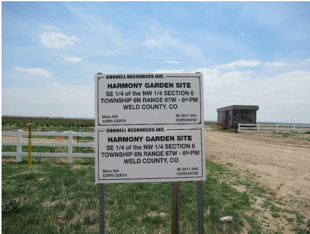
Harmony Gardens Site mine sign