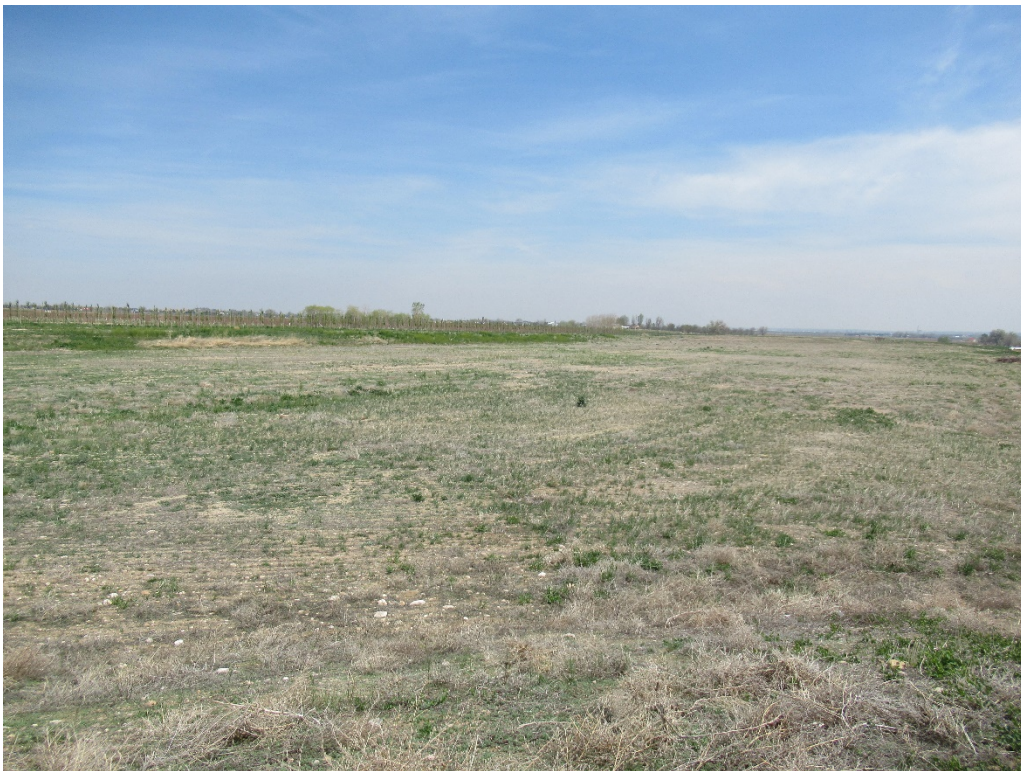
View of the East Mining Area from the southwest corner looking northeast