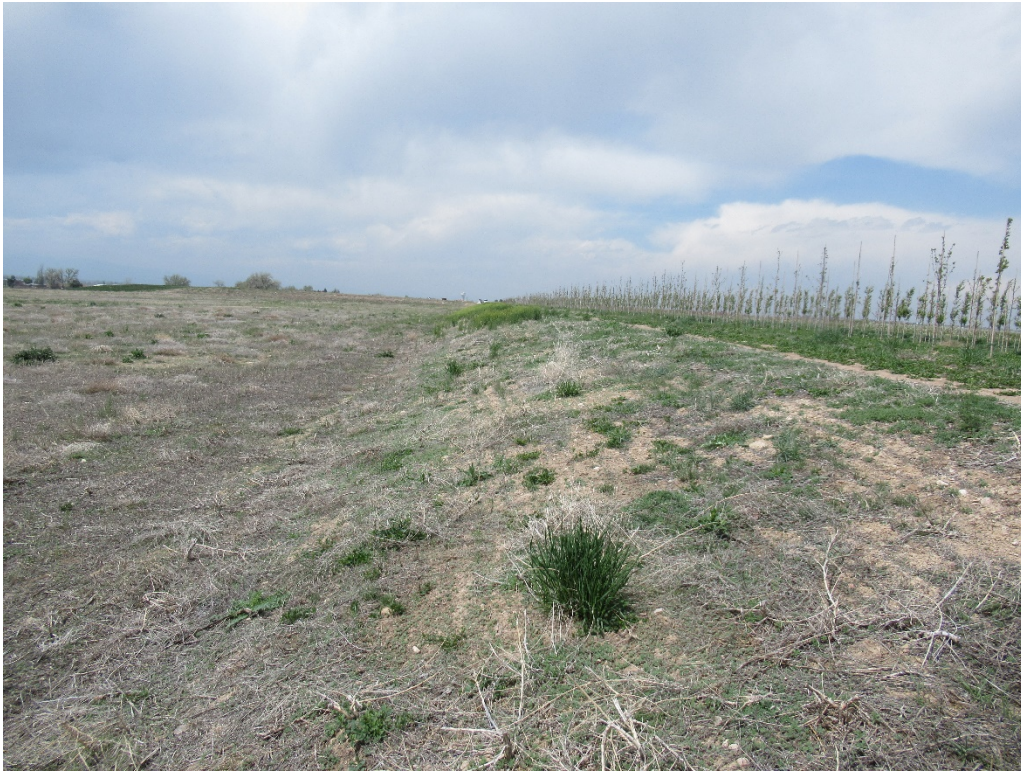
View of the East Mining Area from the northwest corner looking east