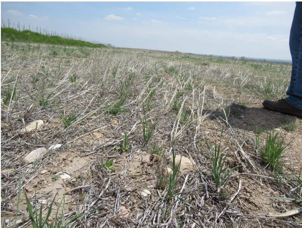
View of the East Mining Area pit floor vegetation