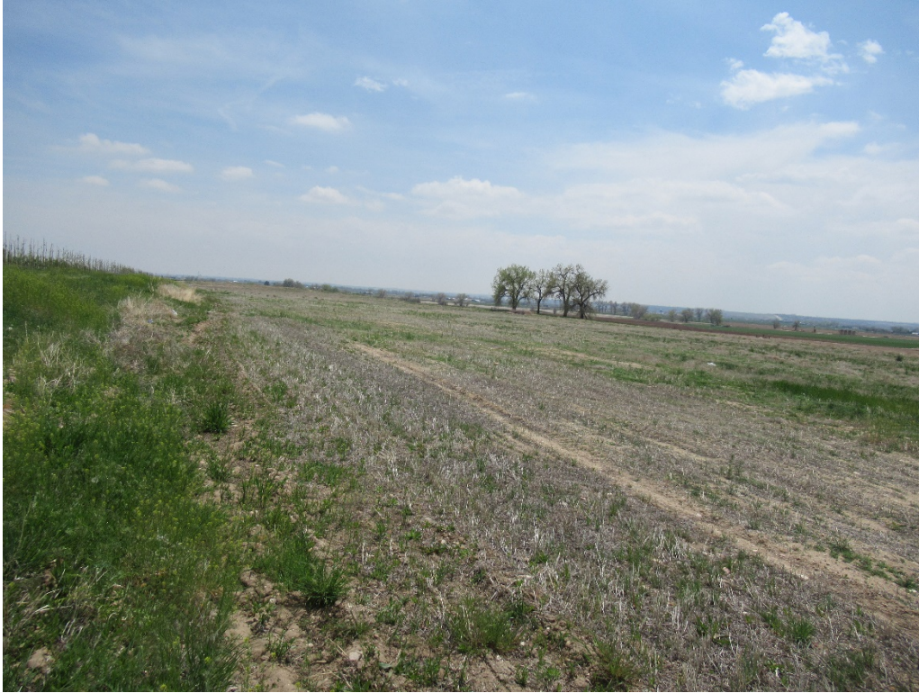
View of the East Mining Area from the northwest corner looking southeast