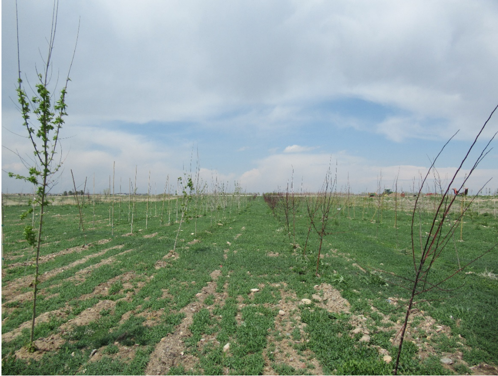
View of the West Mining Area from the south side looking north