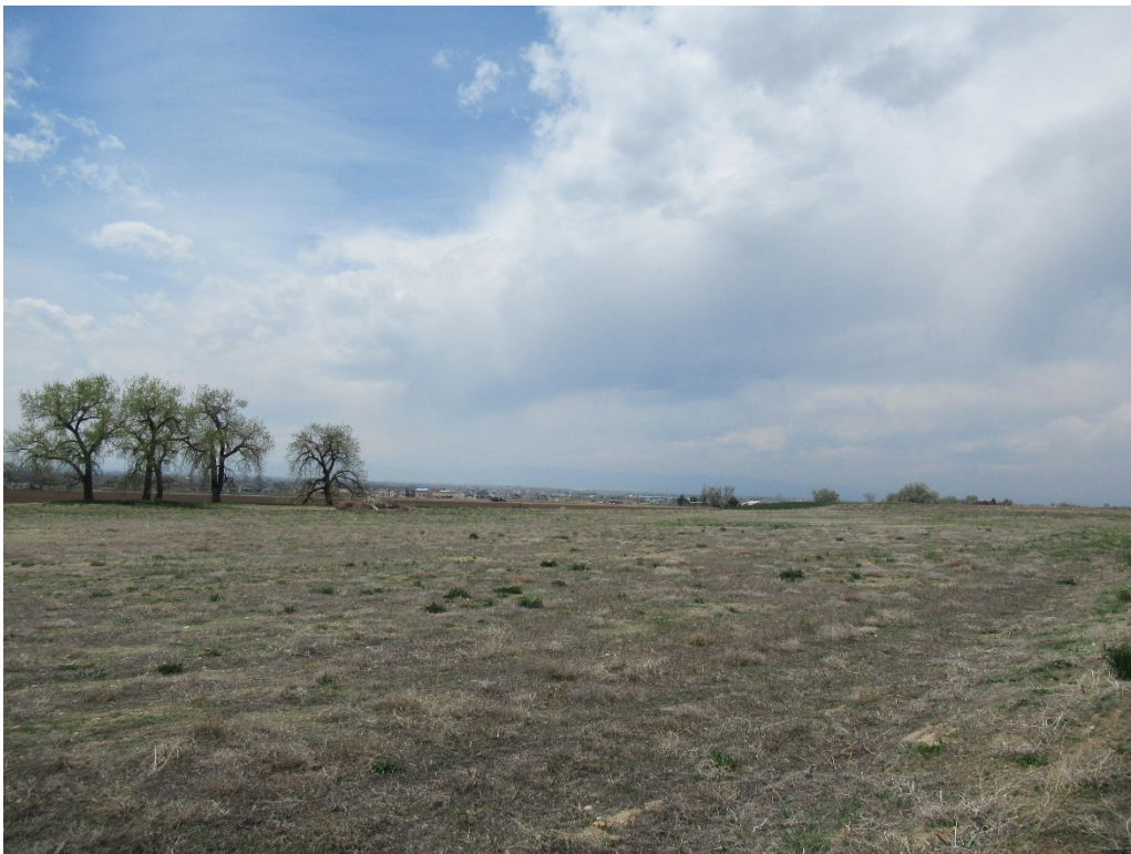
View of the East Mining Area from the northwest corner looking southeast