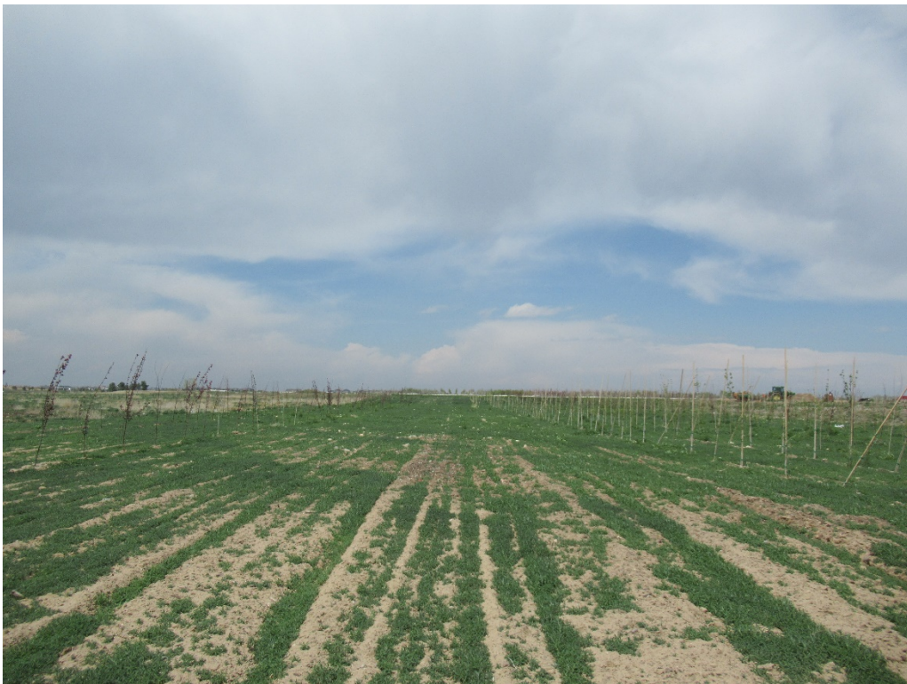
View of the West Mining Area from the south side looking north