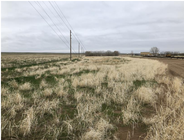
Looking east at north side of site. Sediment Pond is where trees are in middle of photo.

Number of Partial Inspection this Fiscal Year: 8