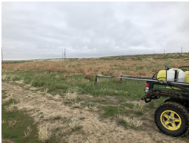
Northwest corner of site, looking south