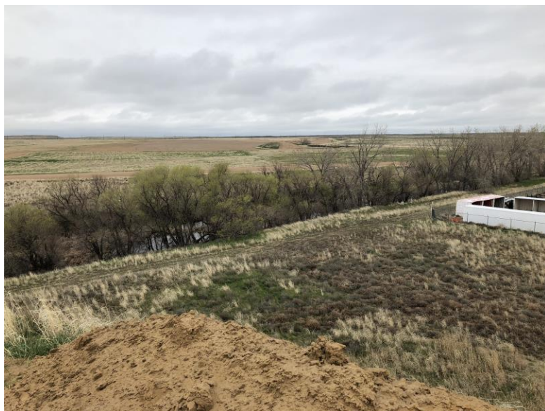
Dugout pond (below trees) and former spoil area in background

Number of Partial Inspection this Fiscal Year: 8