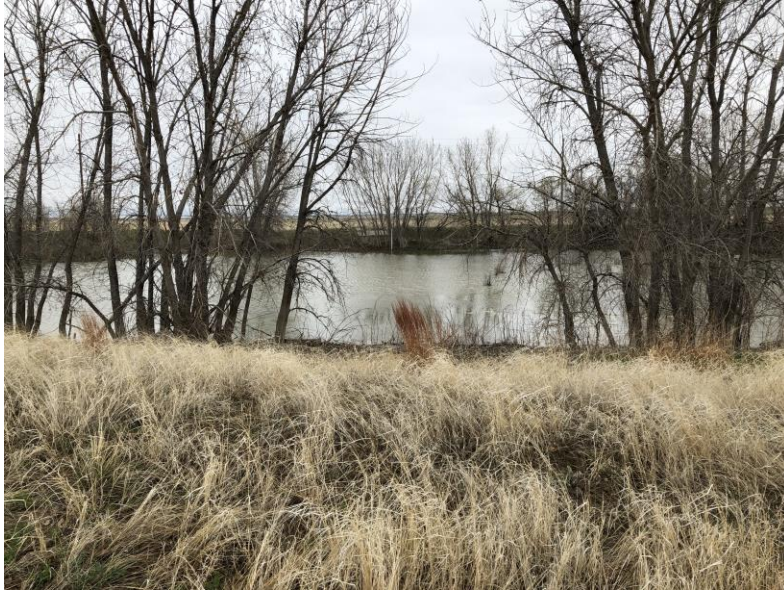
Sediment Pond #2