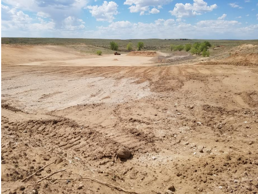
Figure 3. From the southeast corner of the affected land looking northwest.