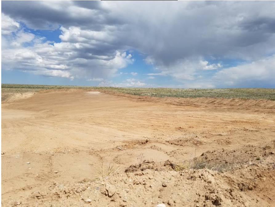
Figure 1. From the southwest corner of the affected land looking east.