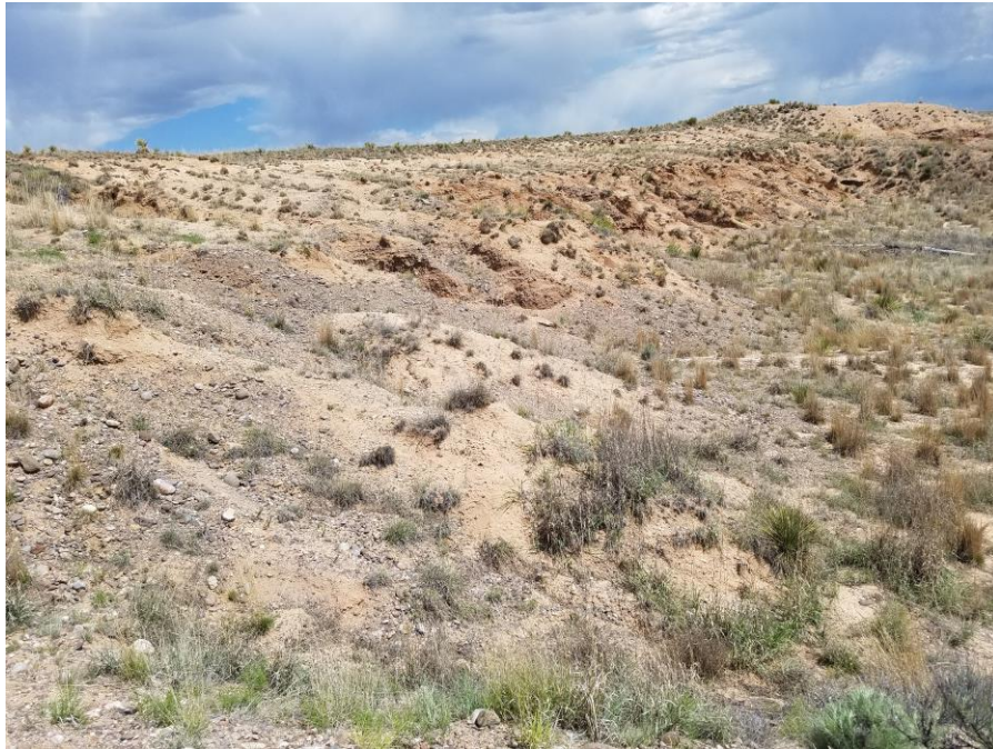
Figure 5. Pre-law affected land from the north central portion of the affected land looking east.

Rick Butler Baca County 741 Main St., Suite 1 Springfield, CO 81073