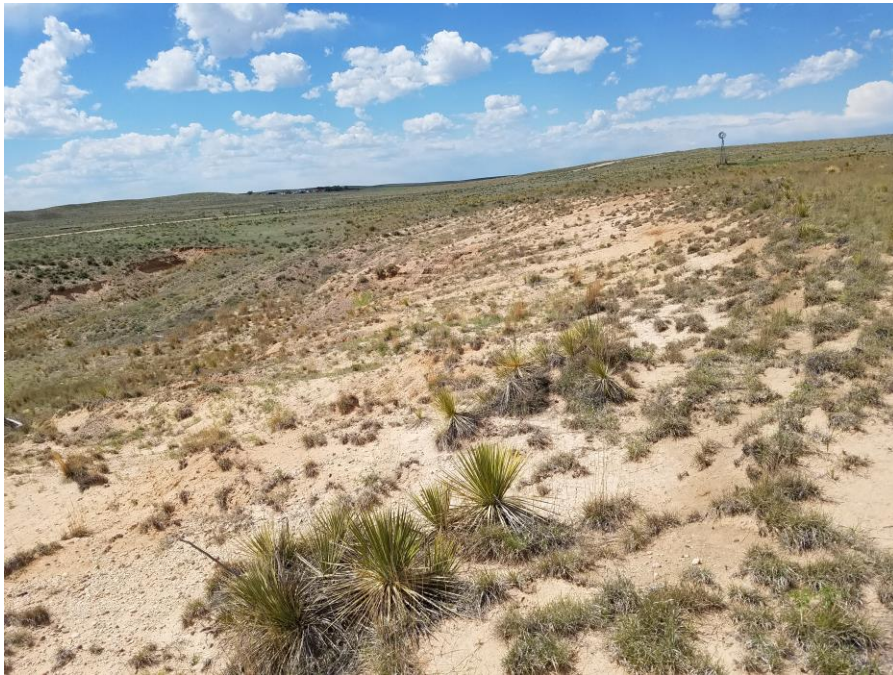
Figure 4. From the northeast portion of the affected land looking west-northwest at the pre-law affected land.