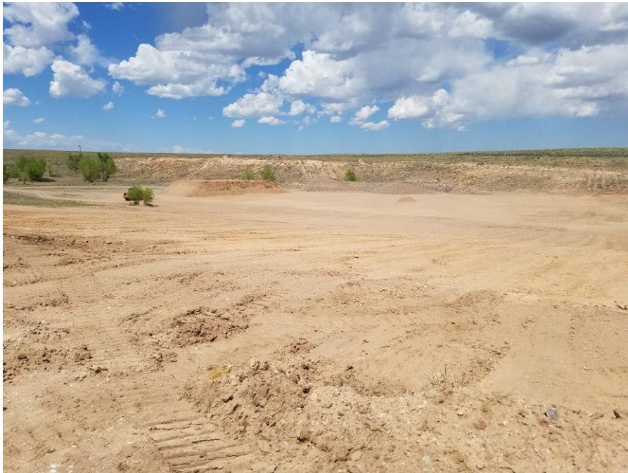
Figure 2. From the southwest corner of the affected land looking northeast.