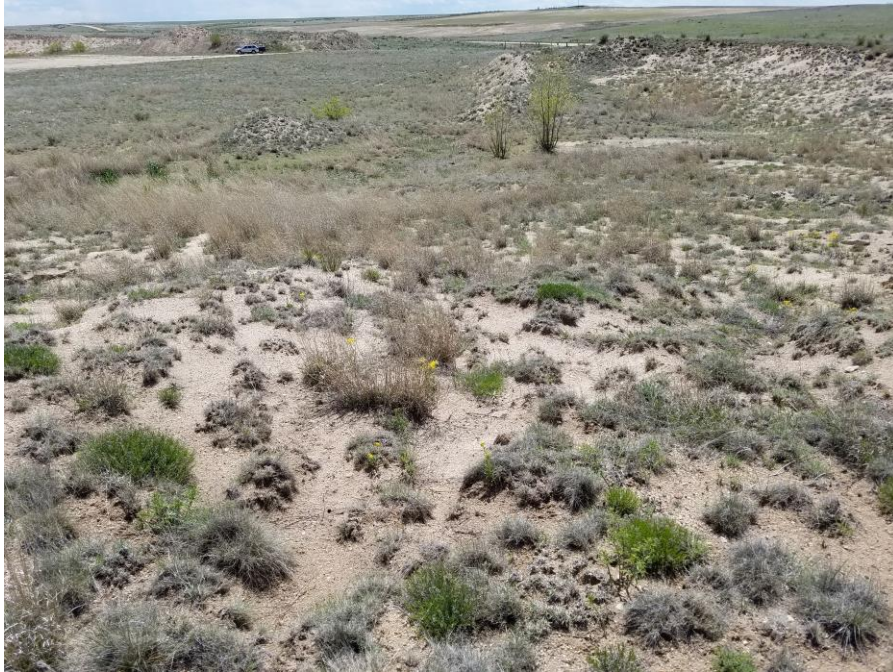
Figure 5. From the north east portion of the affected area looking southwest.

Kurt Eskew Baca County Hwy 160 Pritchett, CO 81064