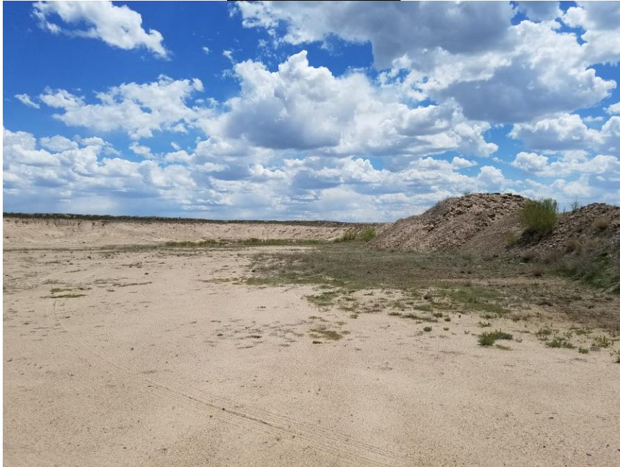
Figure 1. From the central portion of the affected area looking south.