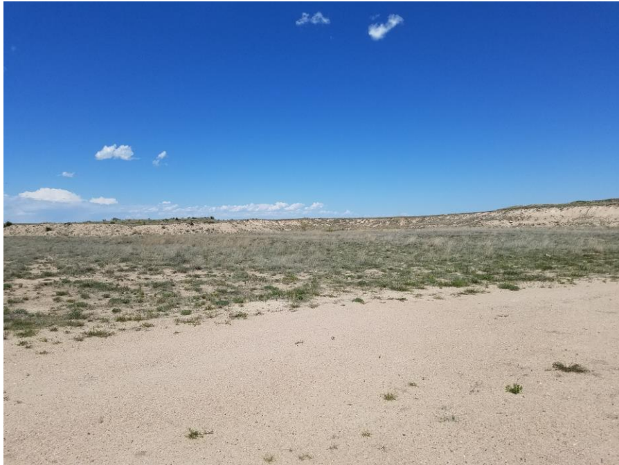
Figure 3. From the central portion of the affected area looking northeast.