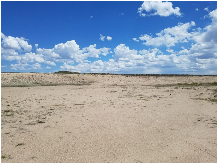
Figure 2. From the central portion of the affected area looking southeast.