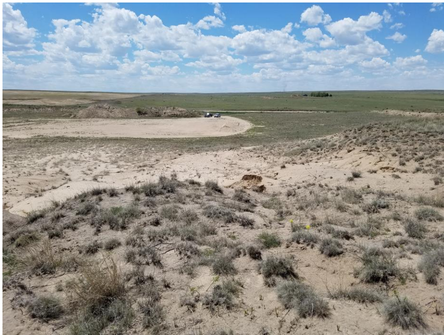
Figure 4. From the northeast portion of the affected area looking west.