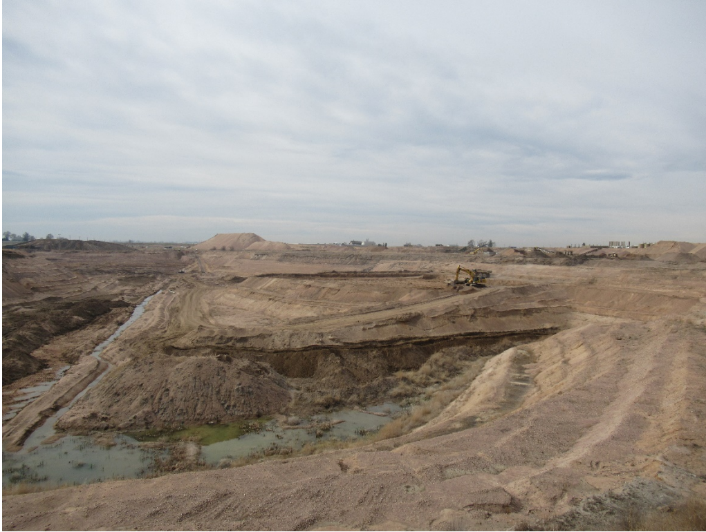
View of Phase 2 excavation from the northeast corner looking southwest