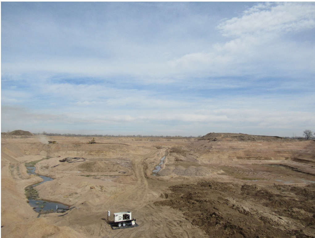
View of Phase 2 excavation from the south side looking northeast