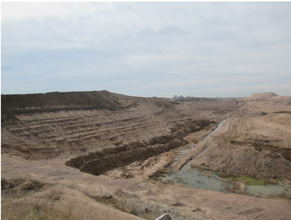
View of Phase 2 excavation from the northeast corner looking south