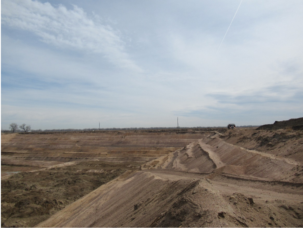
View of Phase 2 excavation from the southwest corner looking east