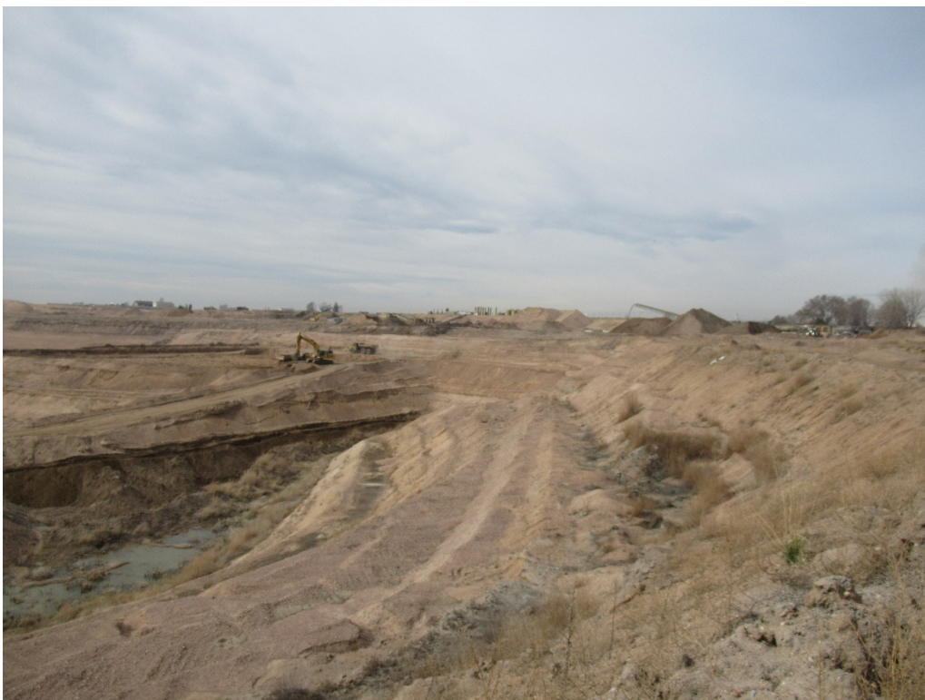
View of Phase 2 excavation from the northeast corner looking west