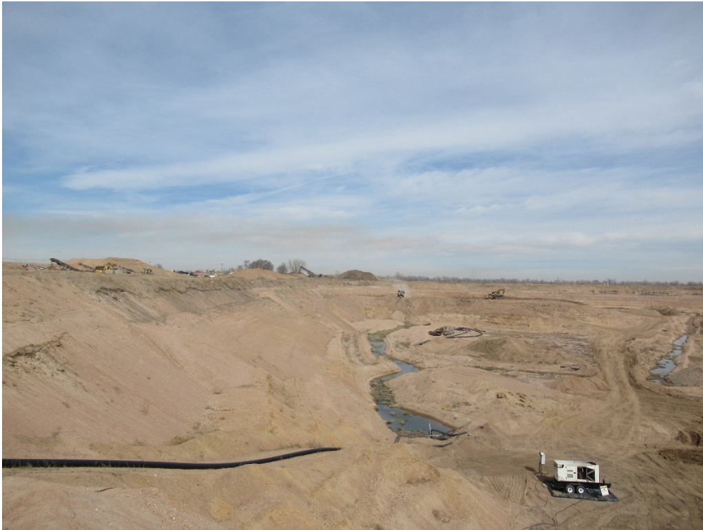
View of Phase 2 excavation from the south side looking northwest