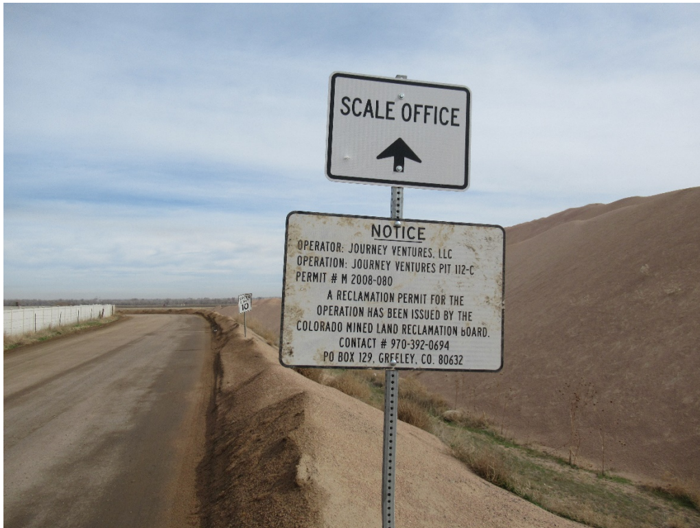
Journey Ventures mine sign