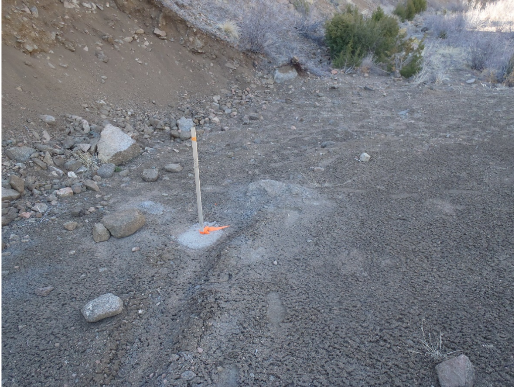
Photo 5. Typical borehole abandonment surface cement plug (drill pad DA-18-13, looking south).