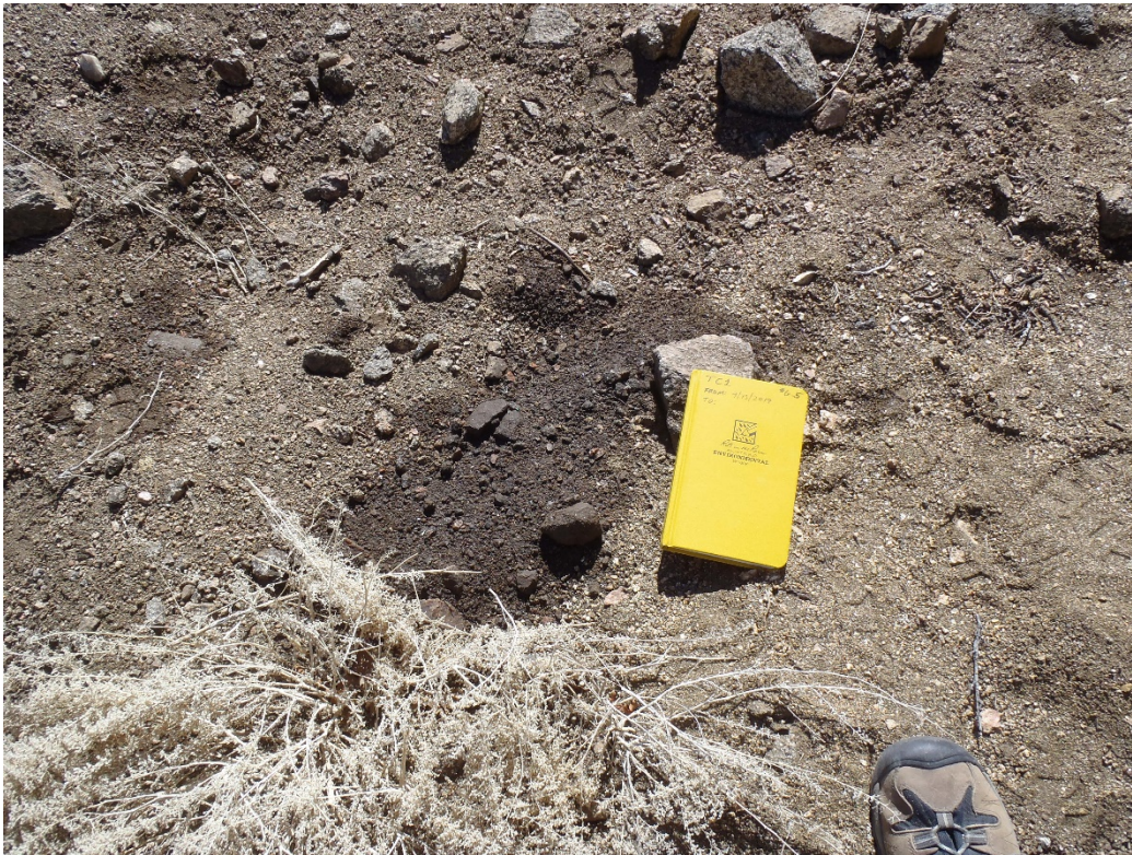
Photo 9. Petroleum product spill on CK-18-08, requiring cleanup.