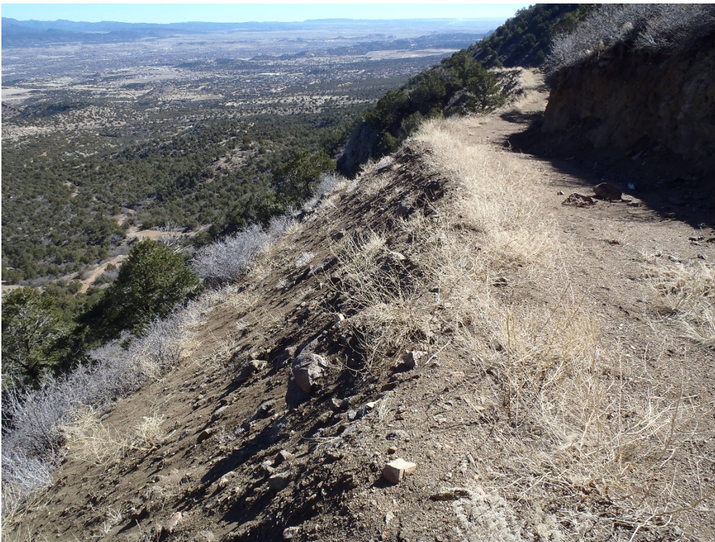
Photo 4. Typical access road cut and cast construction (between DA-18-14 & CK-18-08).