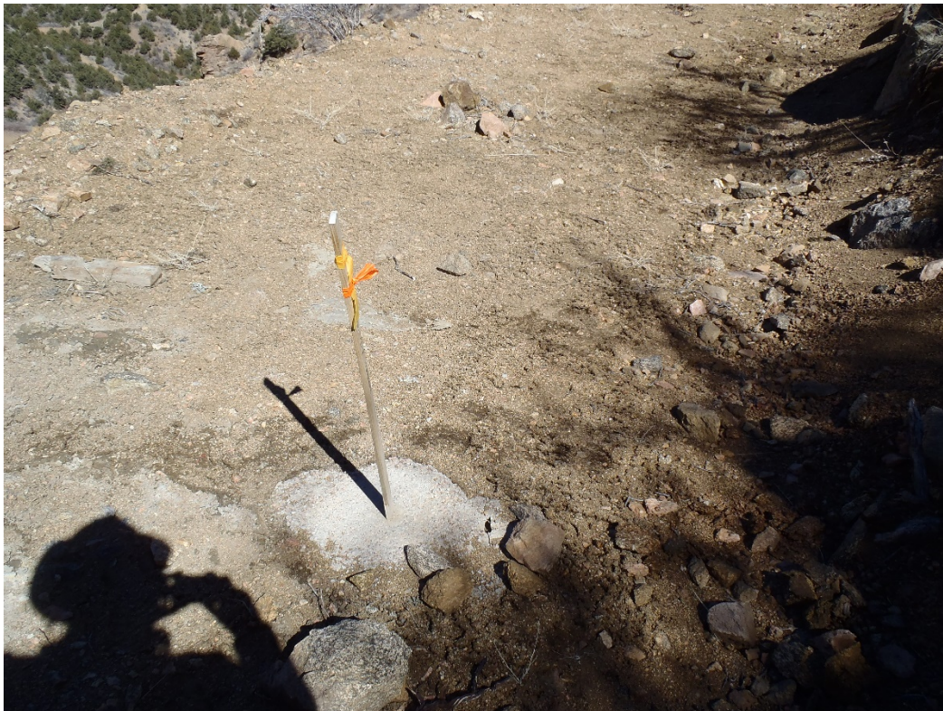
Photo 6. Complete mud pit backfill (drill pad WG-18-37, looking north).