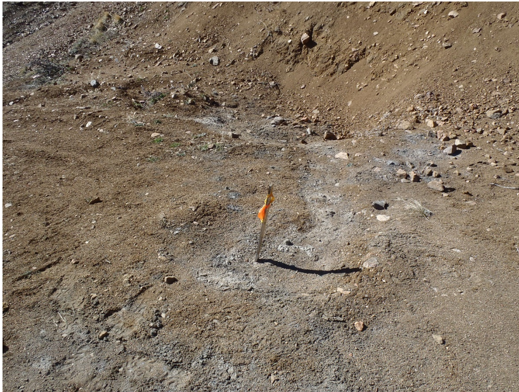
Photo 7. Partial mud pit backfill (drill pad DA-18-16, looking south).