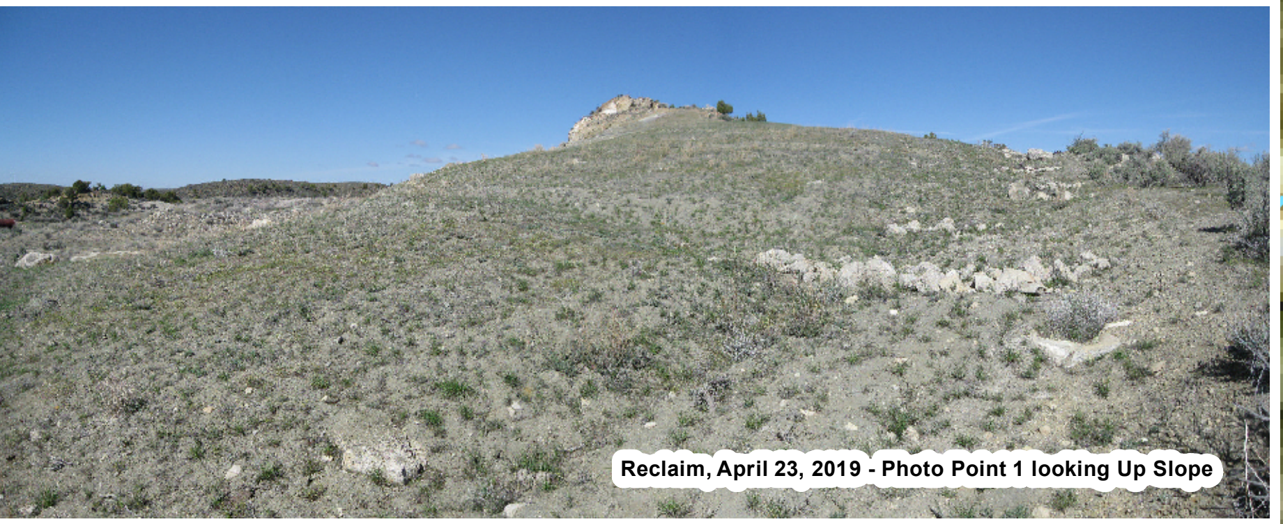
Reclaim, April 23, 2019 - Photo Point 1 looking Up Slope